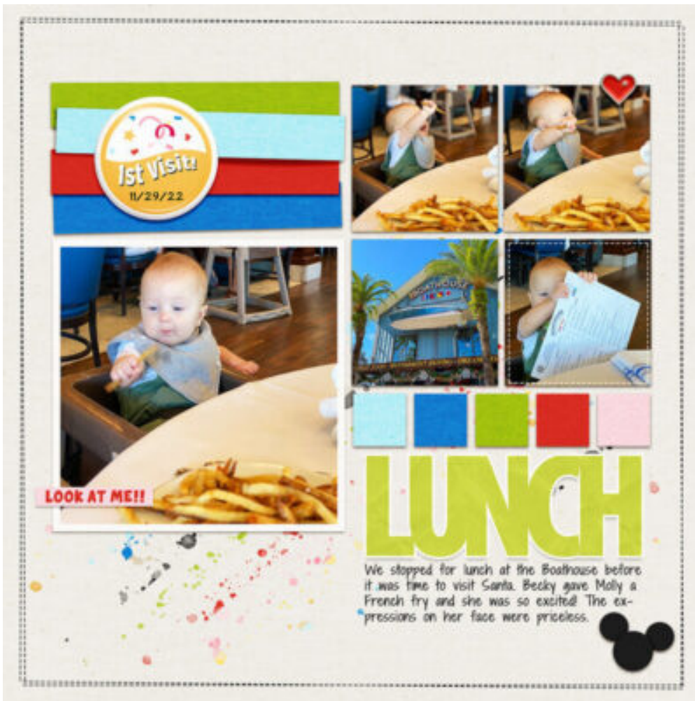
Layout by Donna