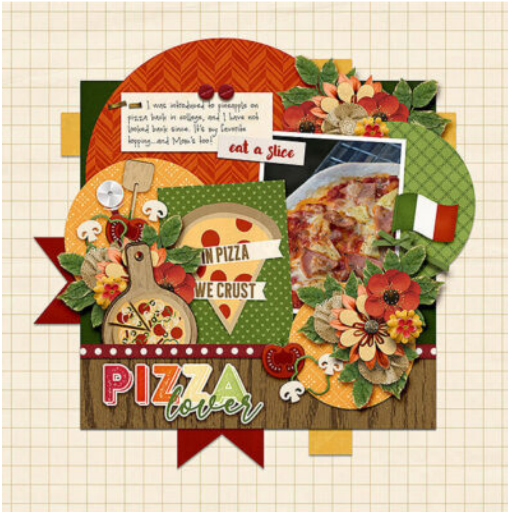
Project by Zippyoh