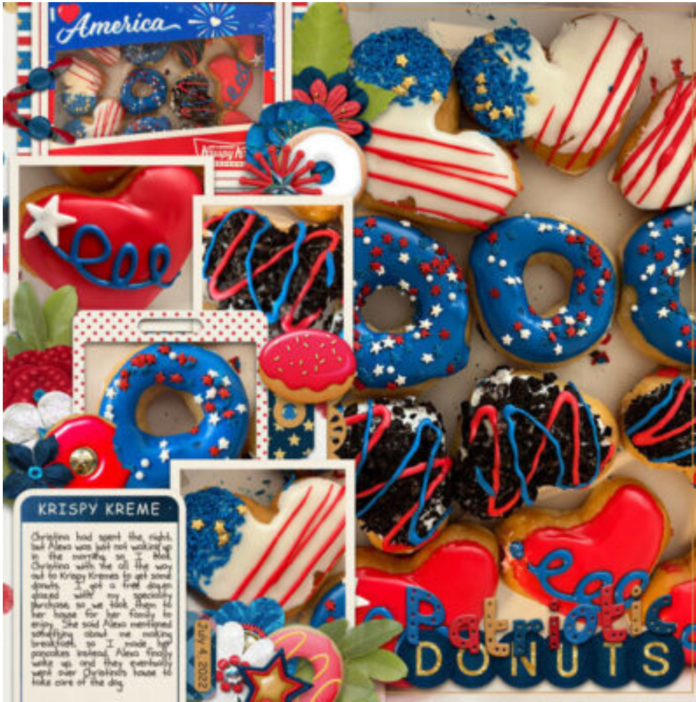
Layout by LynnZant