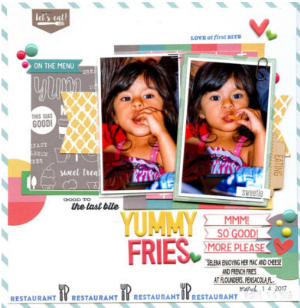
Layout by SJ Luvscrappin