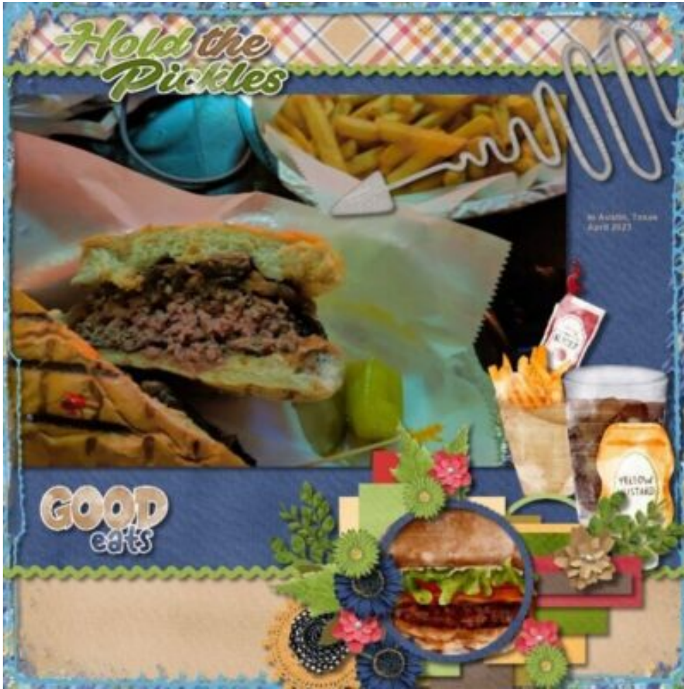
Layout by Maureen