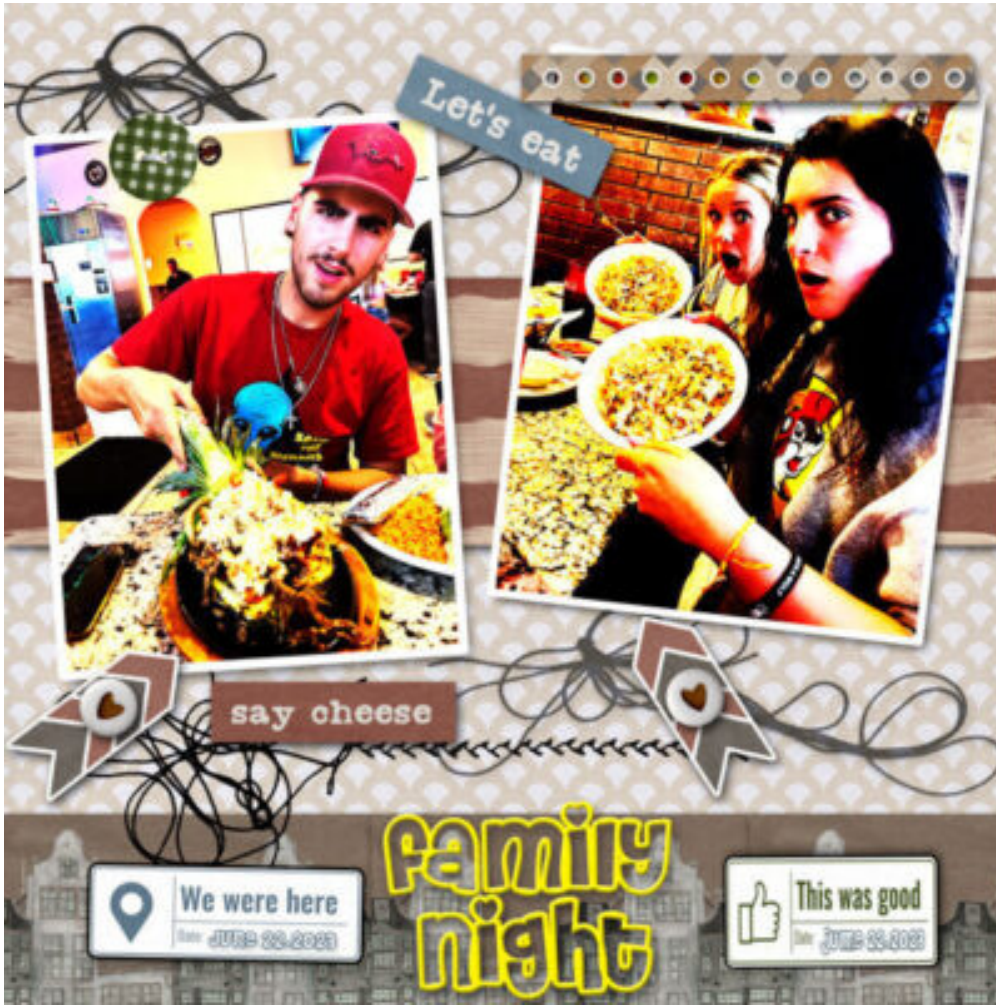
Layout by Cheryl