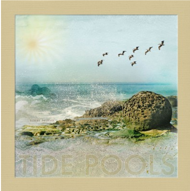
Layout from tylertoo