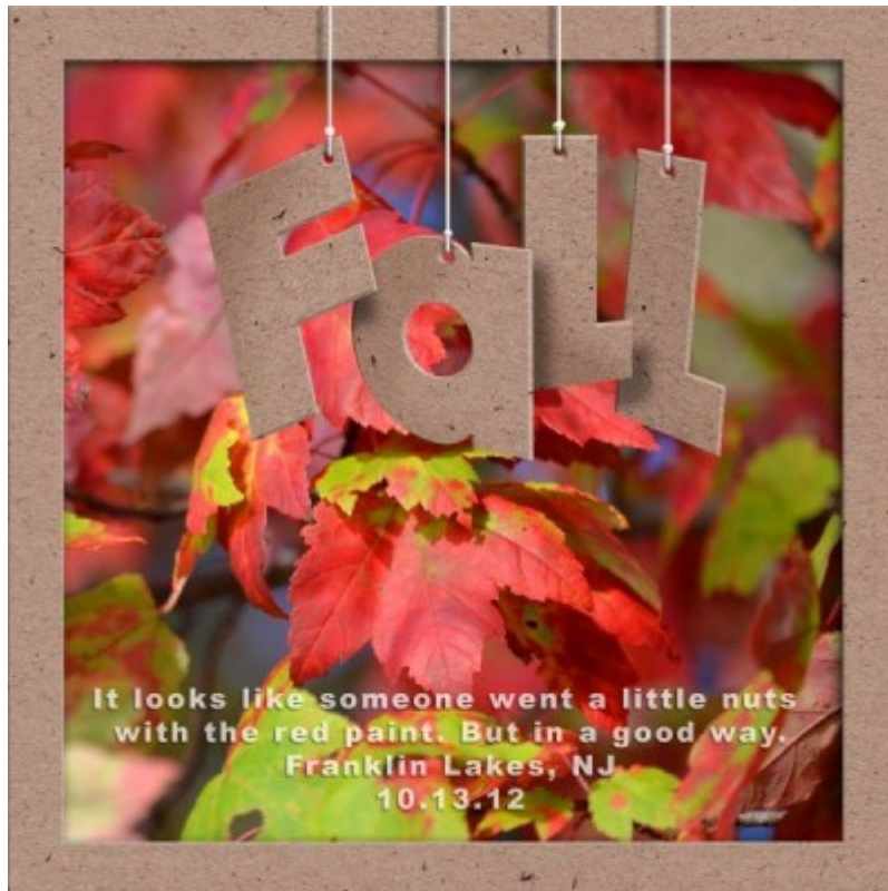
Layout from StefDesigns