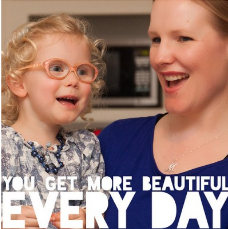
Layout from Melissa