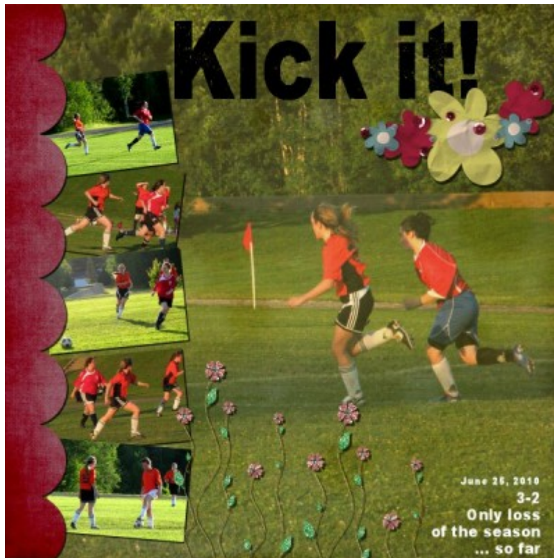
Layout from Cassel