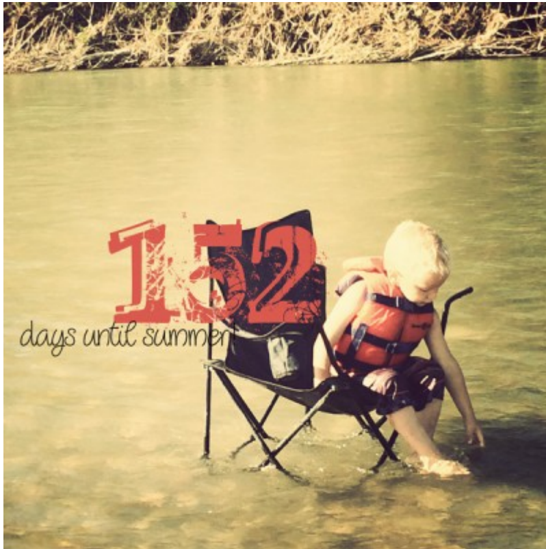
Layout from justjen8

There might be other ways or reasons you can use a large photo. Maybe you just like to use big photos. And that is quite ok too. But remember that with digital scrapbooking, you have a great advantage over traditional paper scrappers, in that you can use photos as large as your whole layout, and if you have the photo for it, why not take advantage of it. Minimal decorations will just let the photo speak, and if a photo is worth a thousand words, you might have a great story on your page!