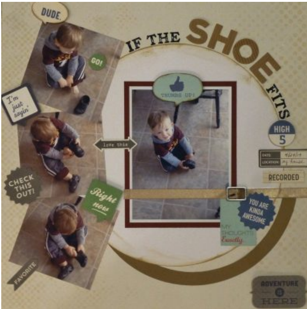
Layout by Marci