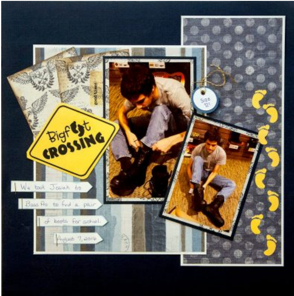
Layout by Lyn