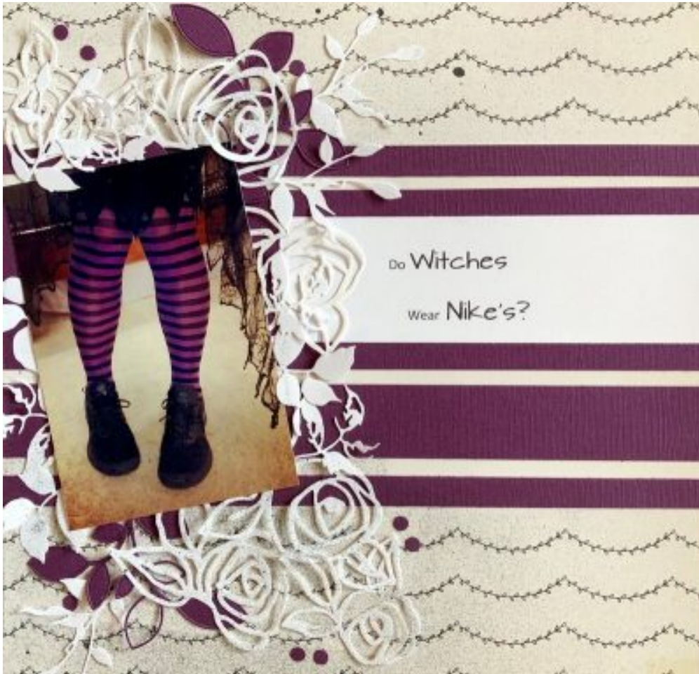
Layout by Mylillybug