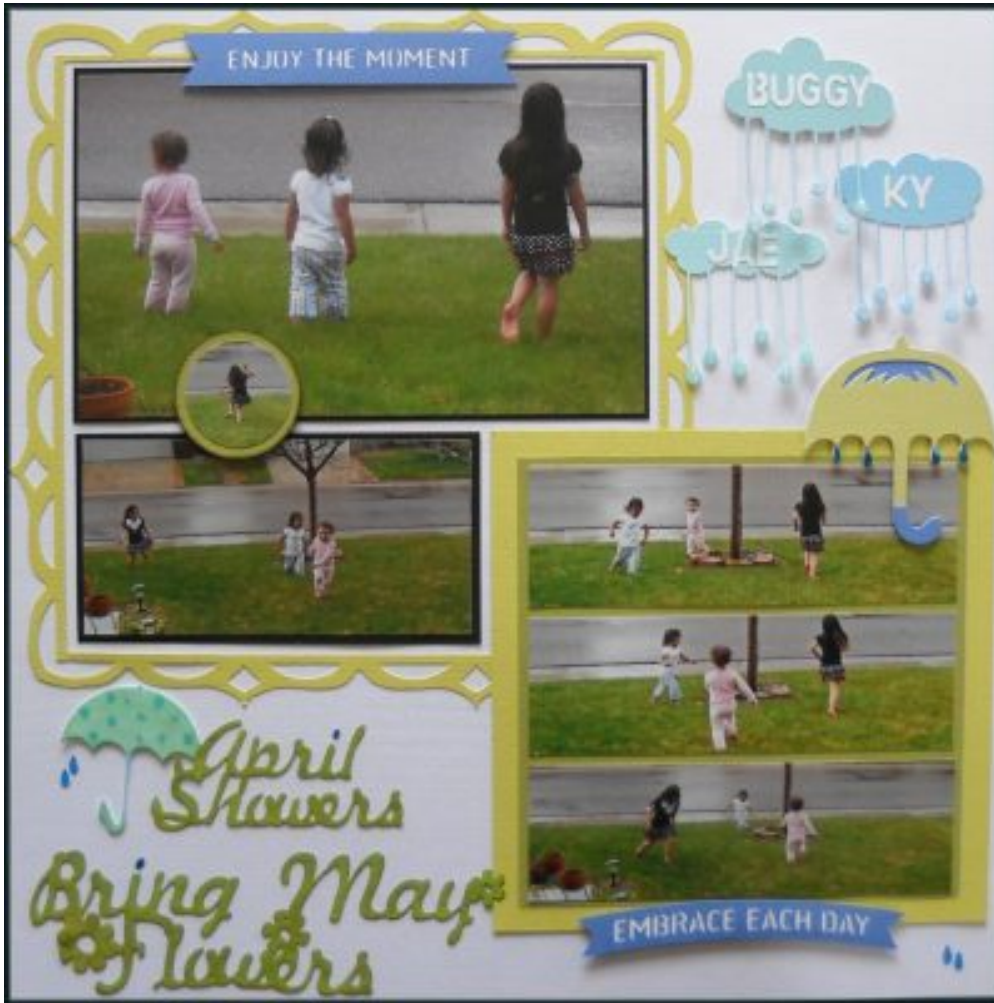
Layout by Trish