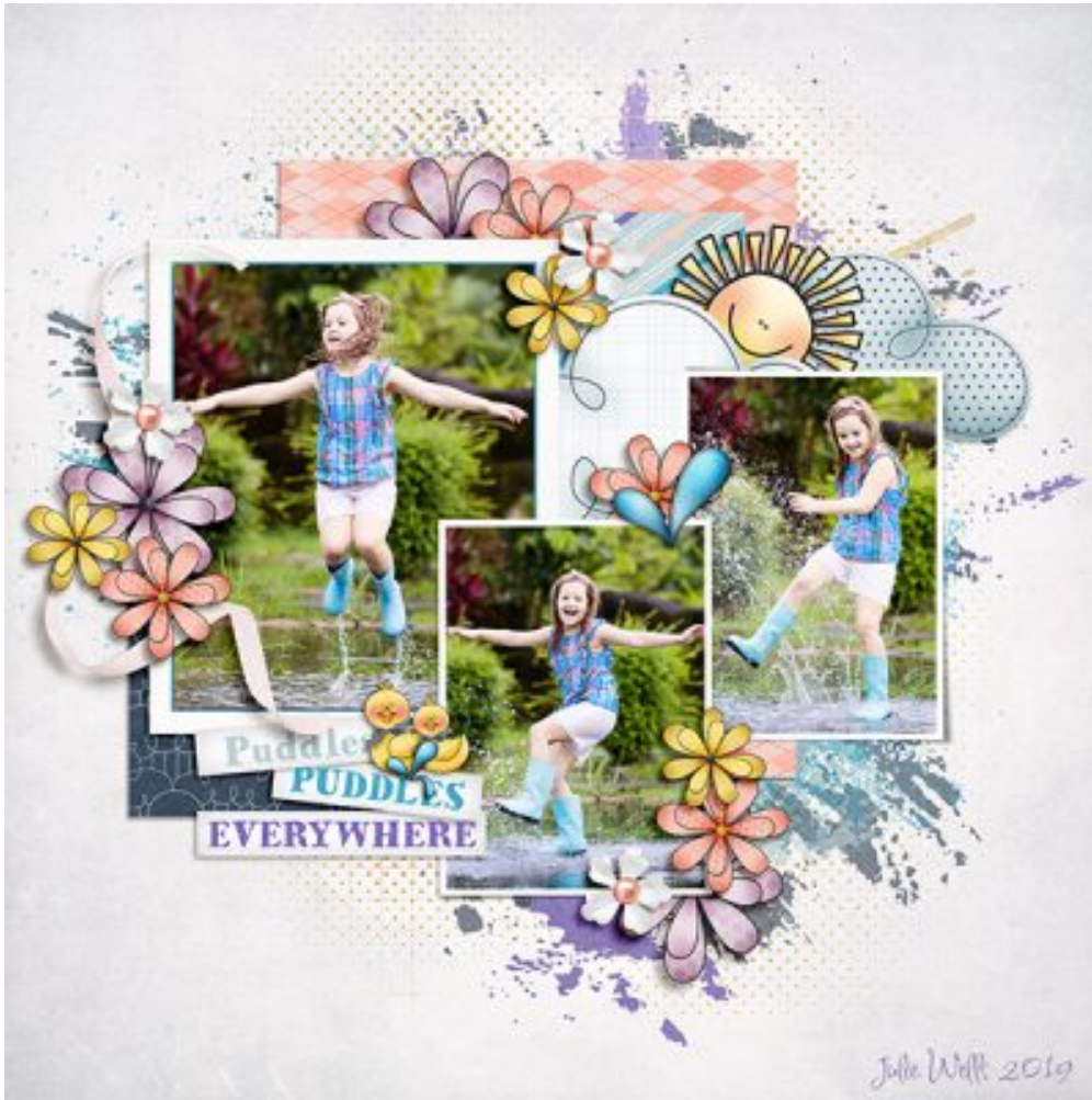
Page by My Bear