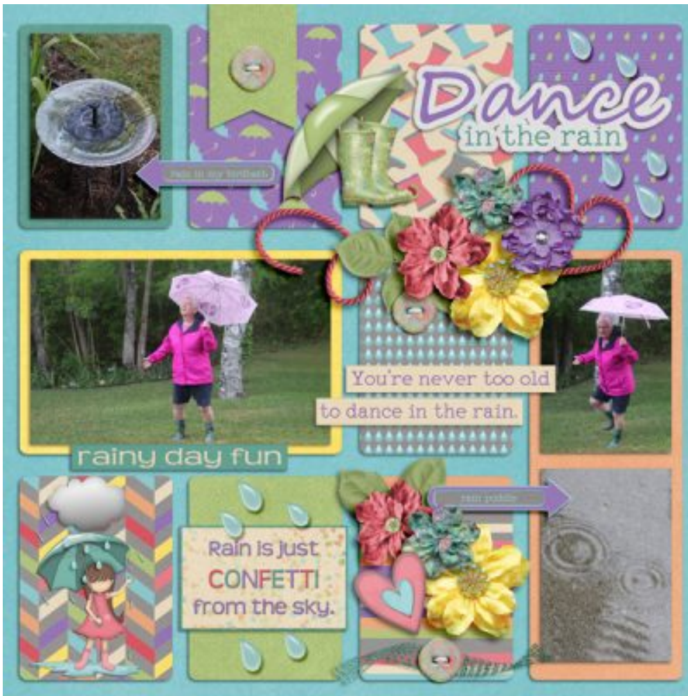
Layout by Betsyfru