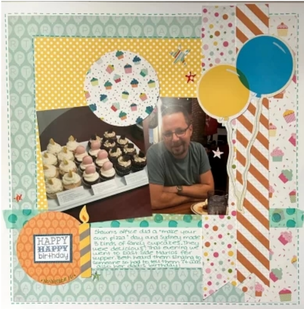
Project by Scrapanda