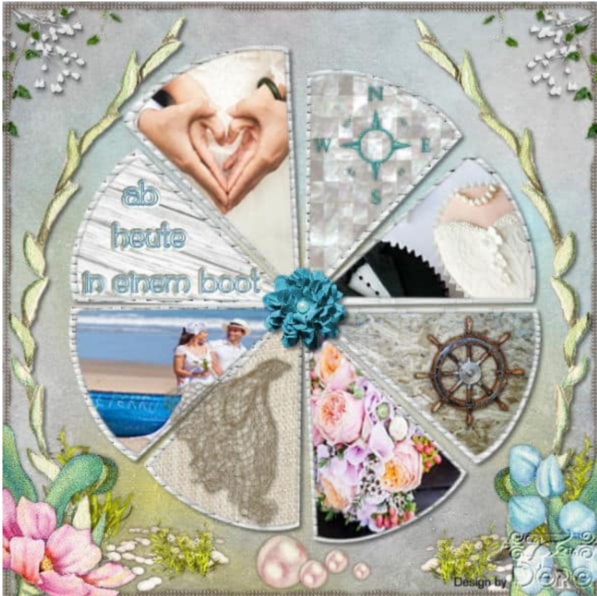
Layout from Doska