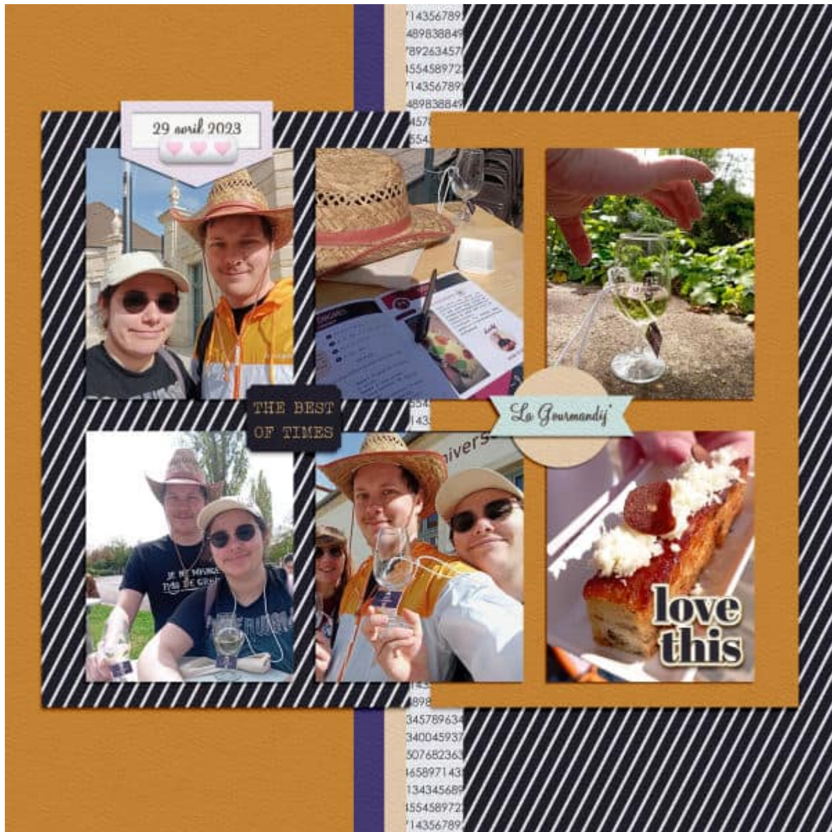
Layout by AMarie Charp

Balance is a concept a bit less obvious than alignment or repetition. Yet, it does influence your project. You might use a balanced design without even realizing it. Have a look at your favorite projects and see if you did use this concept spontaneously. And for your next pages, just try to observe how you are choosing, aligning, and layering your components. Maybe you will just add a few tweaks to make it even better.