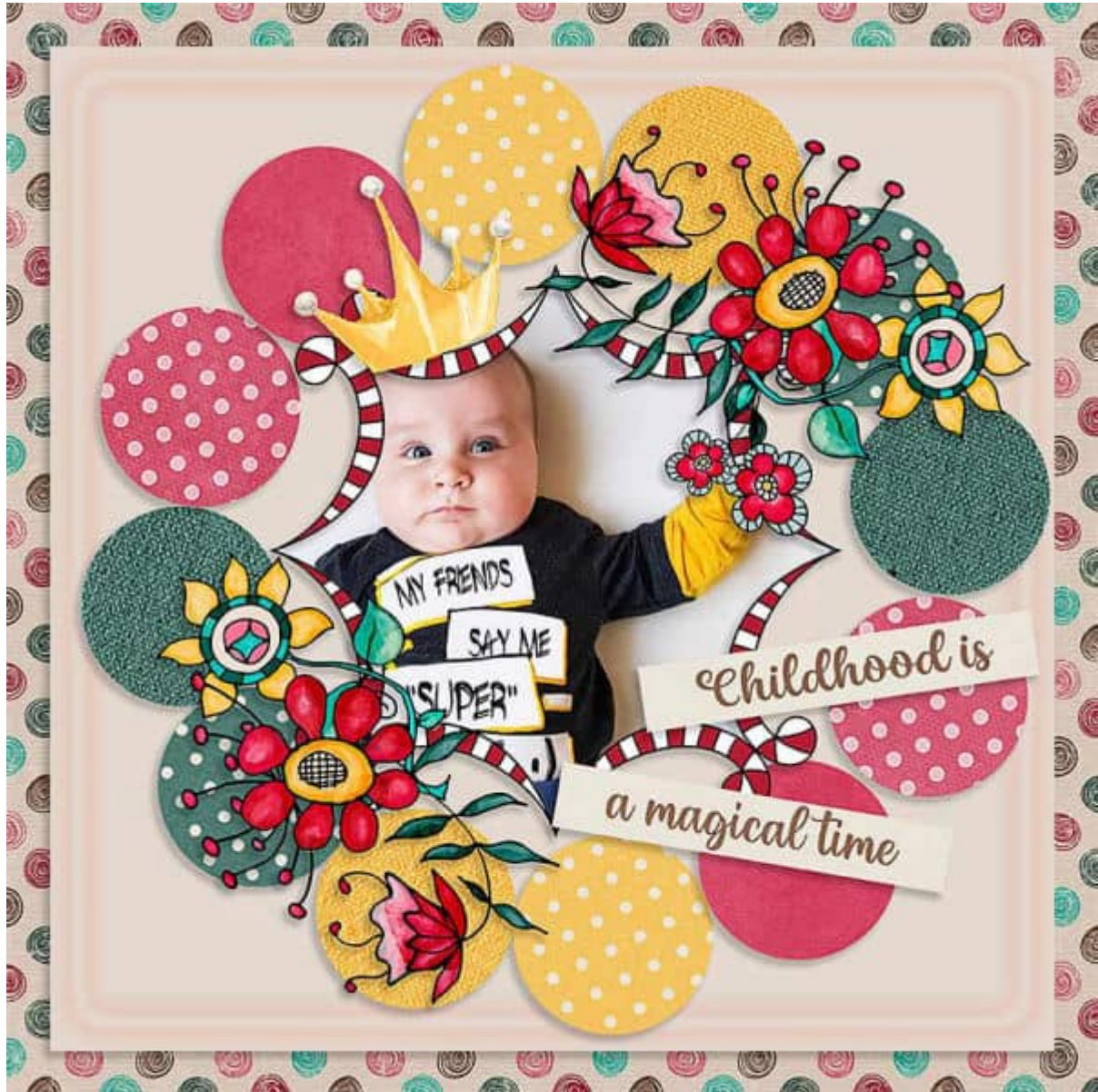
Layout by Valentina Zotova