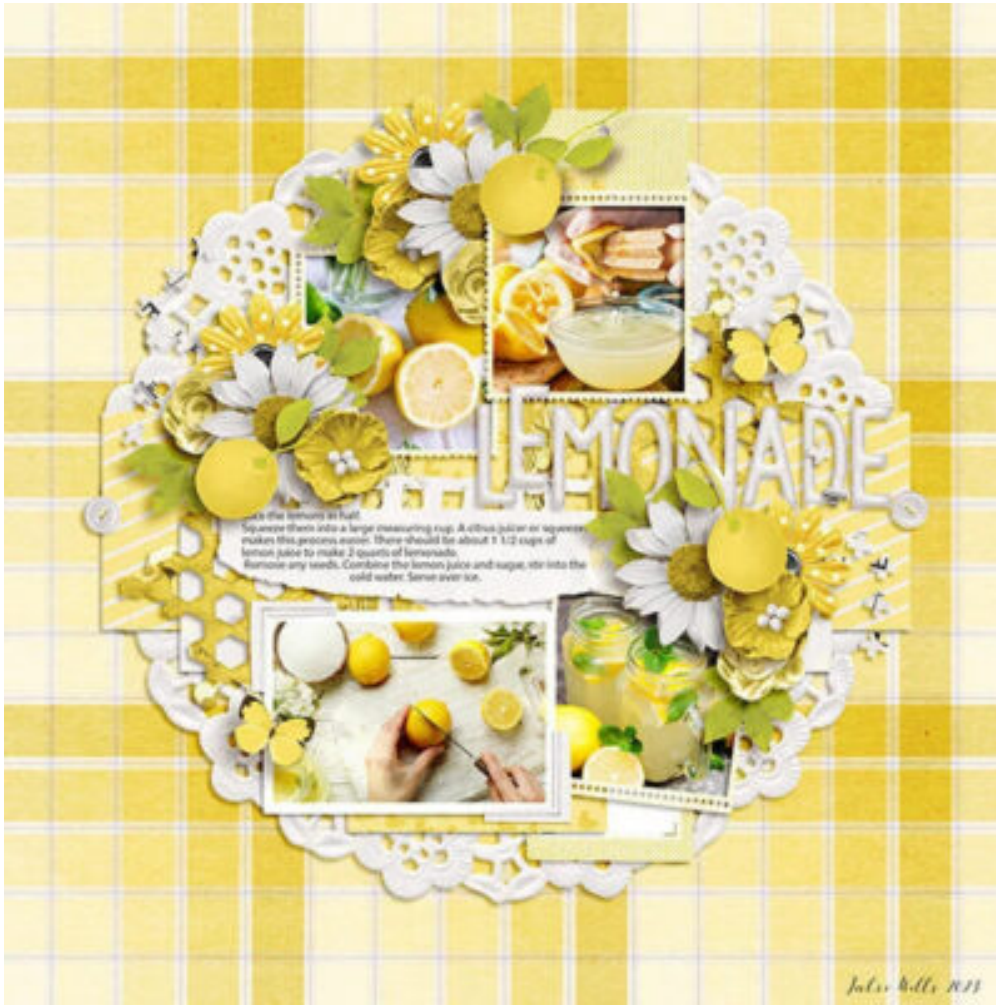
Layout by Julie