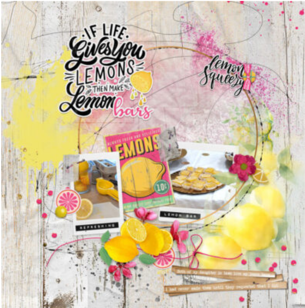
Layout by TiffanyScraps