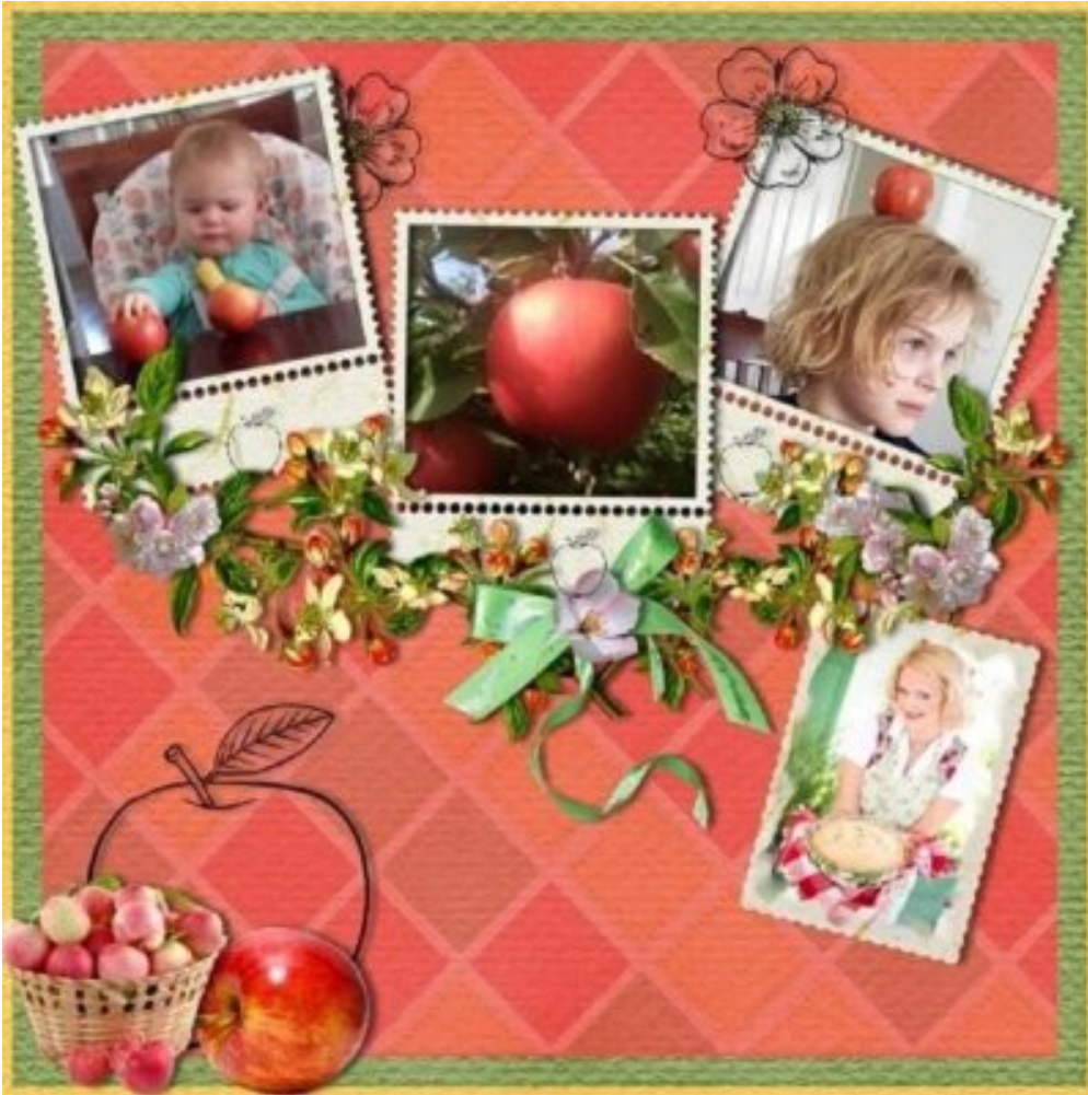
Layout by Maureen