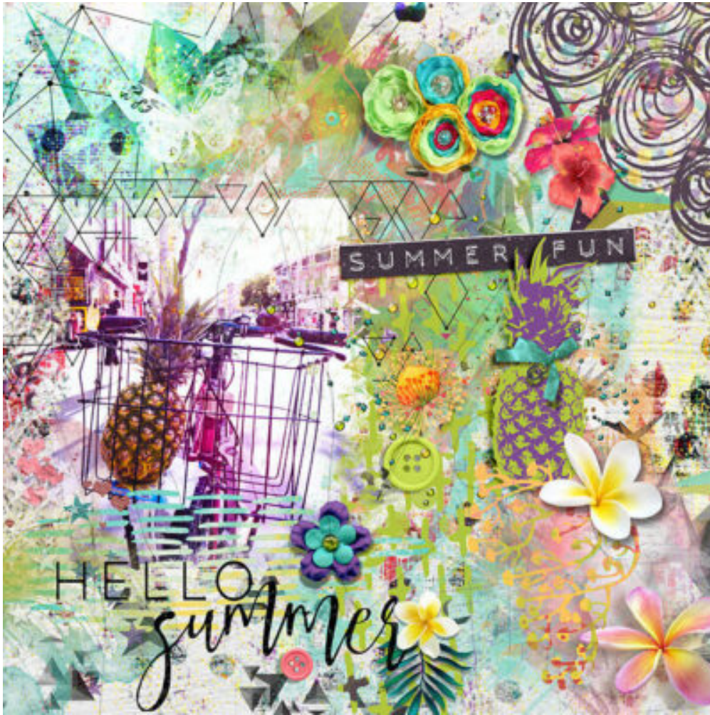
Layout by Cinderella_cindy