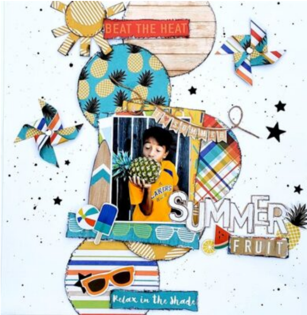
Layout by Scrapsnstuf