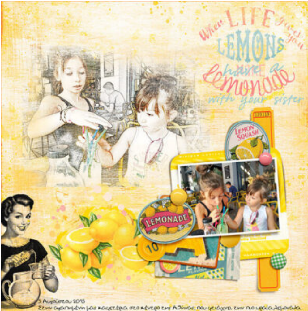
Layout by Cinderella_cindy