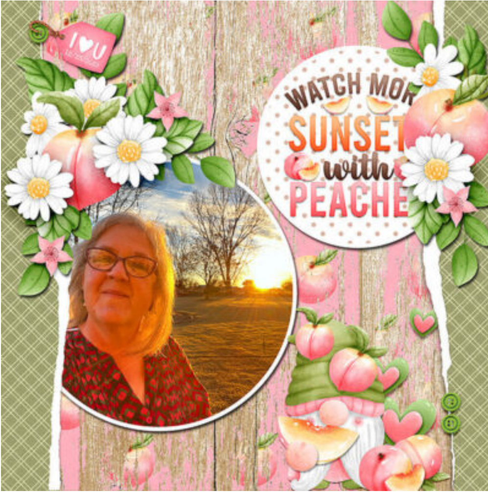
Layout by Kim