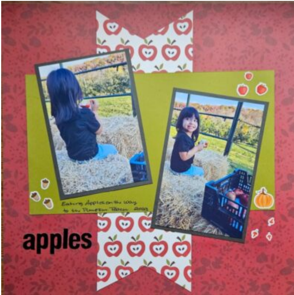
Layout by Coleen