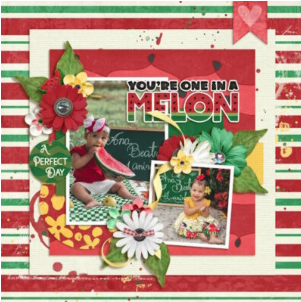
Layout by Lou