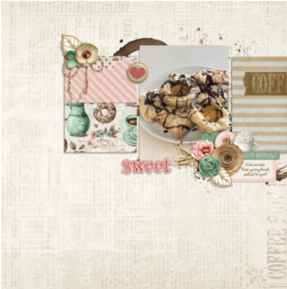
Layout by Lou