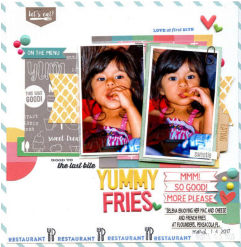
Layout by SJ Luvscrappin