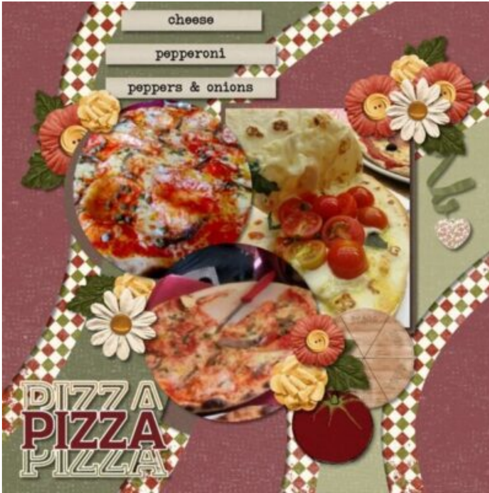
Layout by Maureen