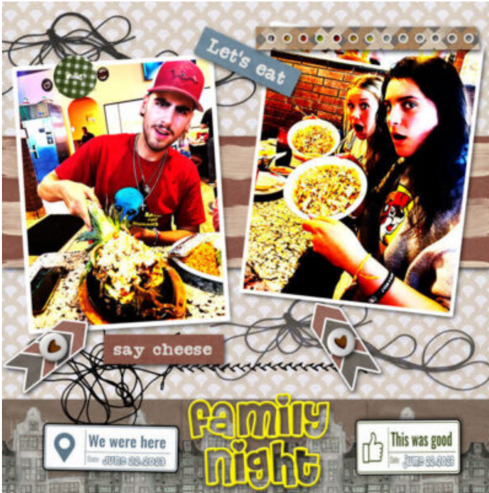
Layout by Cheryl