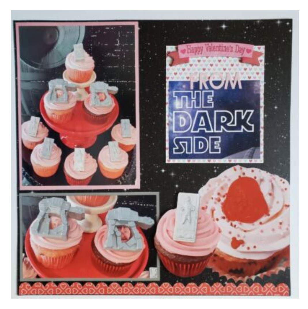
Layout by 2manypages