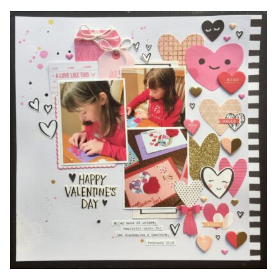
Layout by Tina