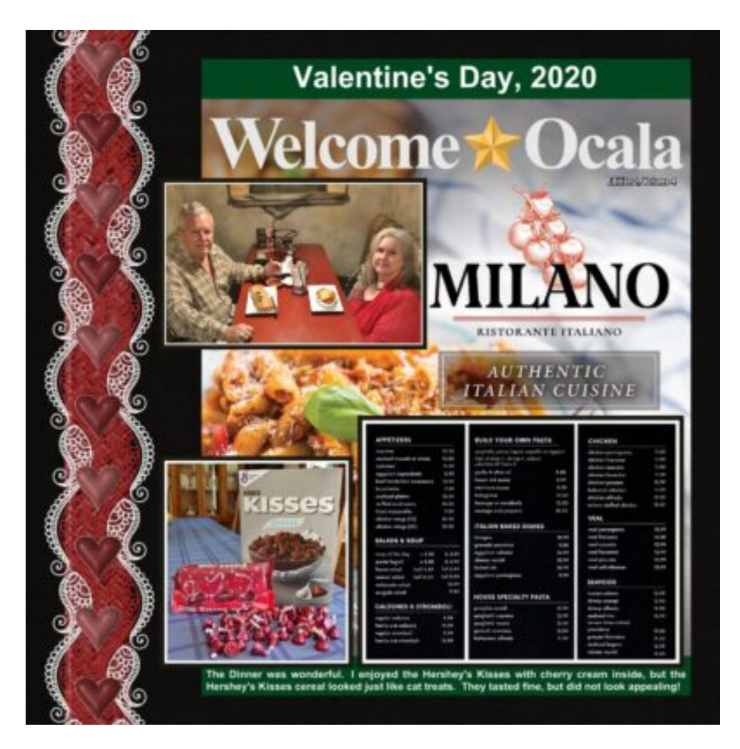
Layout by Henri