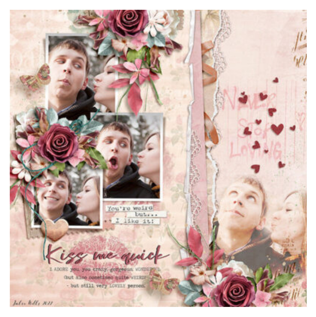
Layout by Julie