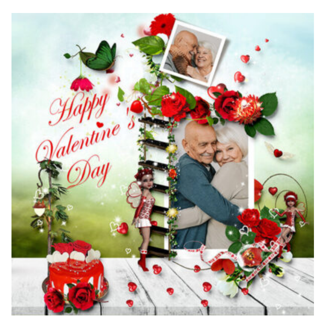
Page by Ida