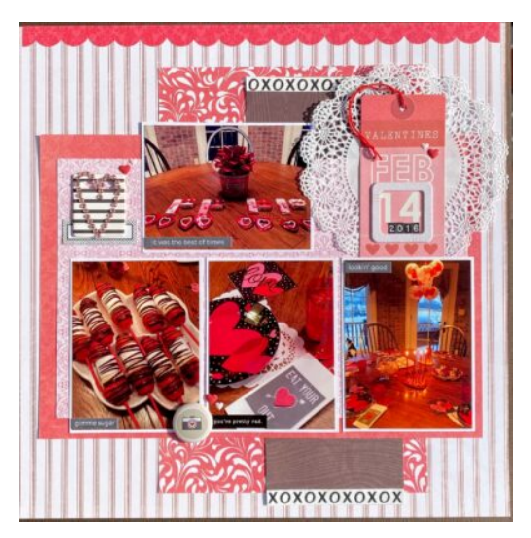
Page by Mollie