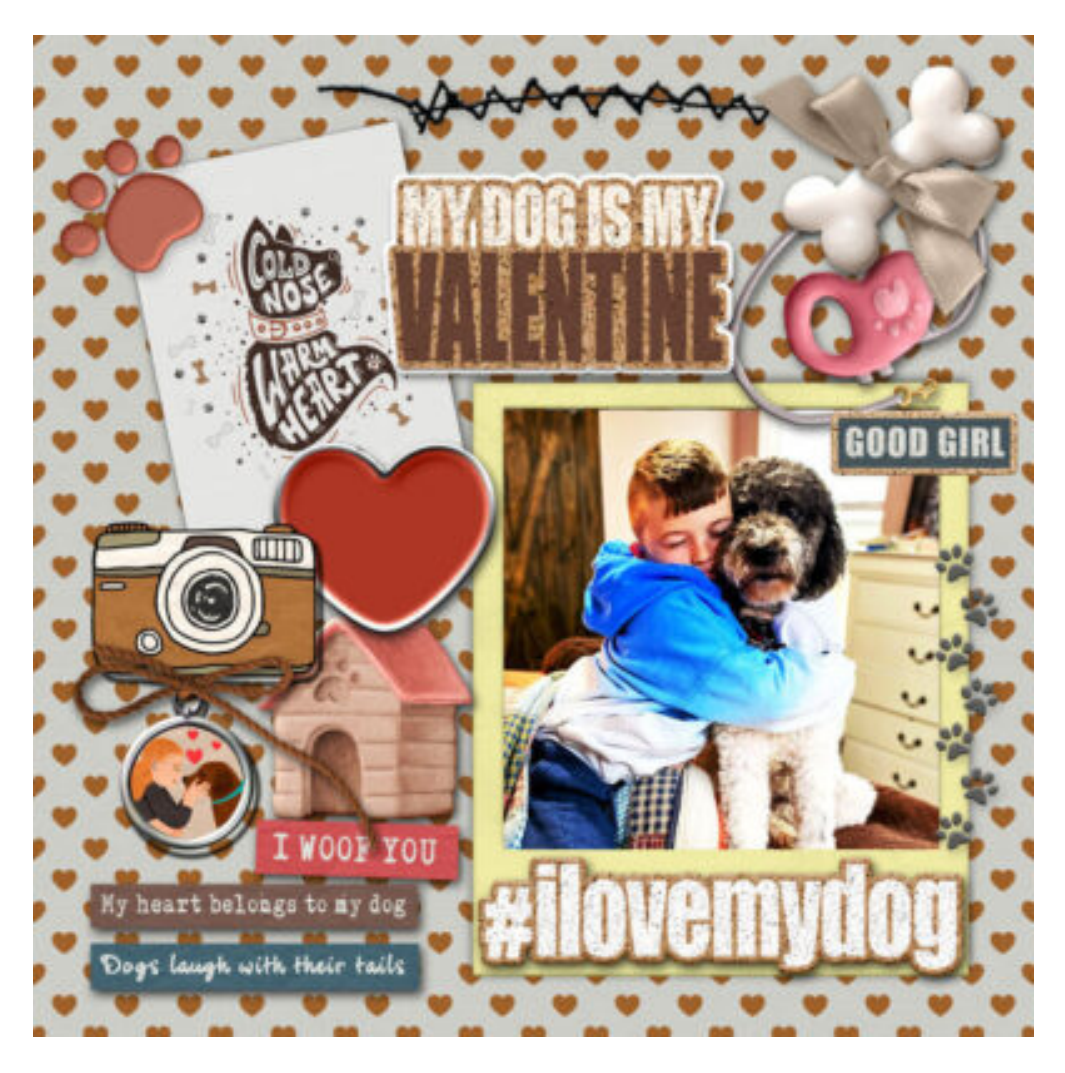
Layout by Cheryl