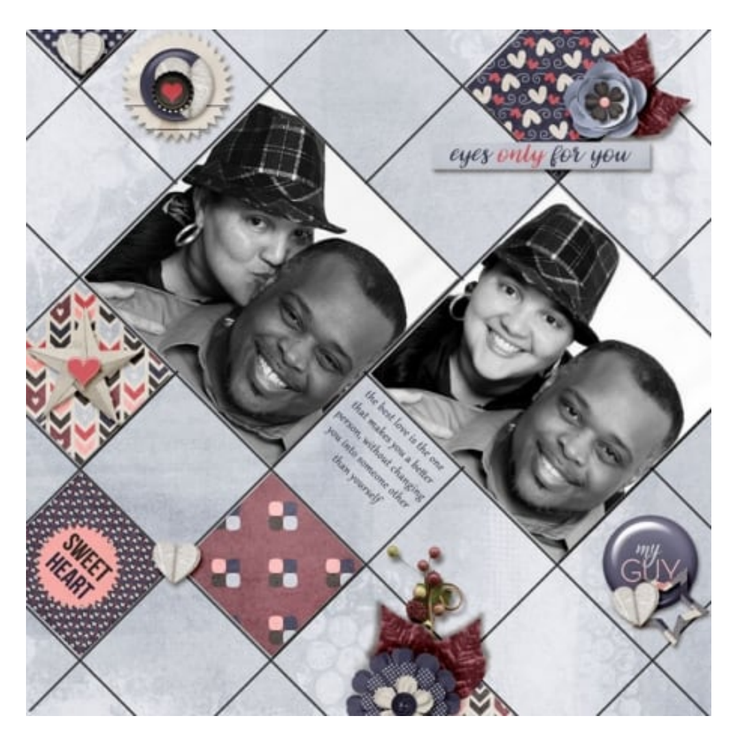
Layout by Kiana