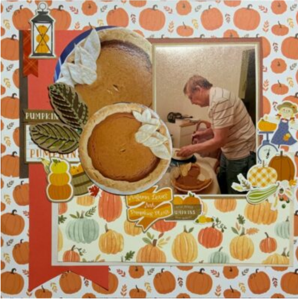
Layout by Lis