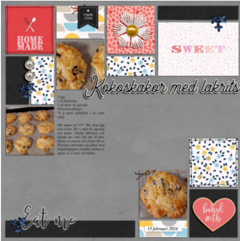
Layout by Eva