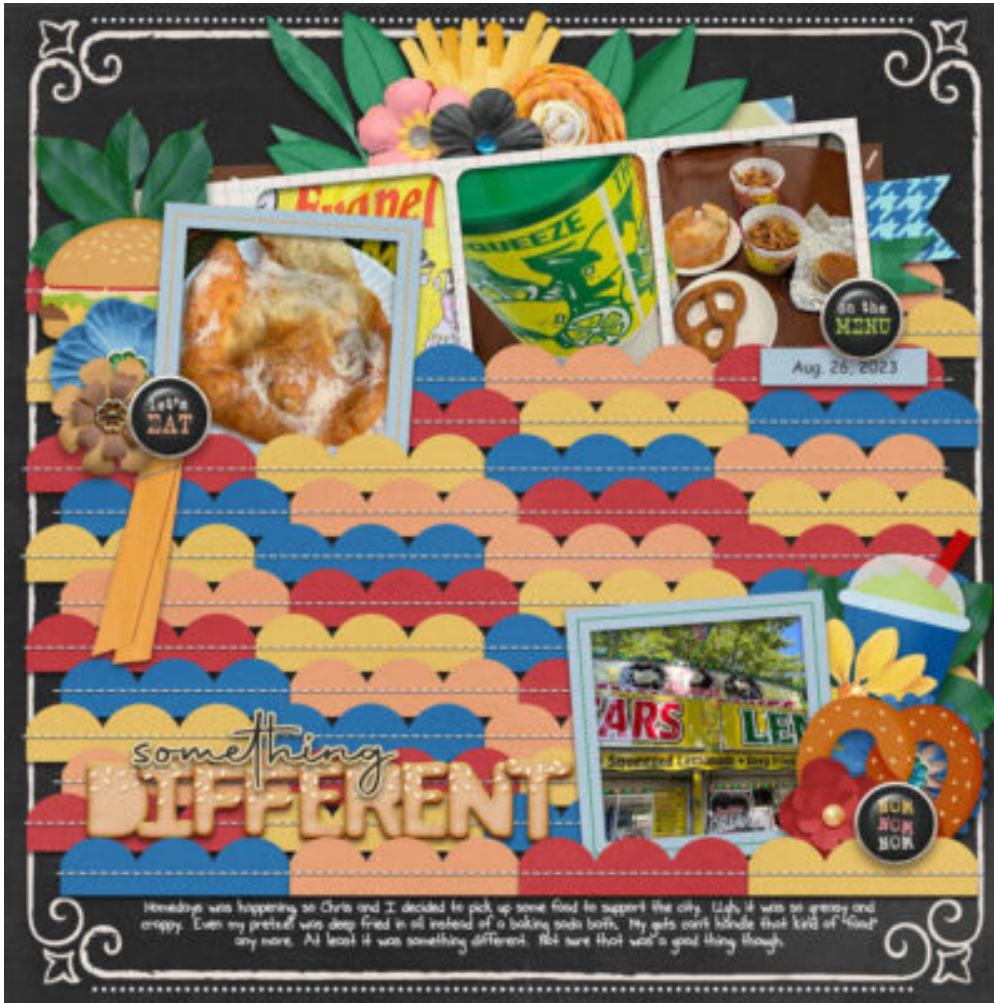
Layout by Lynn