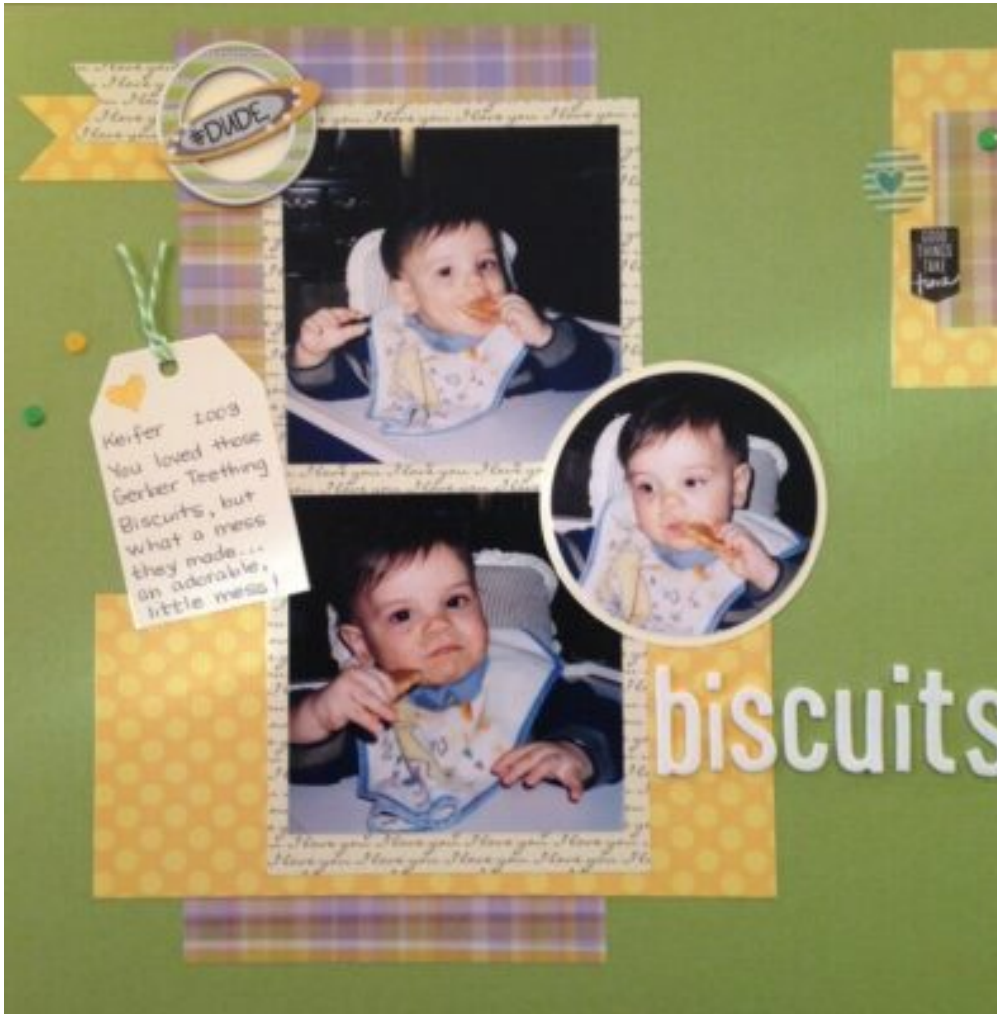
Project by ArtsyLC