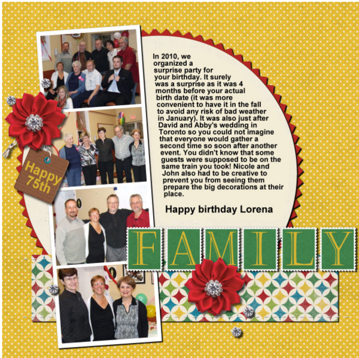
Layout from Carole A.