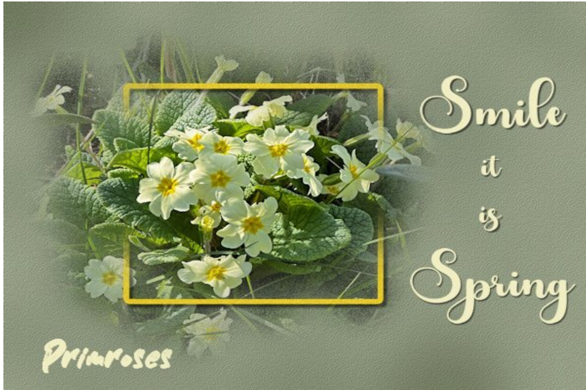
Layout from Corrie K.