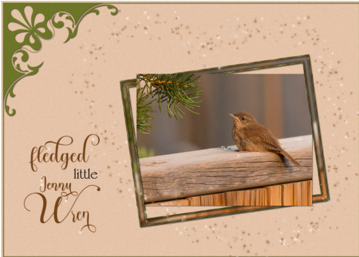
Layout from Sue Thomas

Another very interesting twist in the types of frames is the "broken" one. This effect is from the use of a mask and a separate frame that is partially erased giving this unique look.