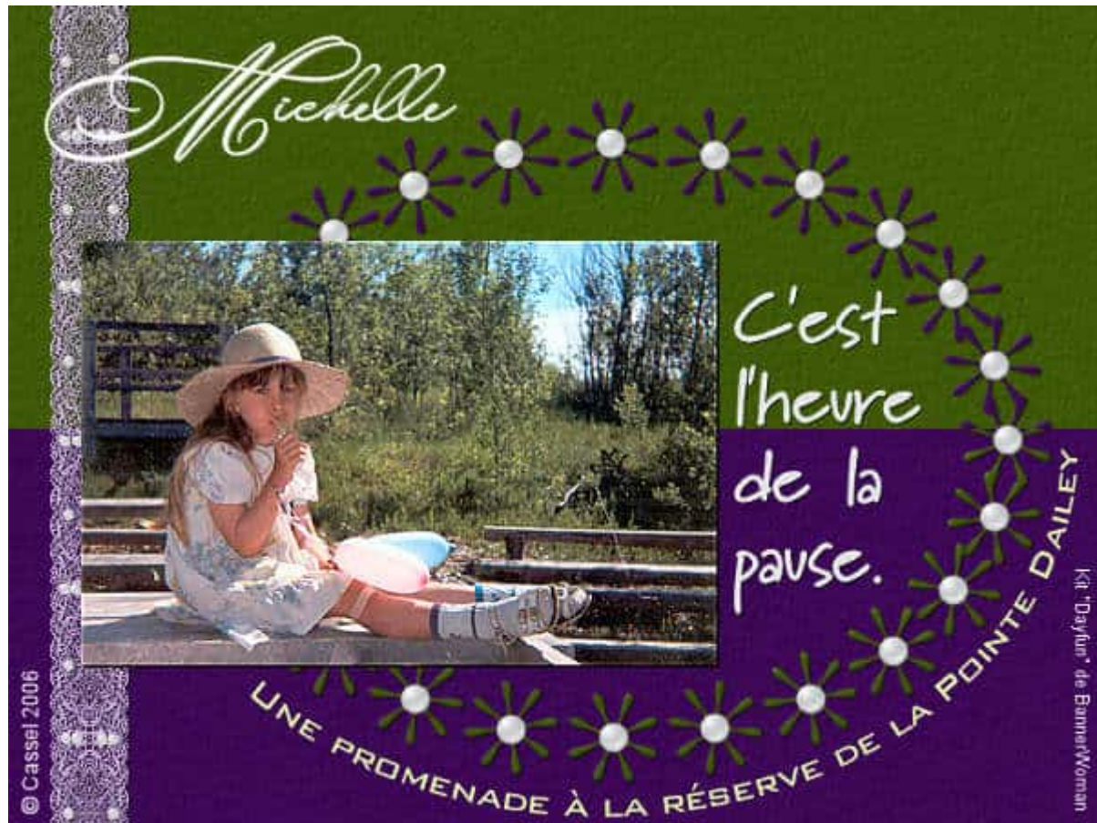
Layout from Carole A.

Another variety in the type of frames is the number of photo spots. Although single frames are the most common, you can have double or triple frames. Photobooth and film strips are some of those multiple frames that are commonly available.