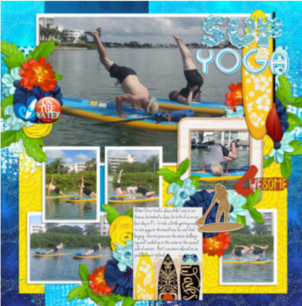
Page by Knjclark