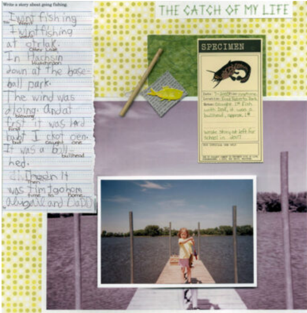
Layout by Carlsoc2ckkc