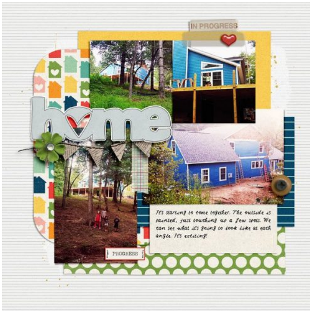
Layout by Liz