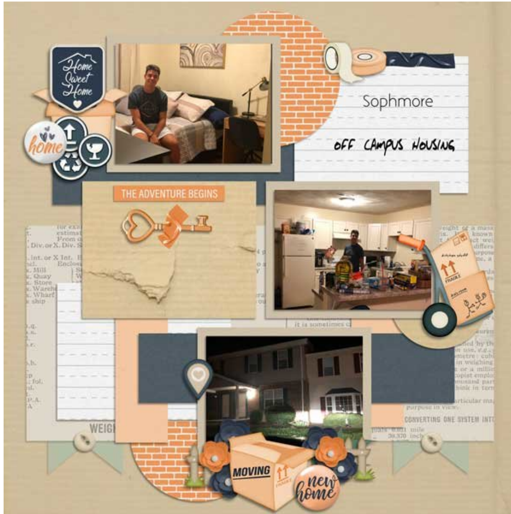
Layout by Paula