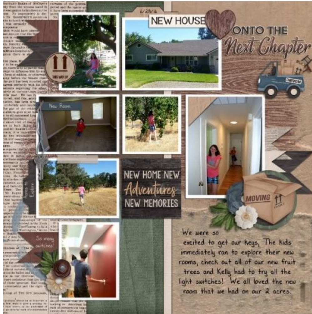
Page by Meagan