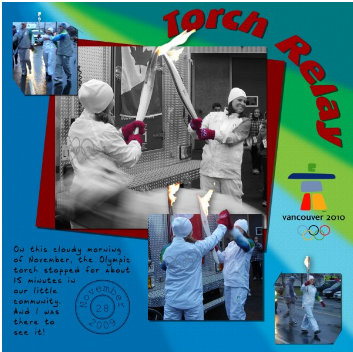
Layout from Carole Asselin (Cassel)