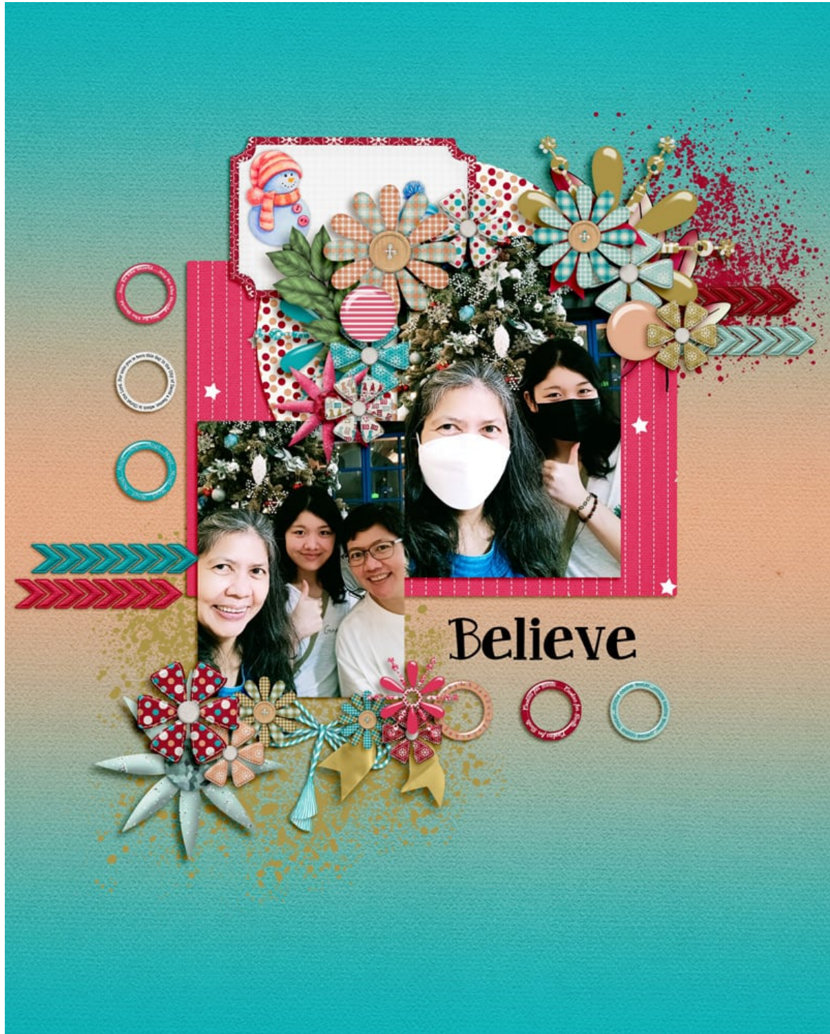
Layout by Marlyn Ramirez

Sometimes, even a fairly monochrome project can use contrast in display light and dark shades of a color.