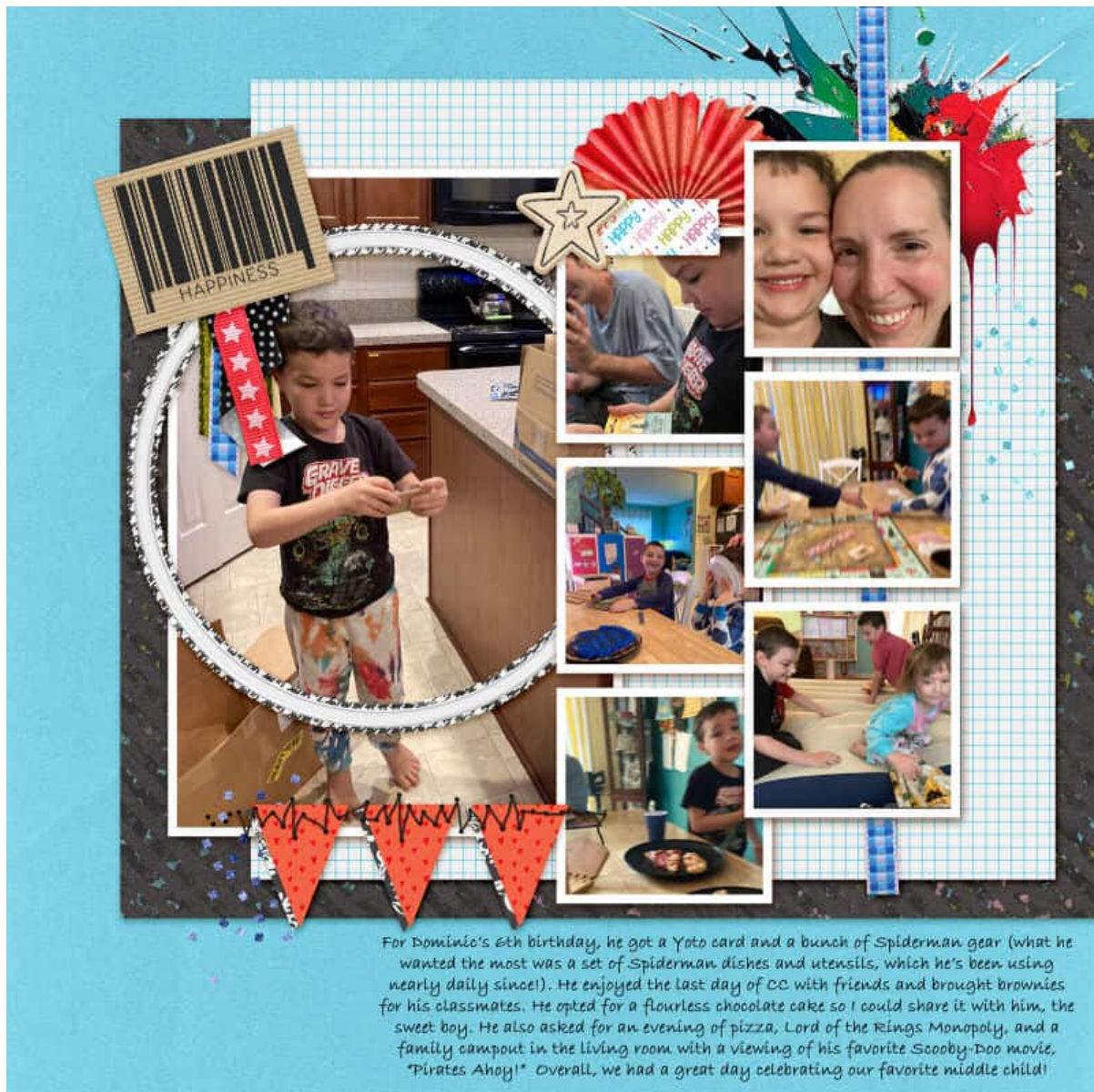
Layout by Beck Wooler

What kind of contrast do you tend to use? Colors? Pattern? Shape? Maybe even something else we didn't look into? Now, look at some of your favorite layouts and see if you can identify the use of contrast as a design principle .