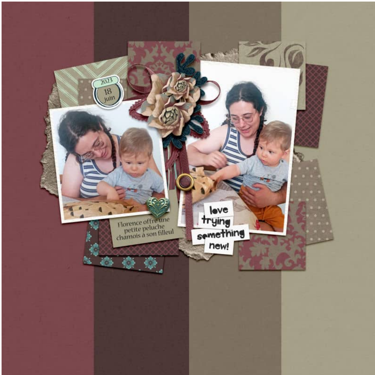
Layout from AMarie Charp

Patterns come in different sizes and combining large and small ones is another way to use some contrast.