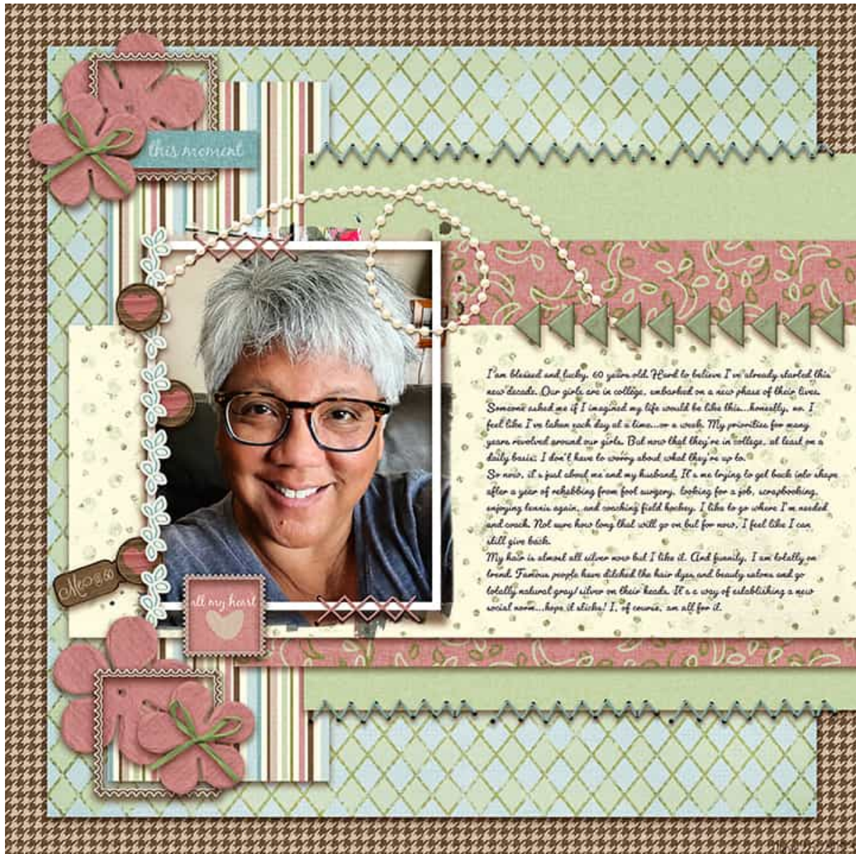
Layout from Linda2 Dlr

For a larger effect, you can also contrast different shapes for your layout. It could be the shape of the elements or the photos. Again, it makes the layout visually interesting.