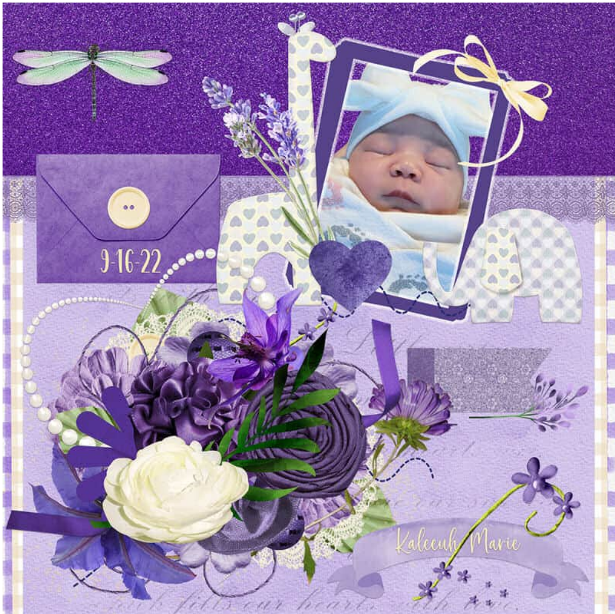
Layout by Jenifer Lyn

Although it could seem like complimentary colors, you can also see the contrast between warm (reds and orange) and cold (blues and greens) colors. Those can create a pleasant contrast.