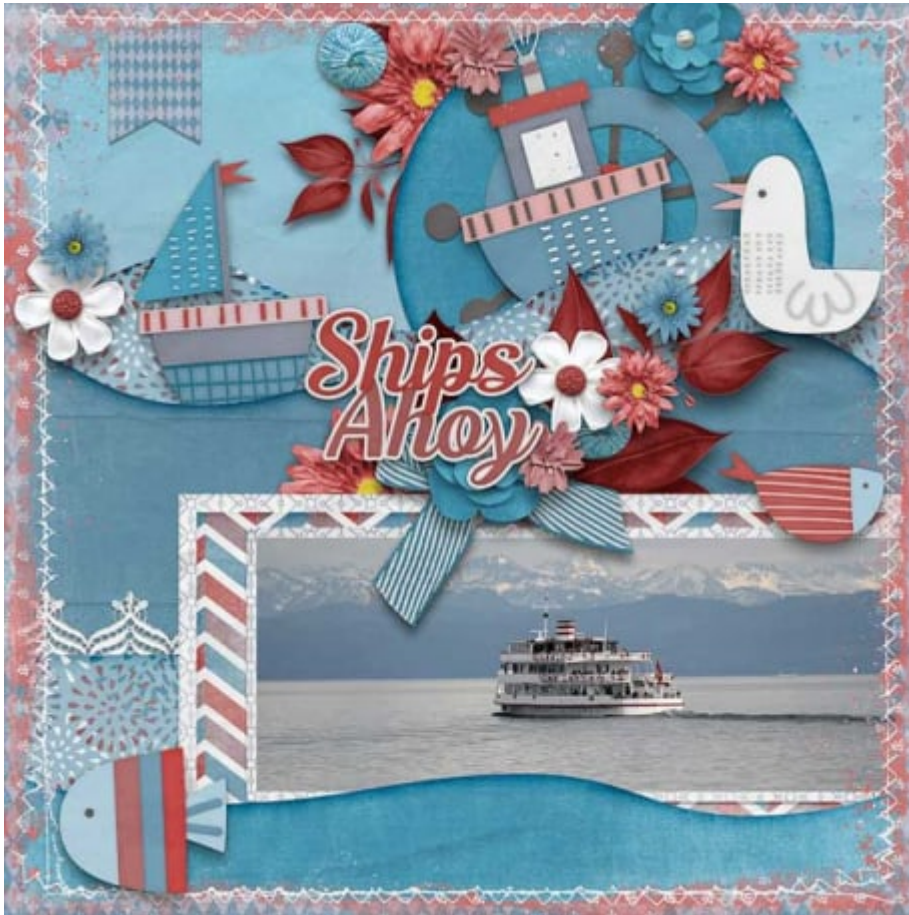
Layout by Kabra Langen

And why not contrast from a black and white photo with a colorful page? That is another way to contrast using colors.