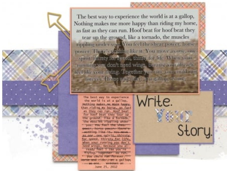
Layout from Jill Utrup

And if you are unsure about the small size of a journaling card, you can always enlarge it, especially if you are using PSP2021 or above.