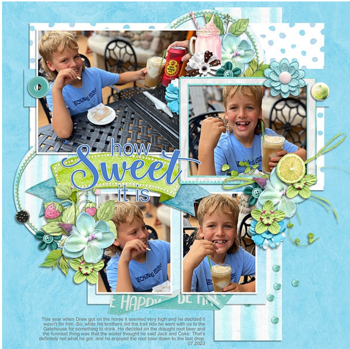
Layout by Beatrice Loren

Place larger or more prominent elements strategically to capture attention first and then lead the eye towards smaller or supporting elements. This hierarchy of elements creates a natural progression and flow within the design.