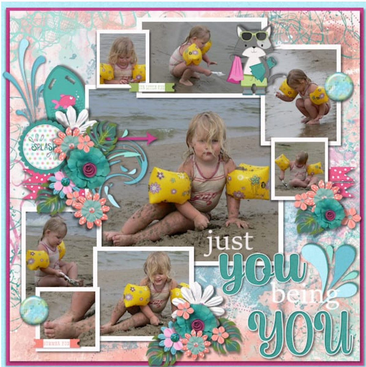
Layout by Deanna Patterson