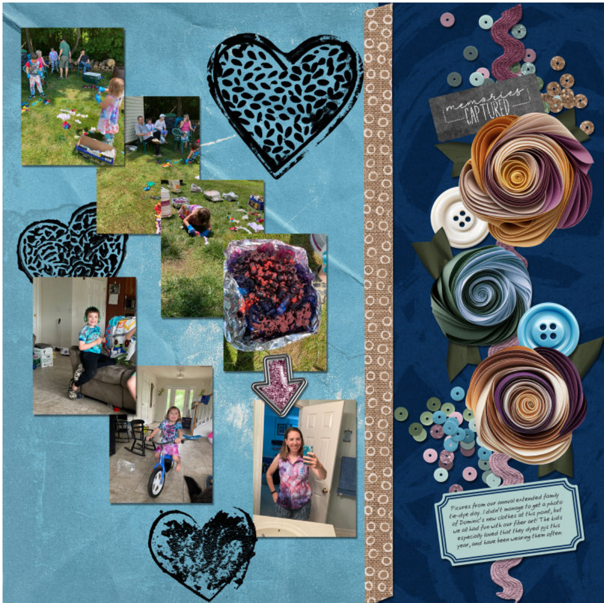
Layout by Becky Wooler

Here is an example of arranging elements in a gradual progression of size, either increasing or decreasing. You could use images, but also elements like flowers, buttons, or tags.