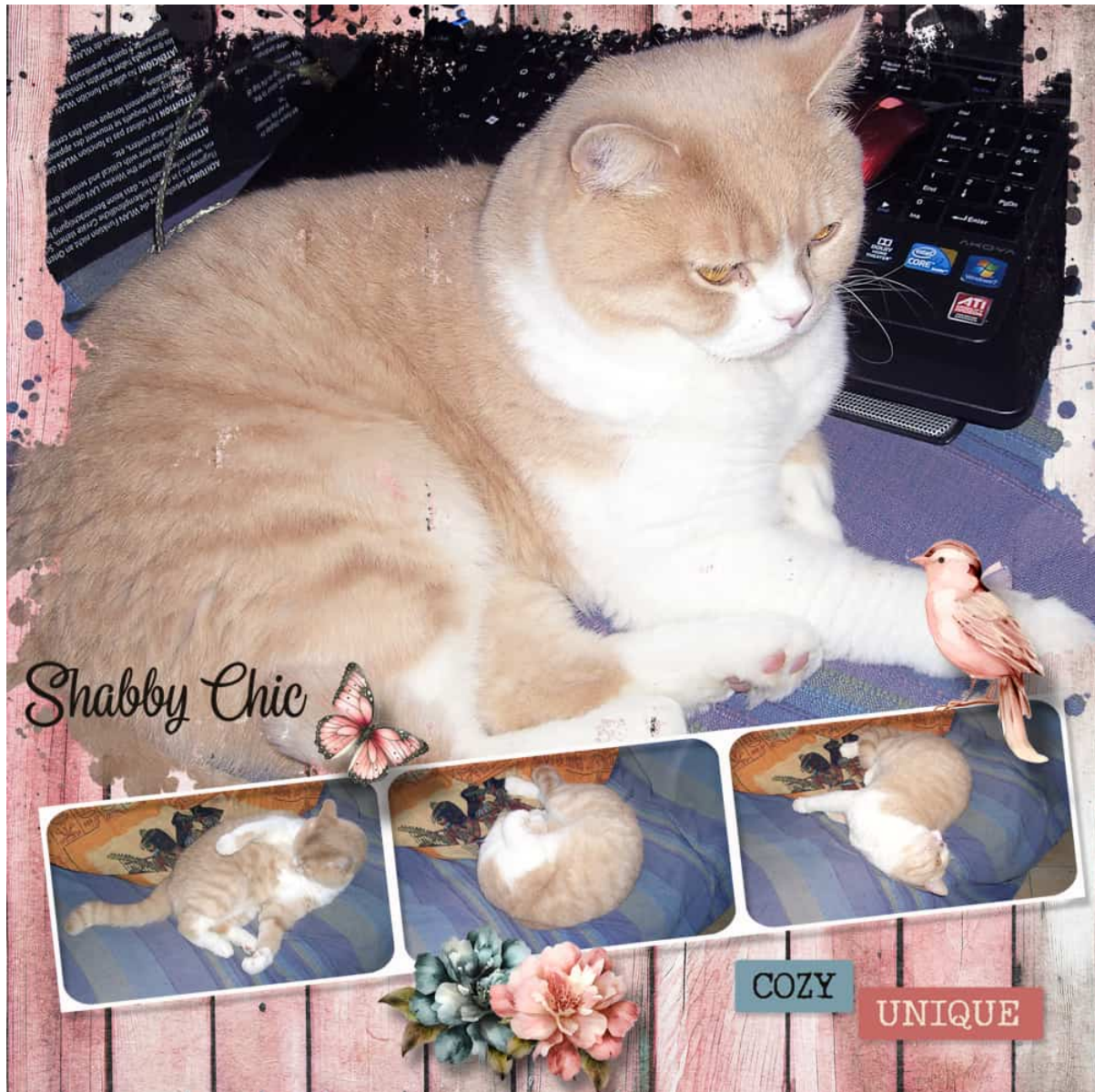
Layout by Bourico Casper