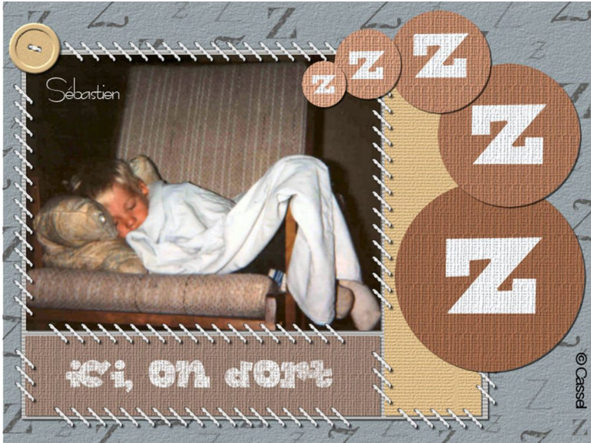
Layout by Carole