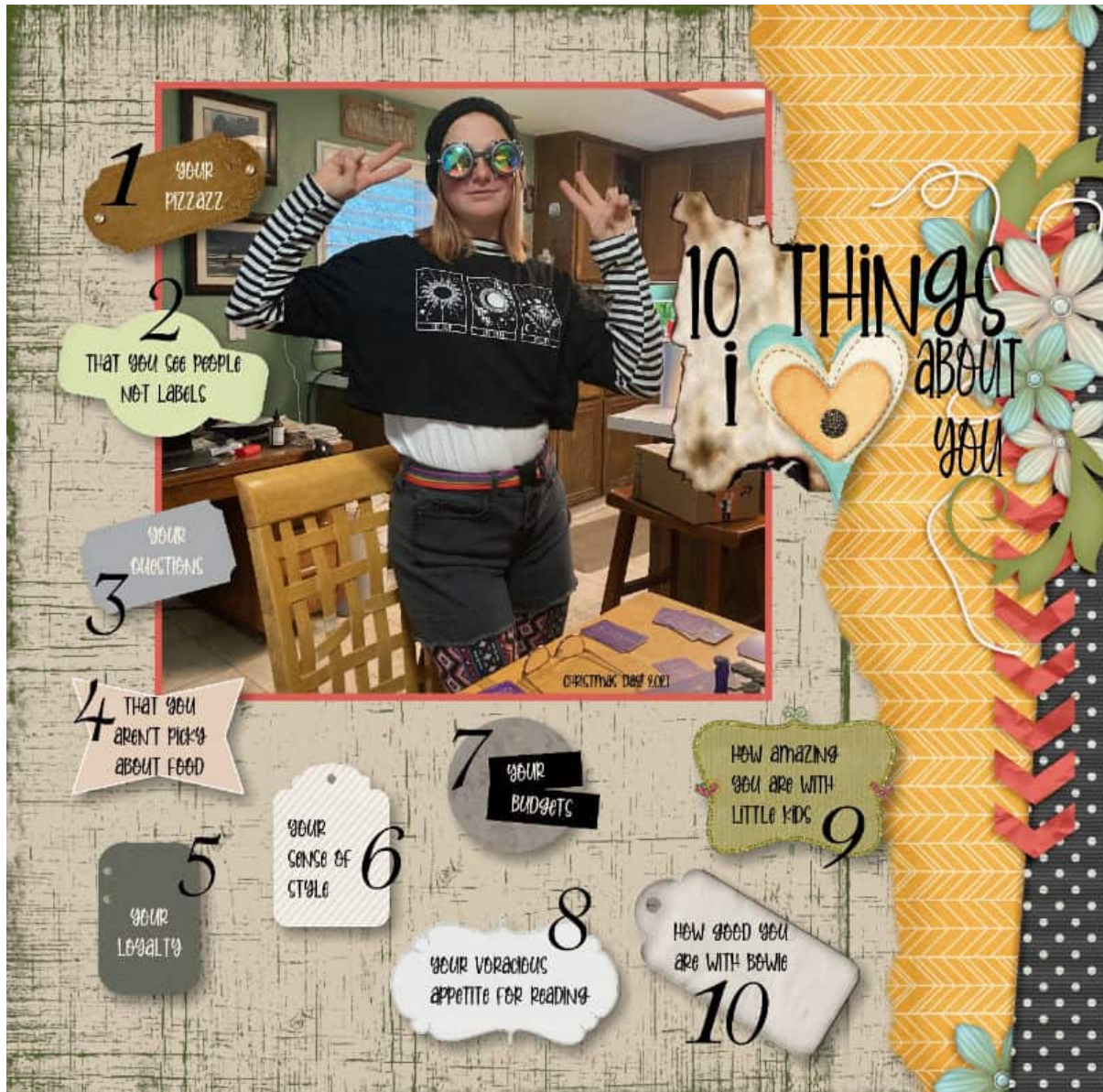
Layout from Tobreth Hansen