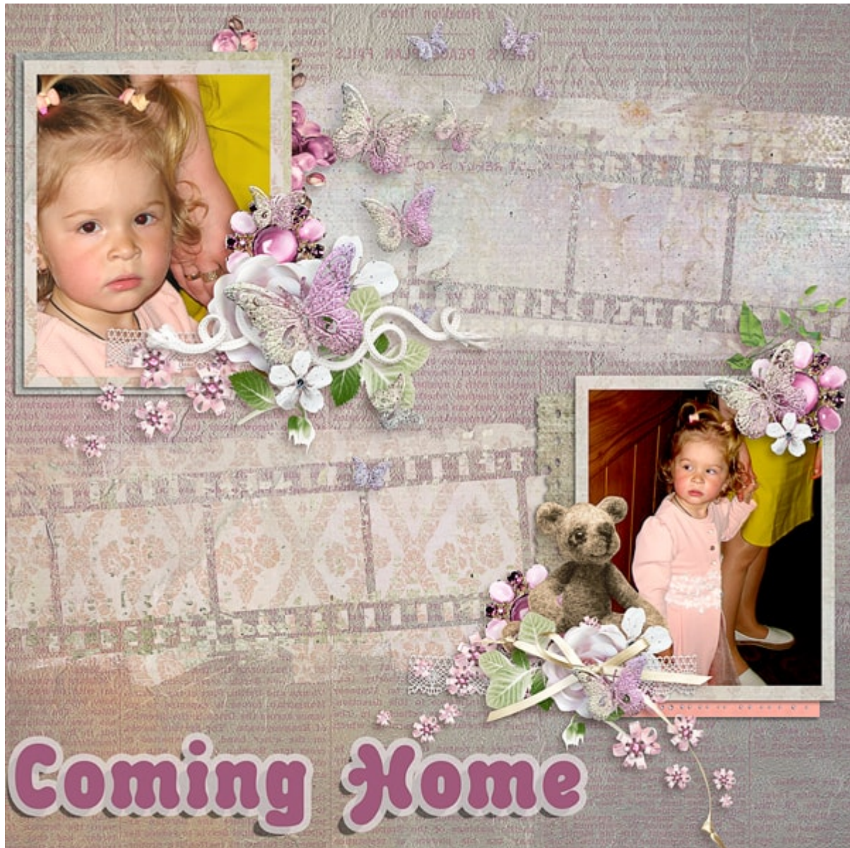
Layout by Olga Pisarenko

Arranging elements in a curved or circular manner can create a smooth flow. Circular arrangement naturally encourages the viewer's eye to move in a circular motion around the layout, exploring the different elements.