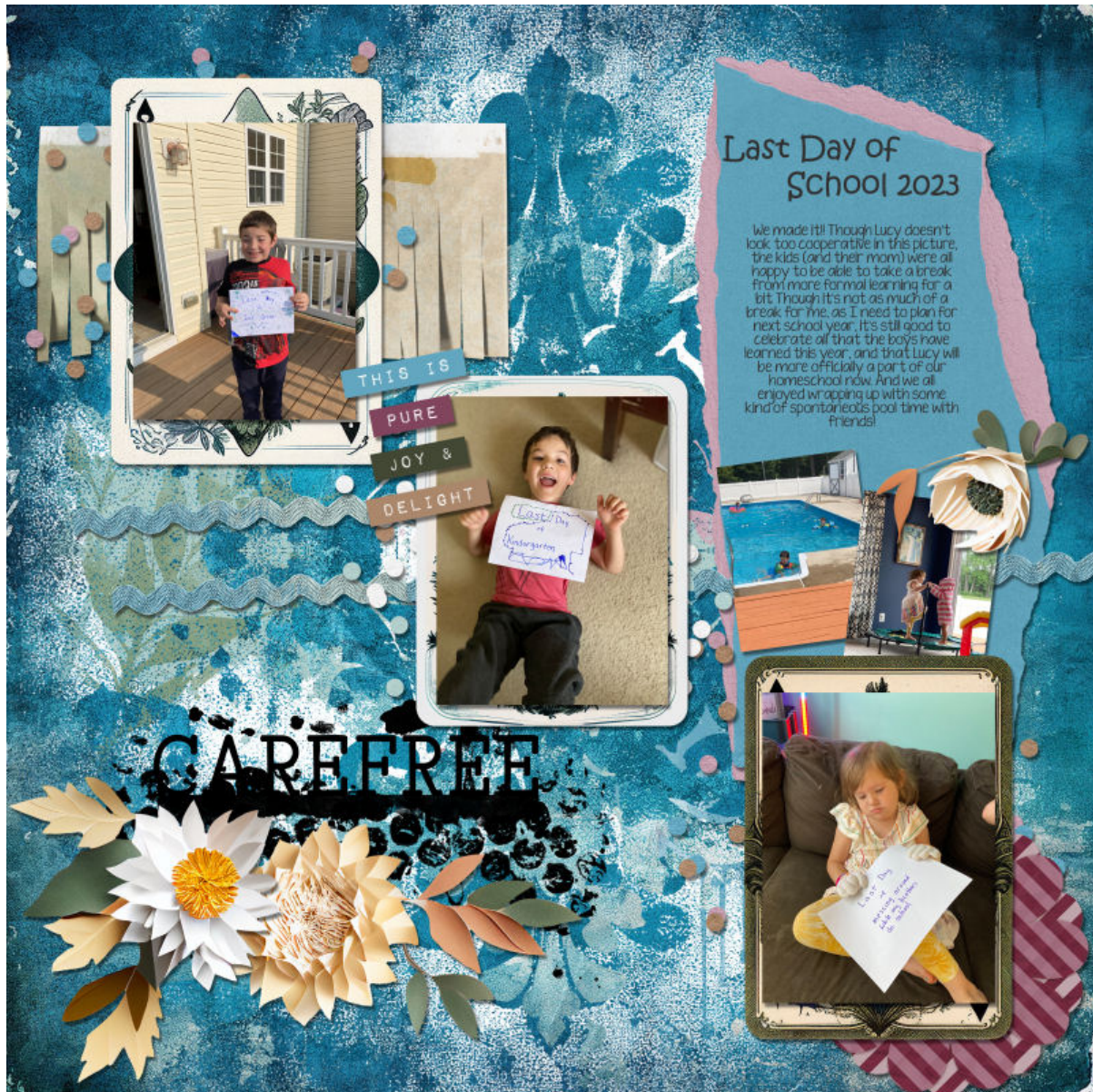
Layout by Becky Wooler

You can also incorporate lines, either real or implied, that lead the viewer's eye toward a specific element or area of the layout. You can use elements like arrows, decorative lines, or even the direction of a person's gaze in a photo to create a sense of movement.