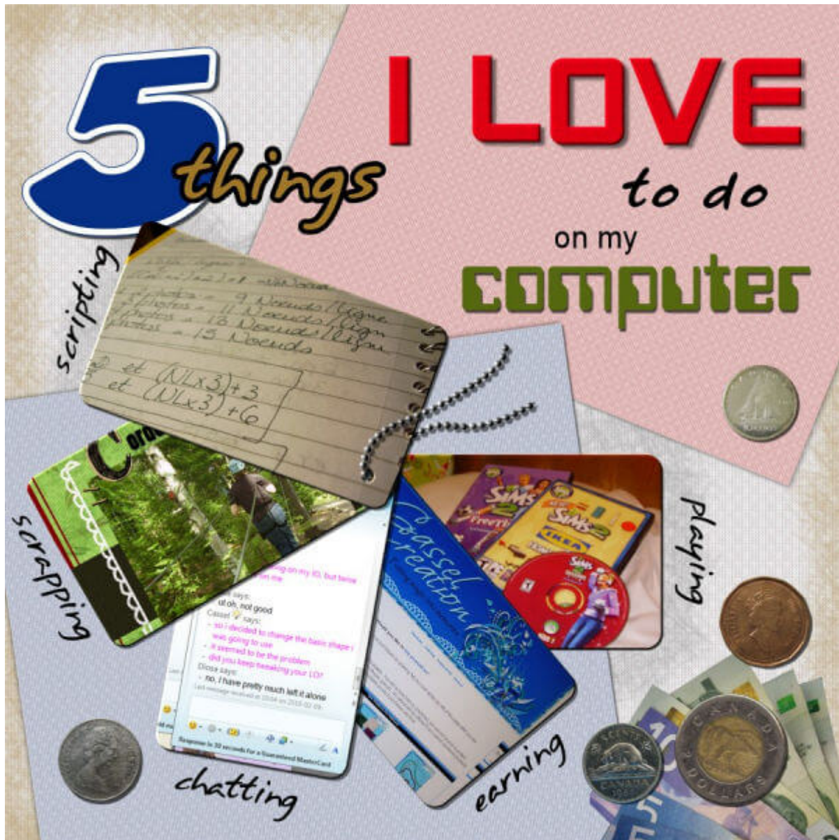
Layout by Carole

There are many ways to establish a clear visual flow to enhance the overall design and storytelling impact of your layout. You can add color coordination and directional clues like arrows and leading lines. The arrangement of the photos, texts, and elements will also play a role in how the viewer will enjoy all the details of your layout.