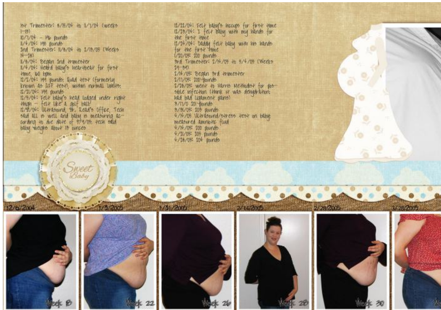
Layout by Tina Shaw

To help with the flow, you can also incorporate numbers or labels within your layout to indicate the order of elements. You can add small tags, labels, or captions with numbers or dates alongside photos or journaling blocks to create a visual sequence. This helps viewers understand the logical progression and encourages them to follow the order. This is more important if the numbering is not in an obvious straight line.