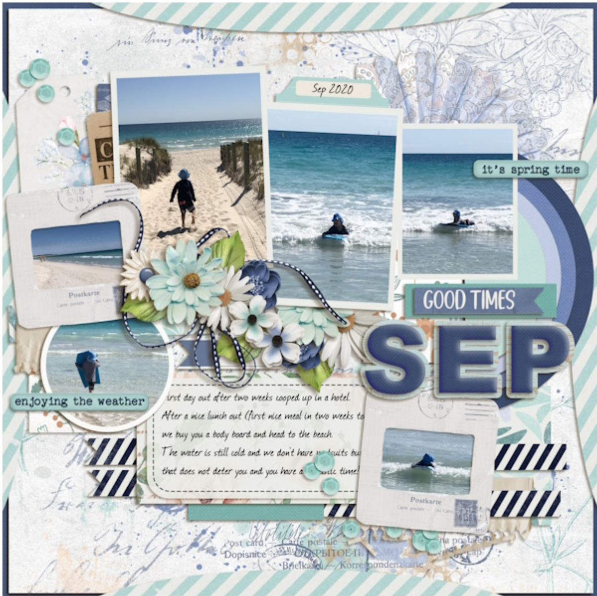
Layout by Lou Smith

Another way to group elements together can be by attaching them together or placing them on a common mat or surface.