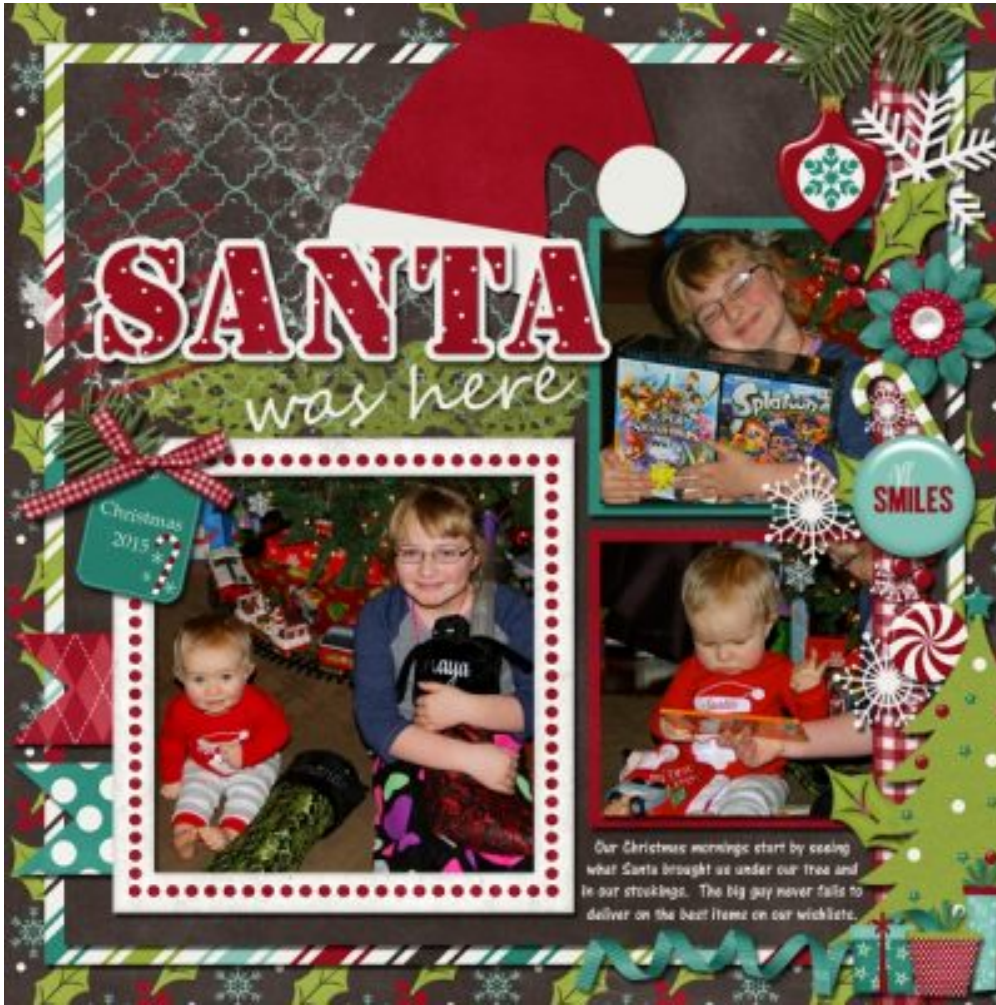
Layout by Dee