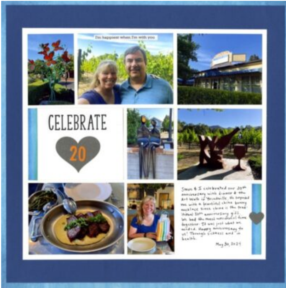
Layout by Cindy