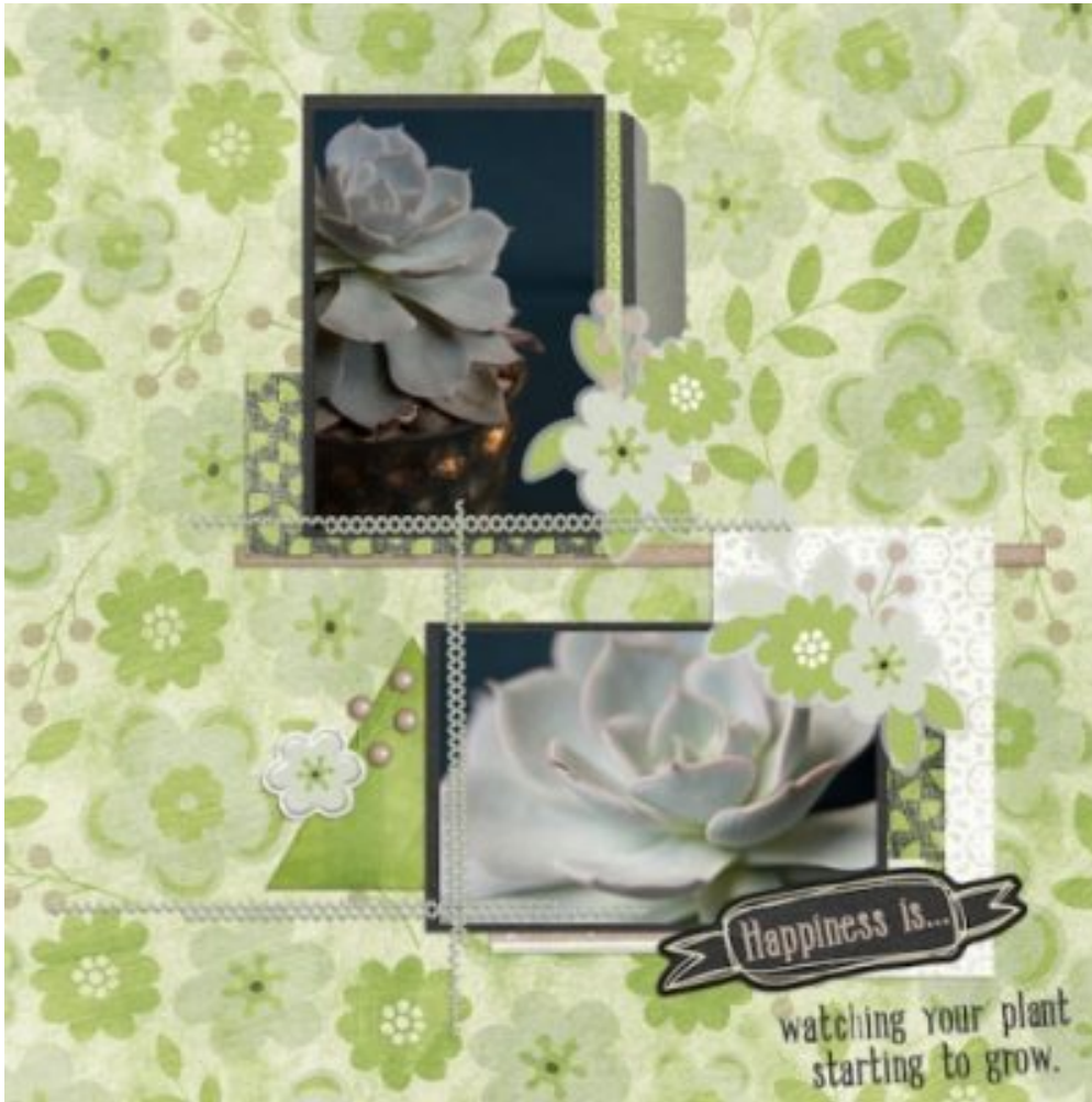
Layout by Ania