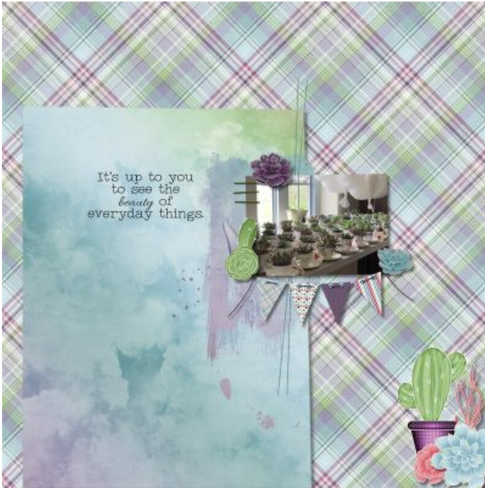
Layout by Ruth