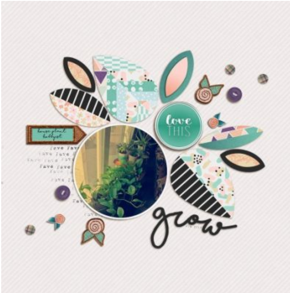
Layout by Rachel