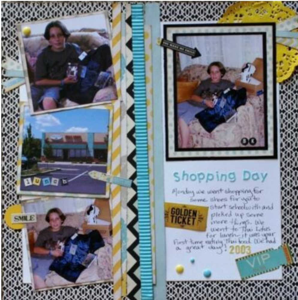
Layout by Susan