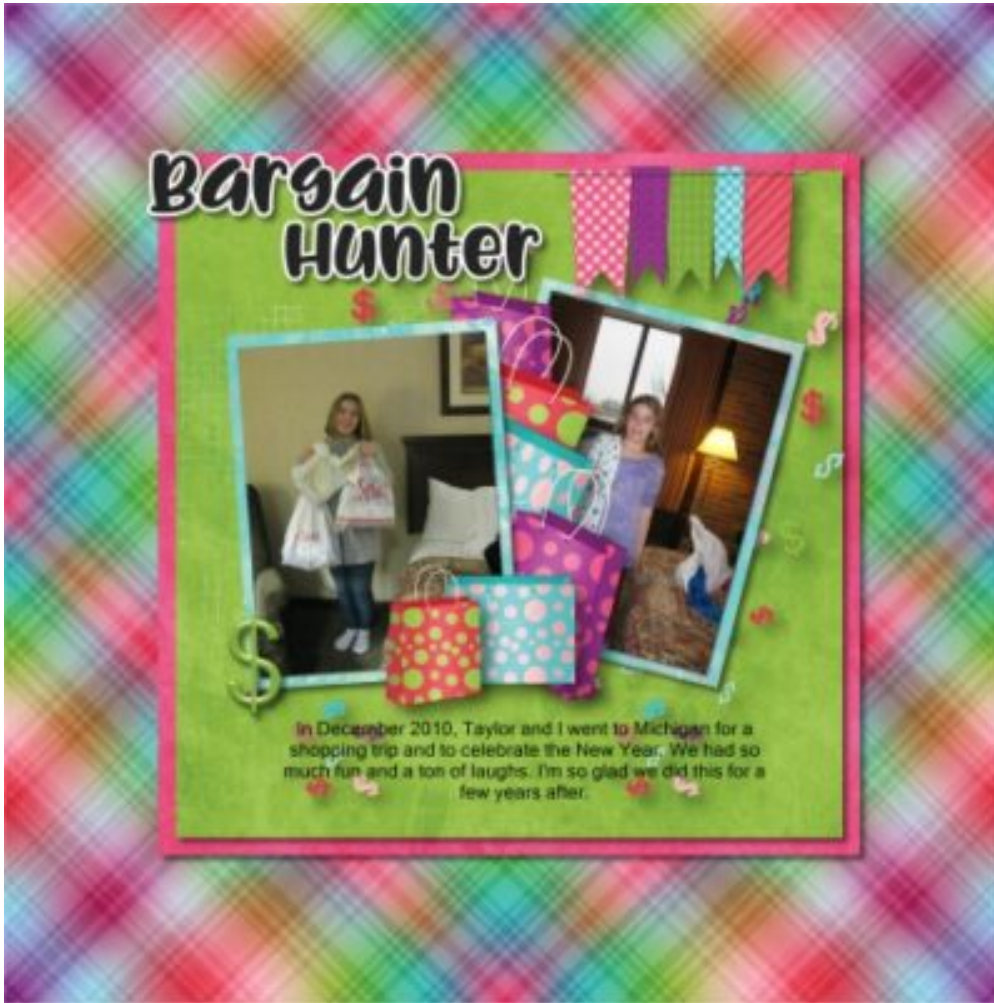
Layout by Ruth