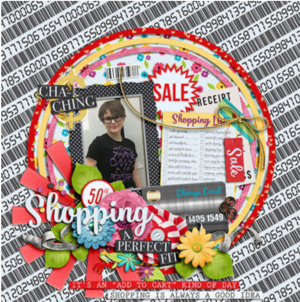
Layout by Neverland Scraps