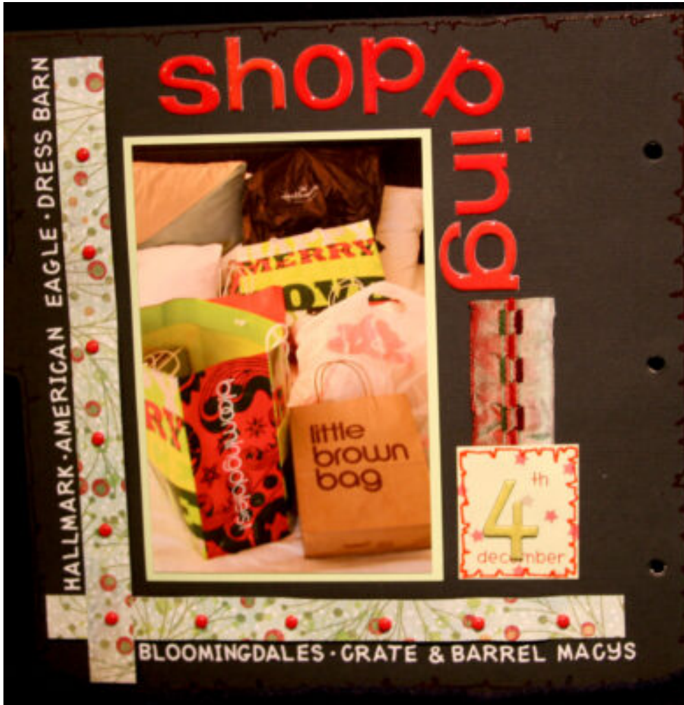
Layout by Rachel