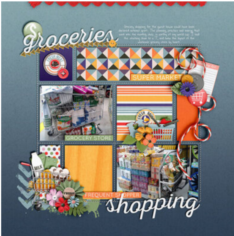
Layout by Christelle