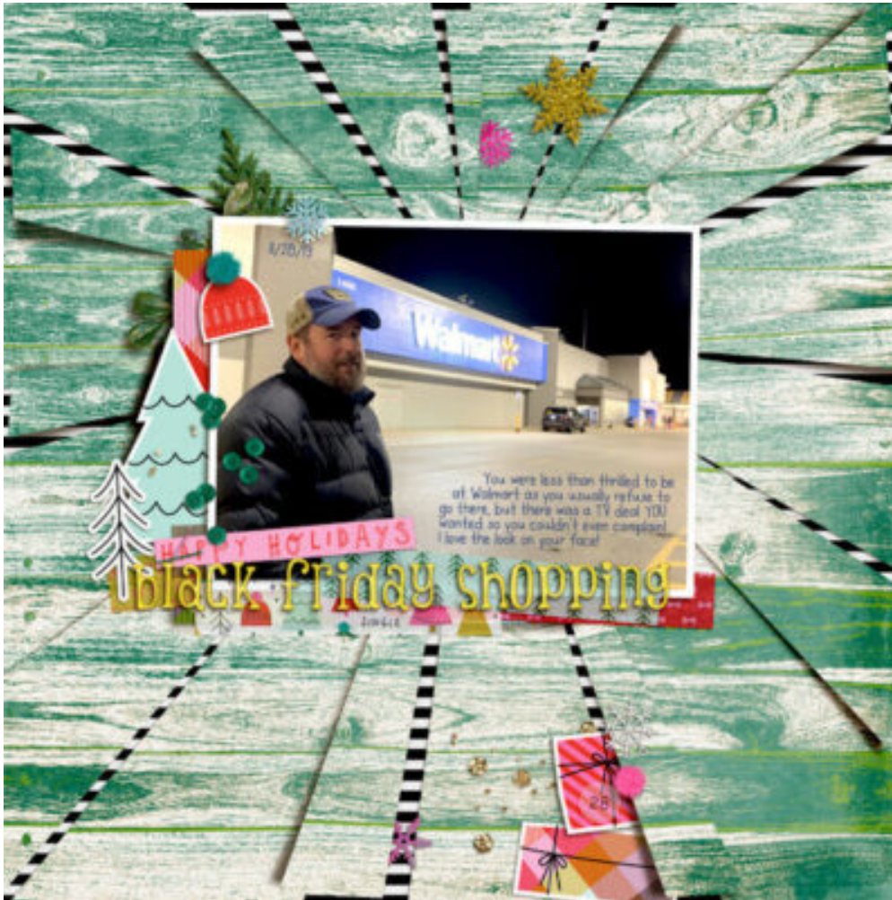
Layout by Karen