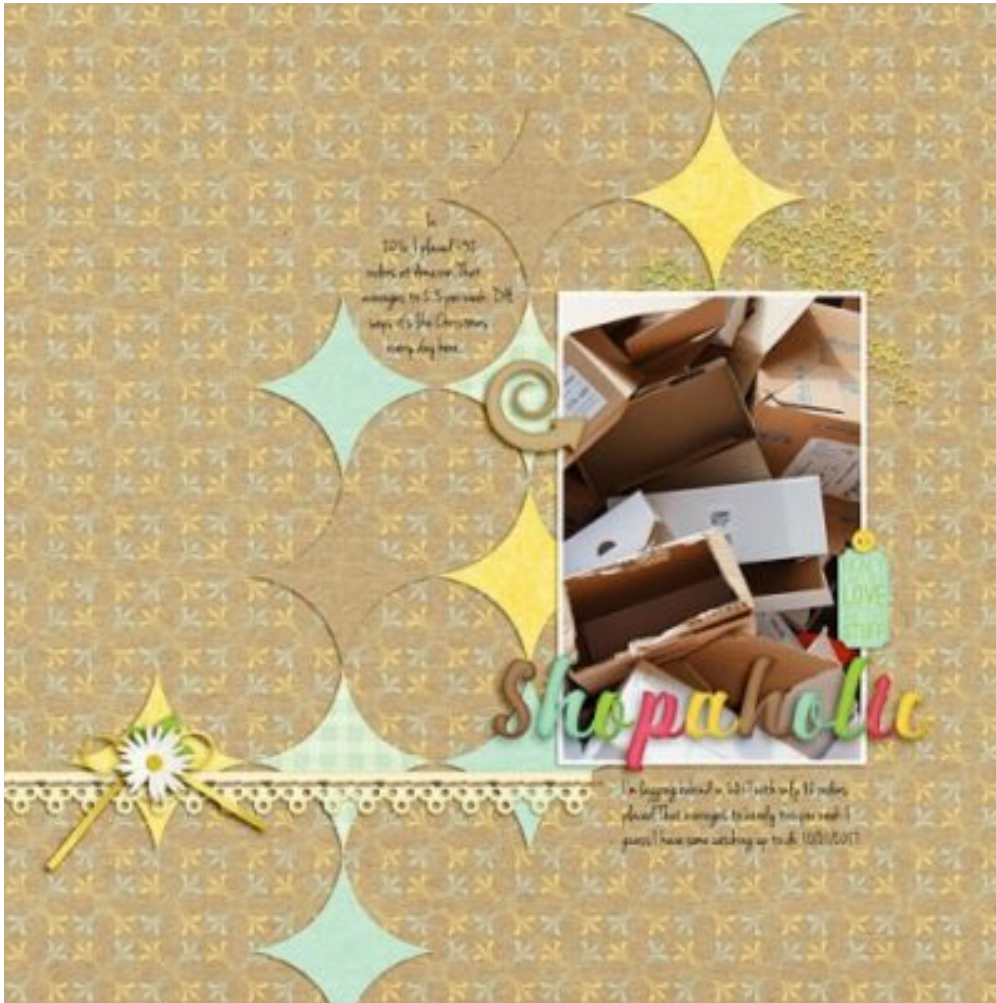
Layout by Beatrice Loren