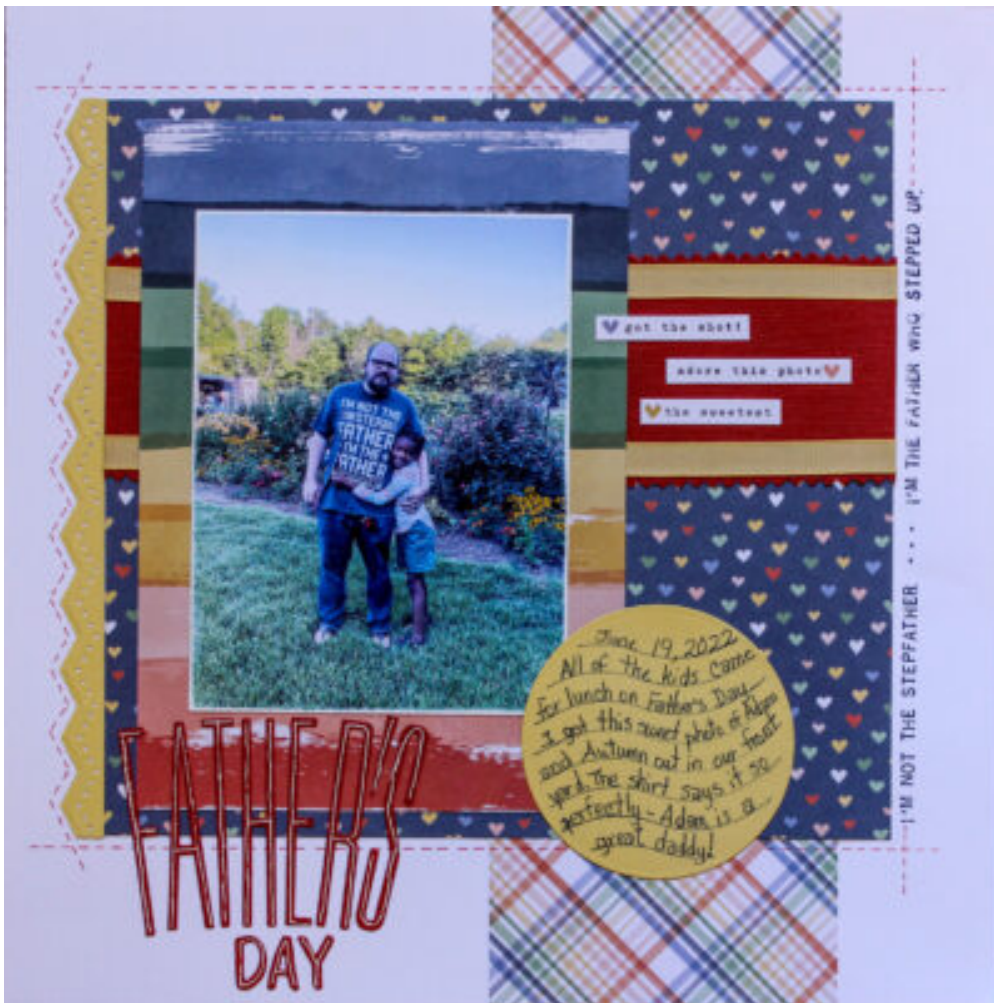
Layout by Betty