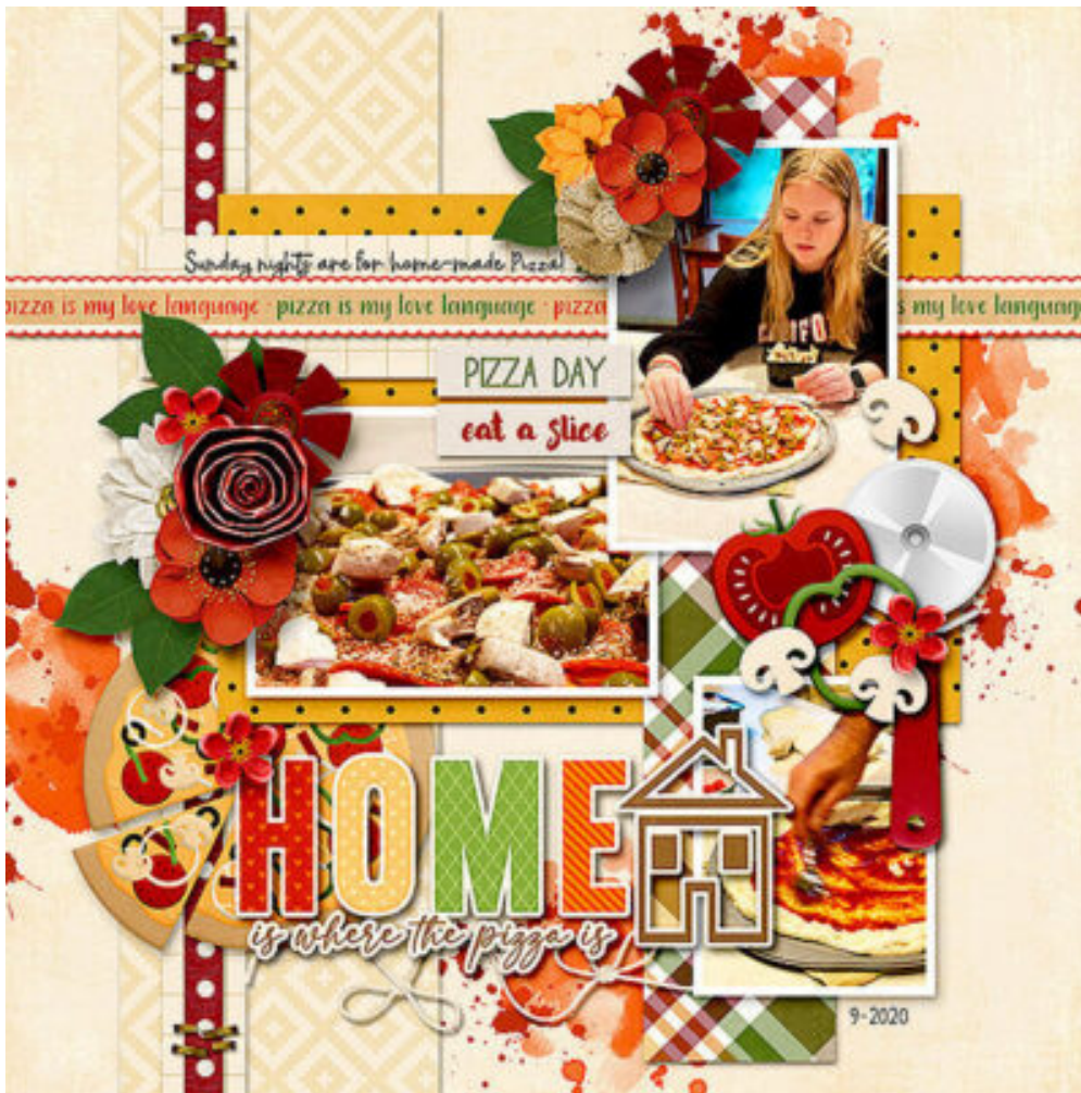
Layout by AmaneseFe