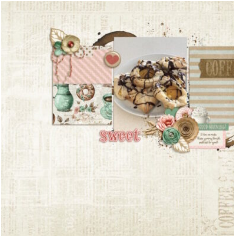
Layout by Lou