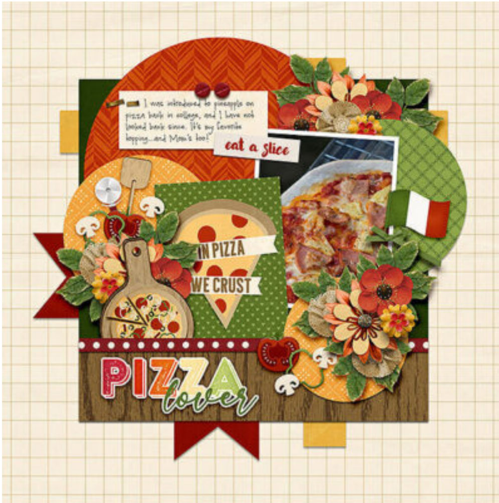
Layout by Zippyoh