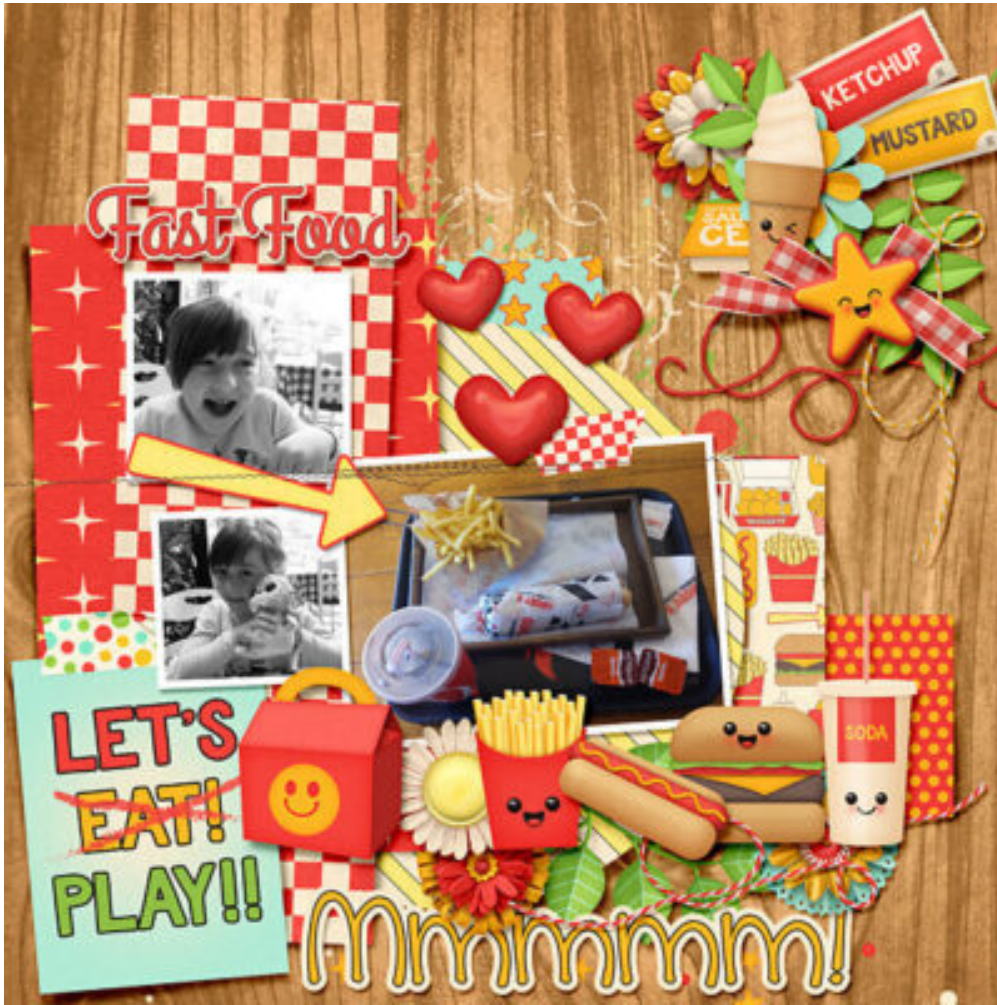
Layout by Cinderella_cindy