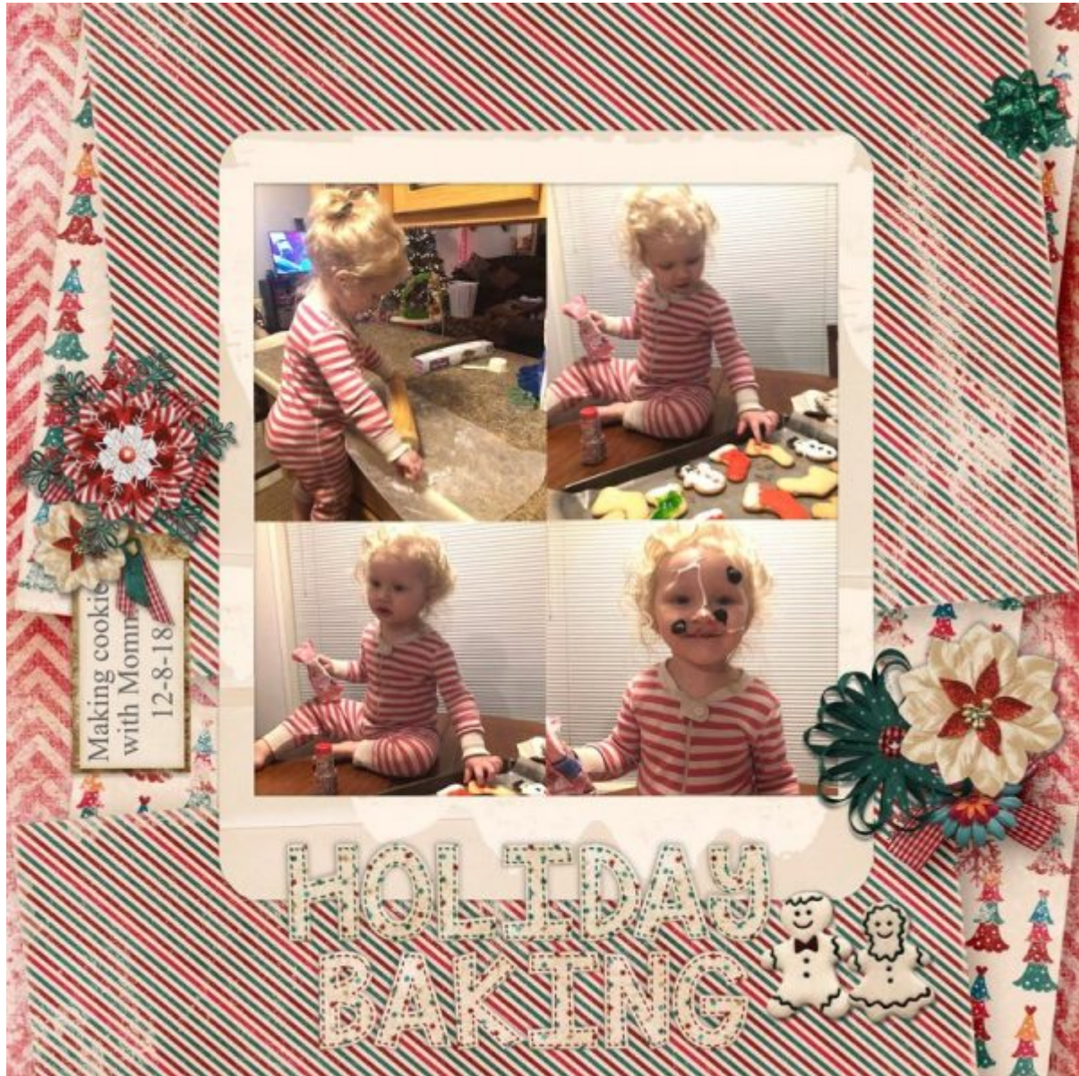
Page by Crazsquaw