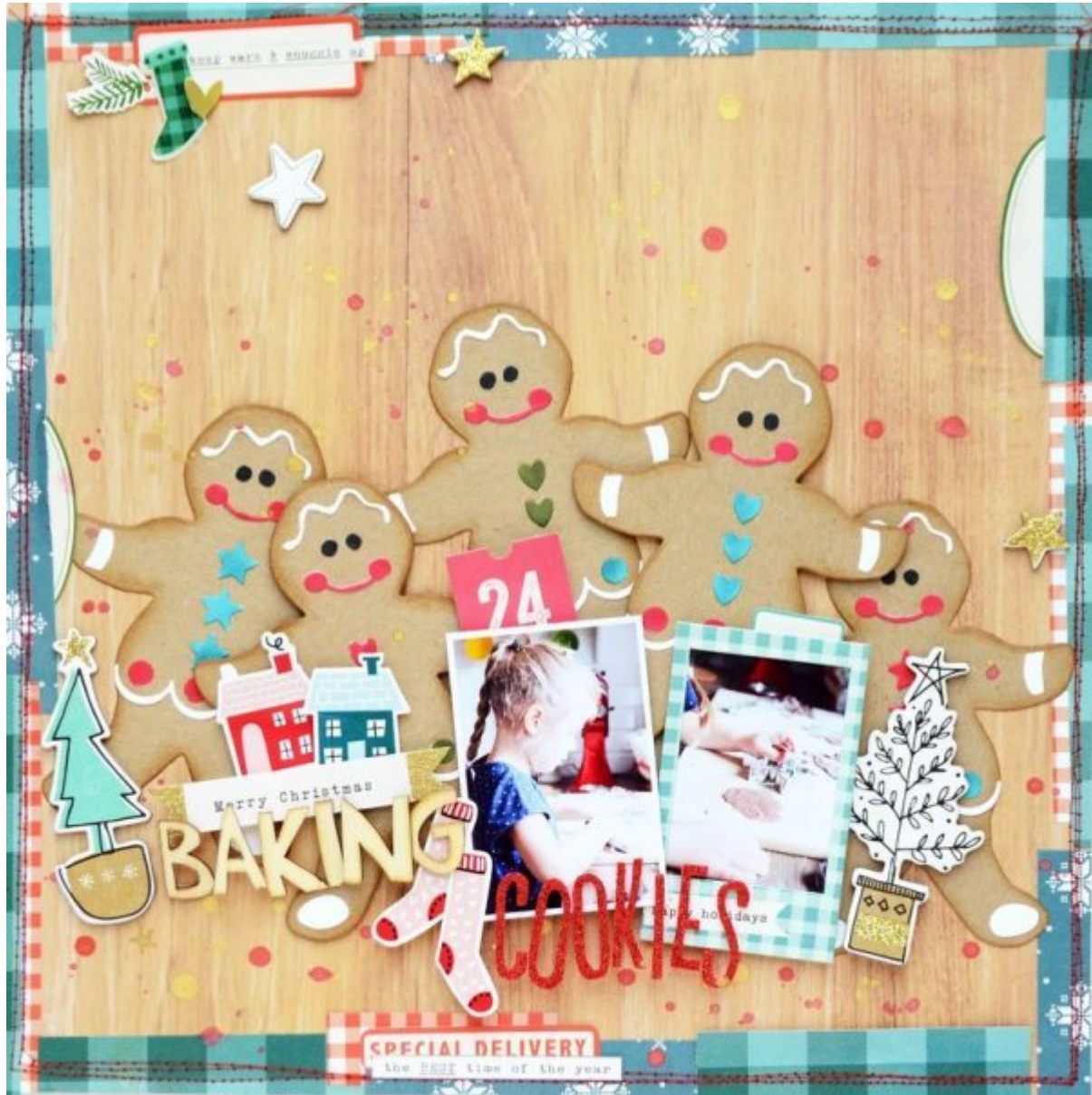
Layout by Anna