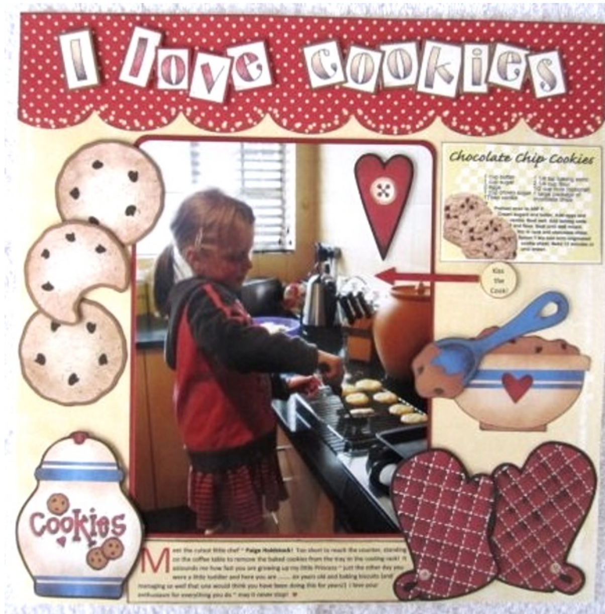
Project by Bridge