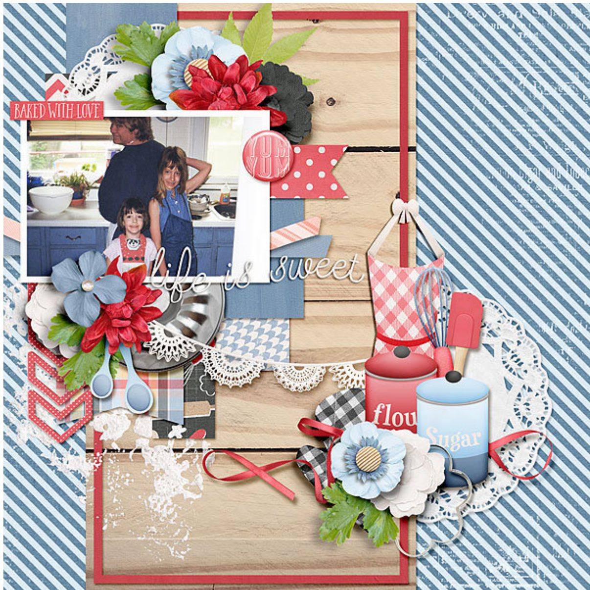
Layout by Rae