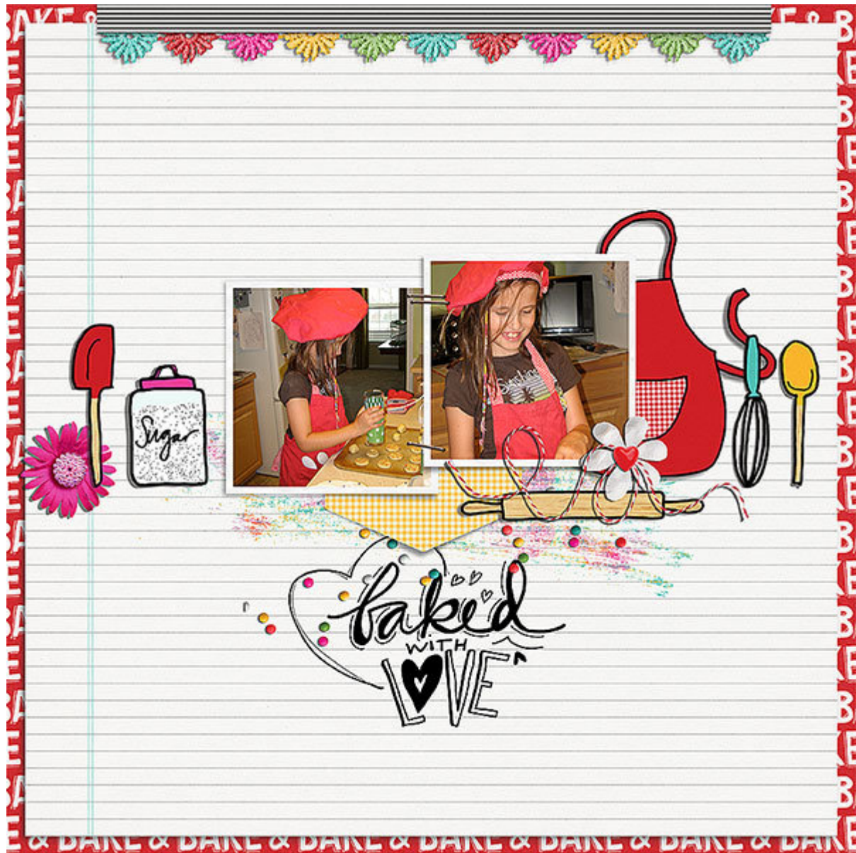
Layout by Chigirl