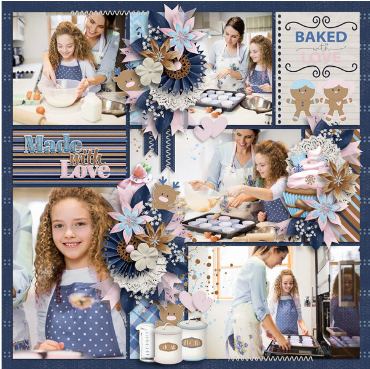
Page by Natalia