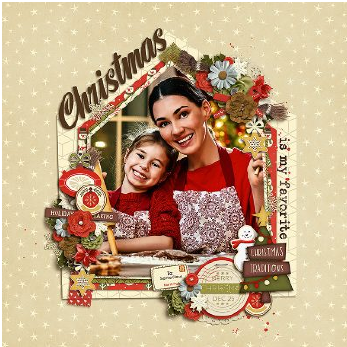
Layout by Biancka