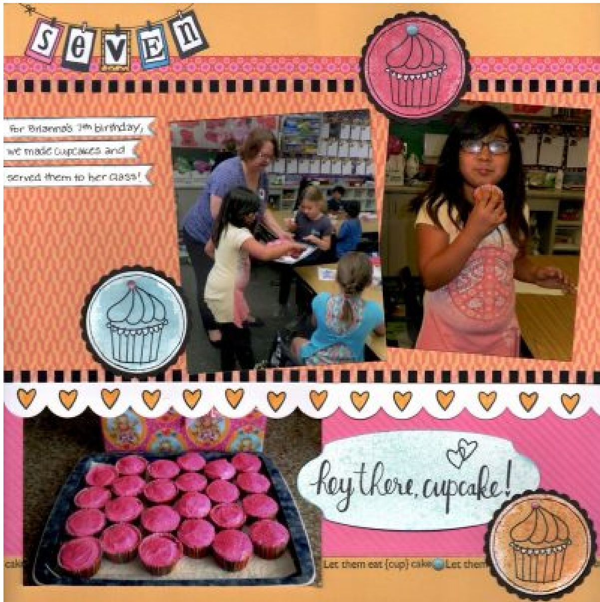
Page by Cheryl