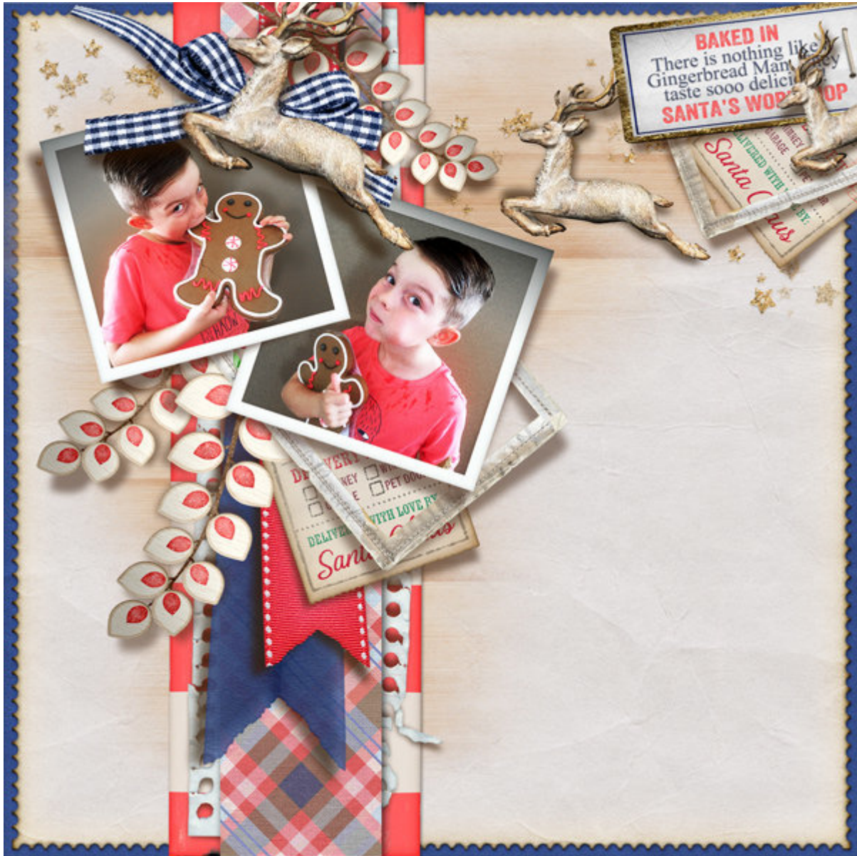
Layout by ~Justagirl~