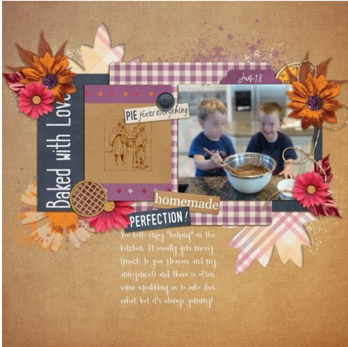
Layout by Lou