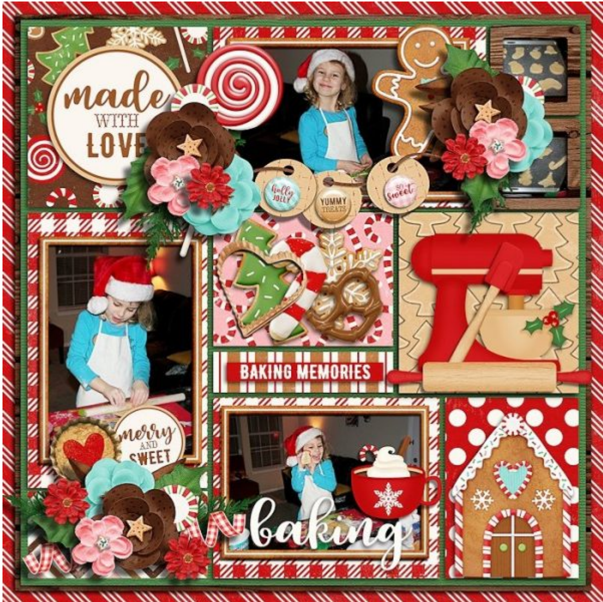
Project by Ellaspace