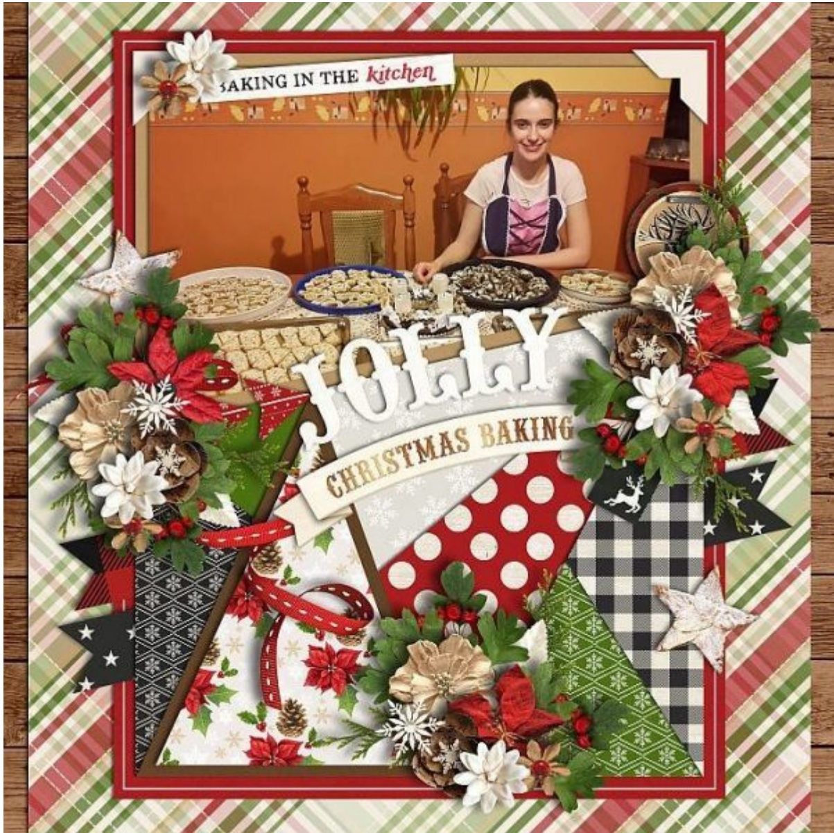
Layout by Tinci