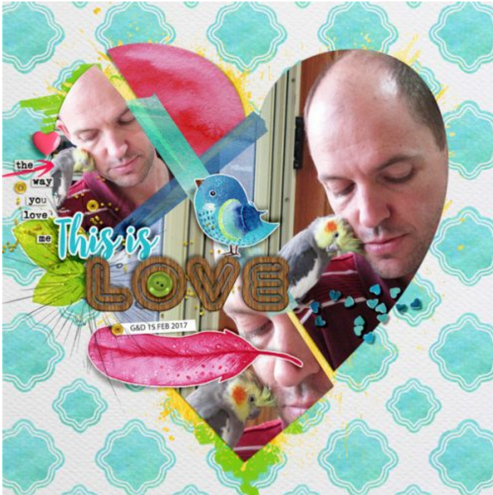
Layout by Justine