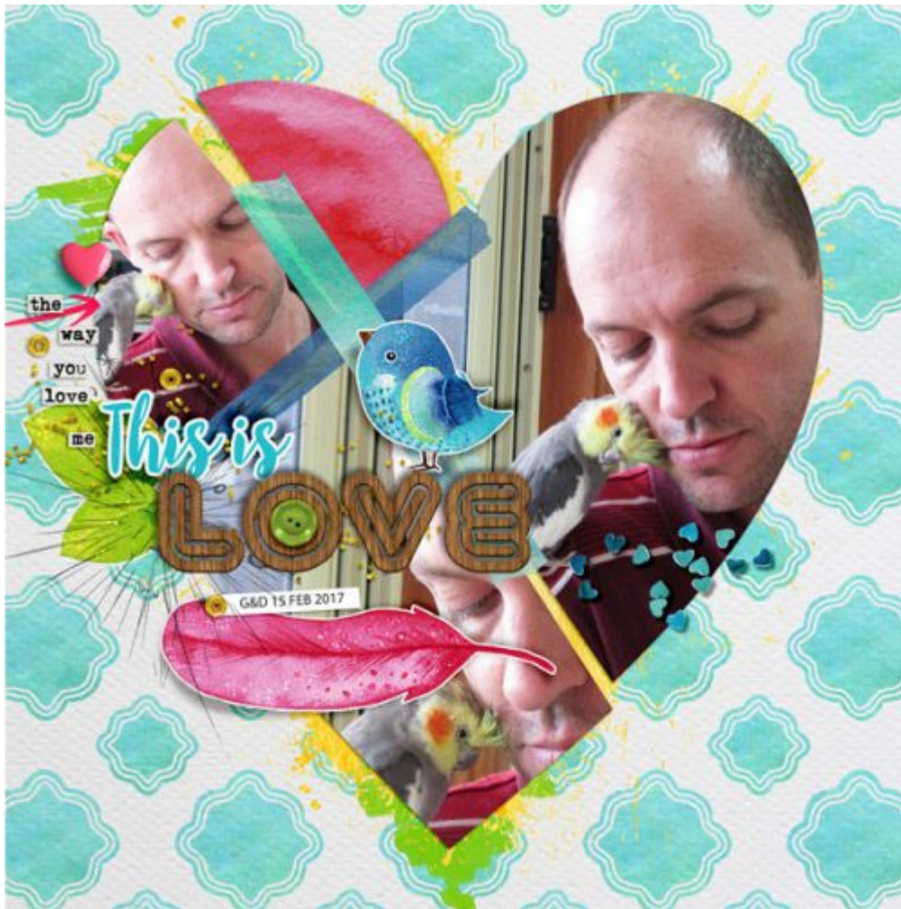
Layout by Justine