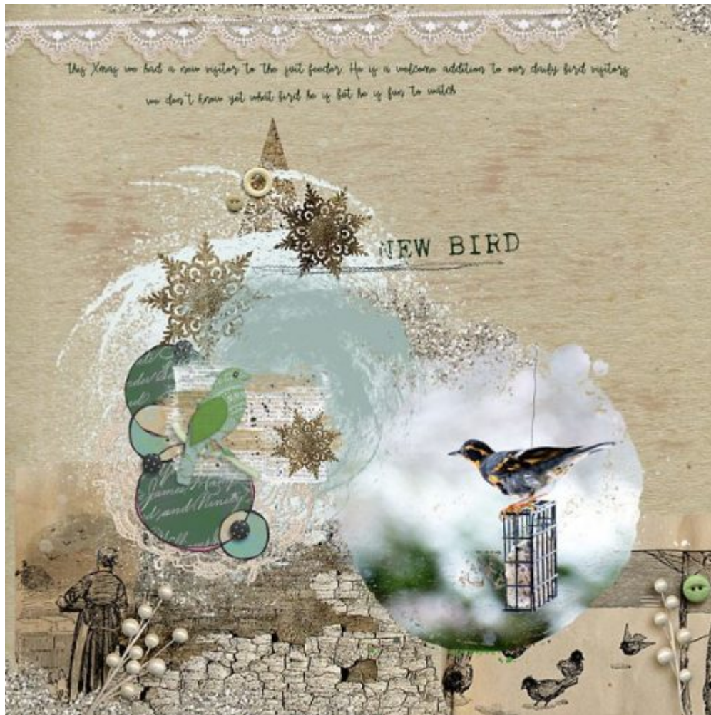
Layout by Rae