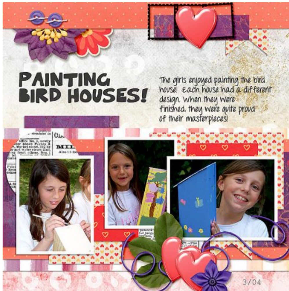
Layout by Deanna