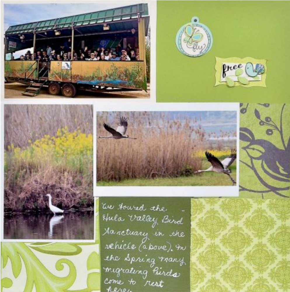
Layout by Lynne