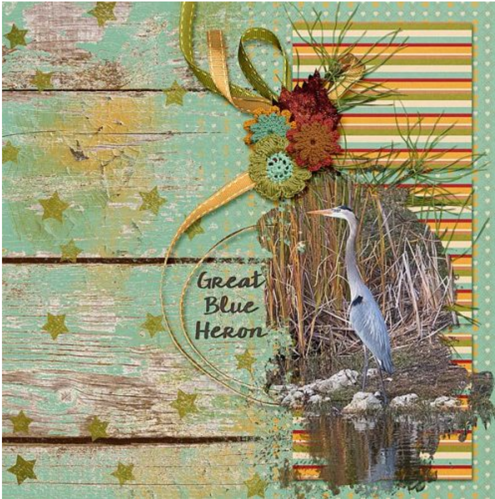
Layout by Linda