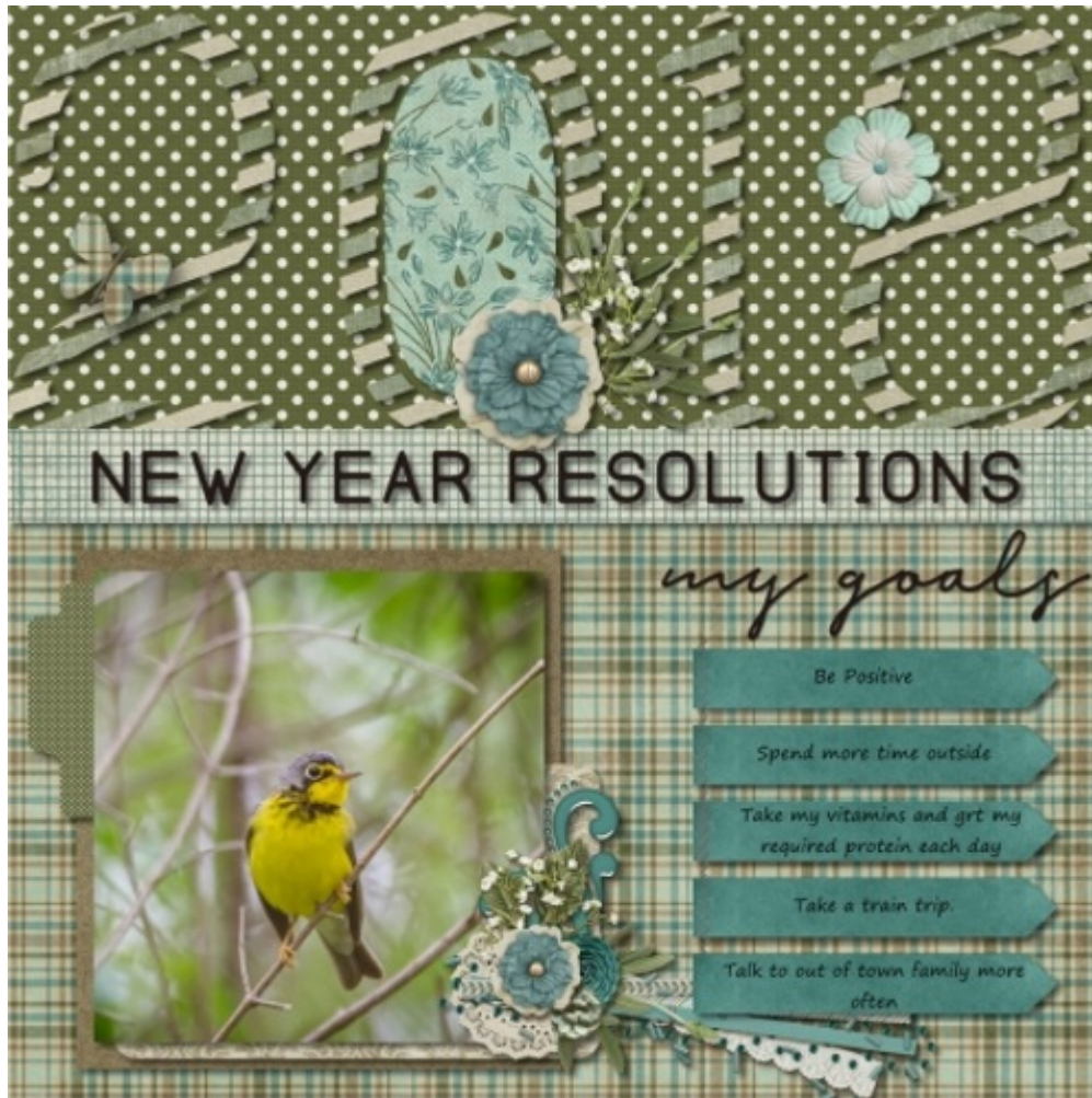
Layout by Ruth