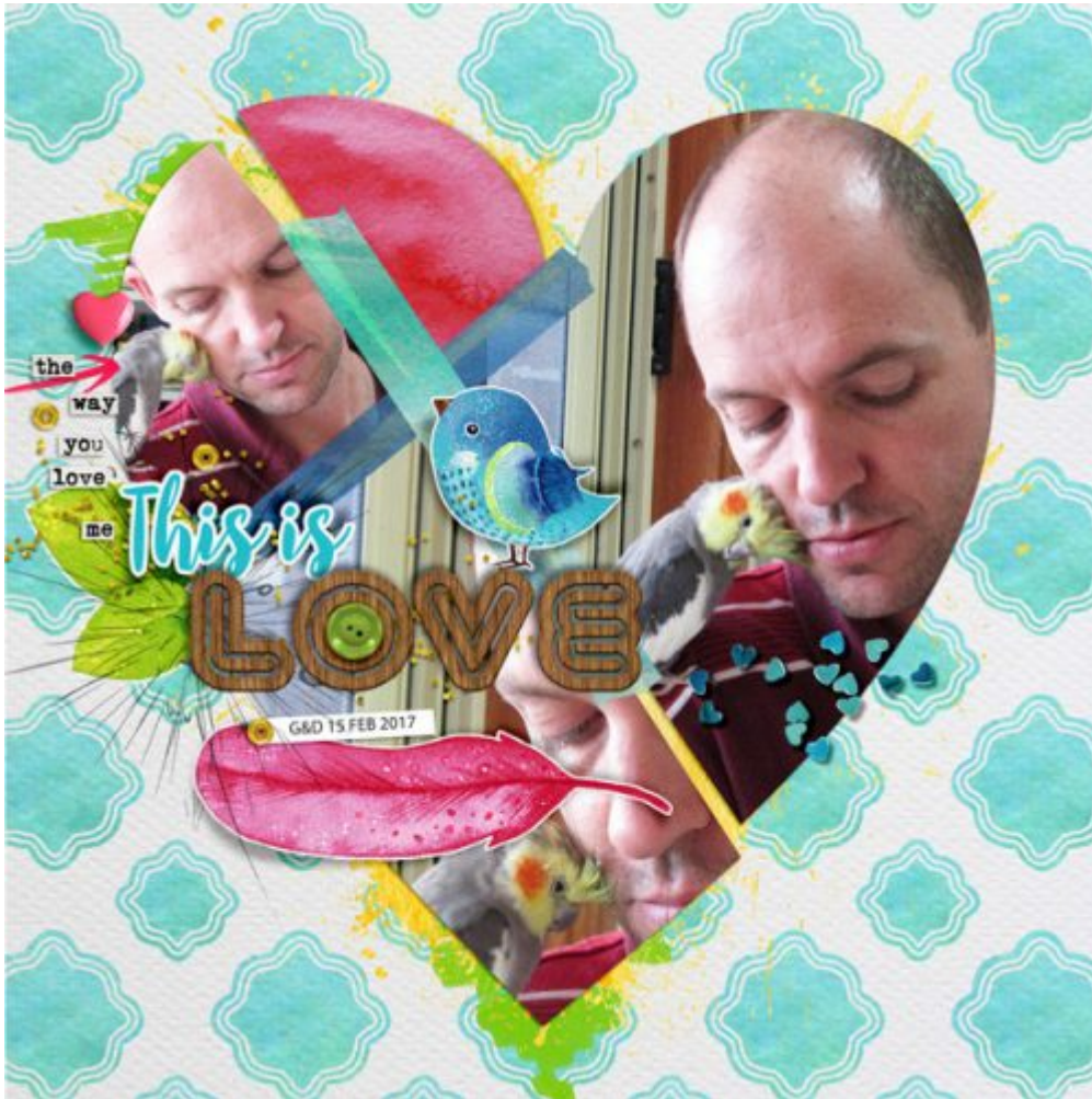
Layout by Justine