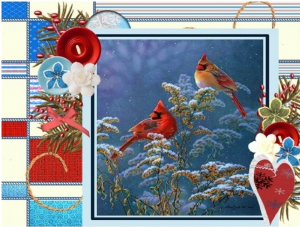
Layout by Pam