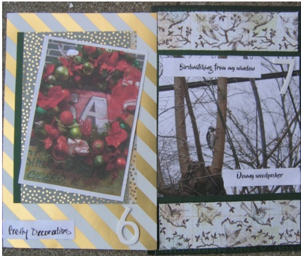
Layout by Scraping4fun25