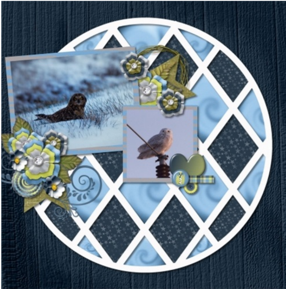
Layout by Ruth