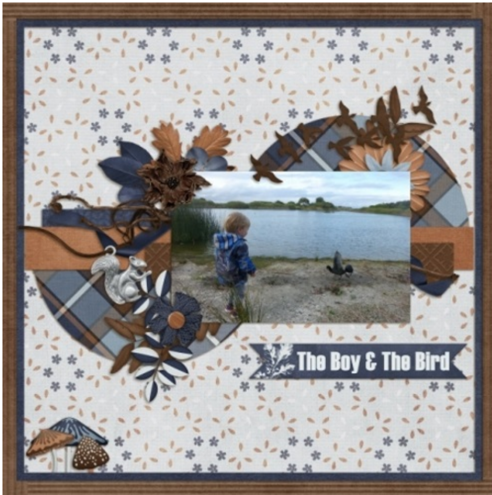
Layout by Lou