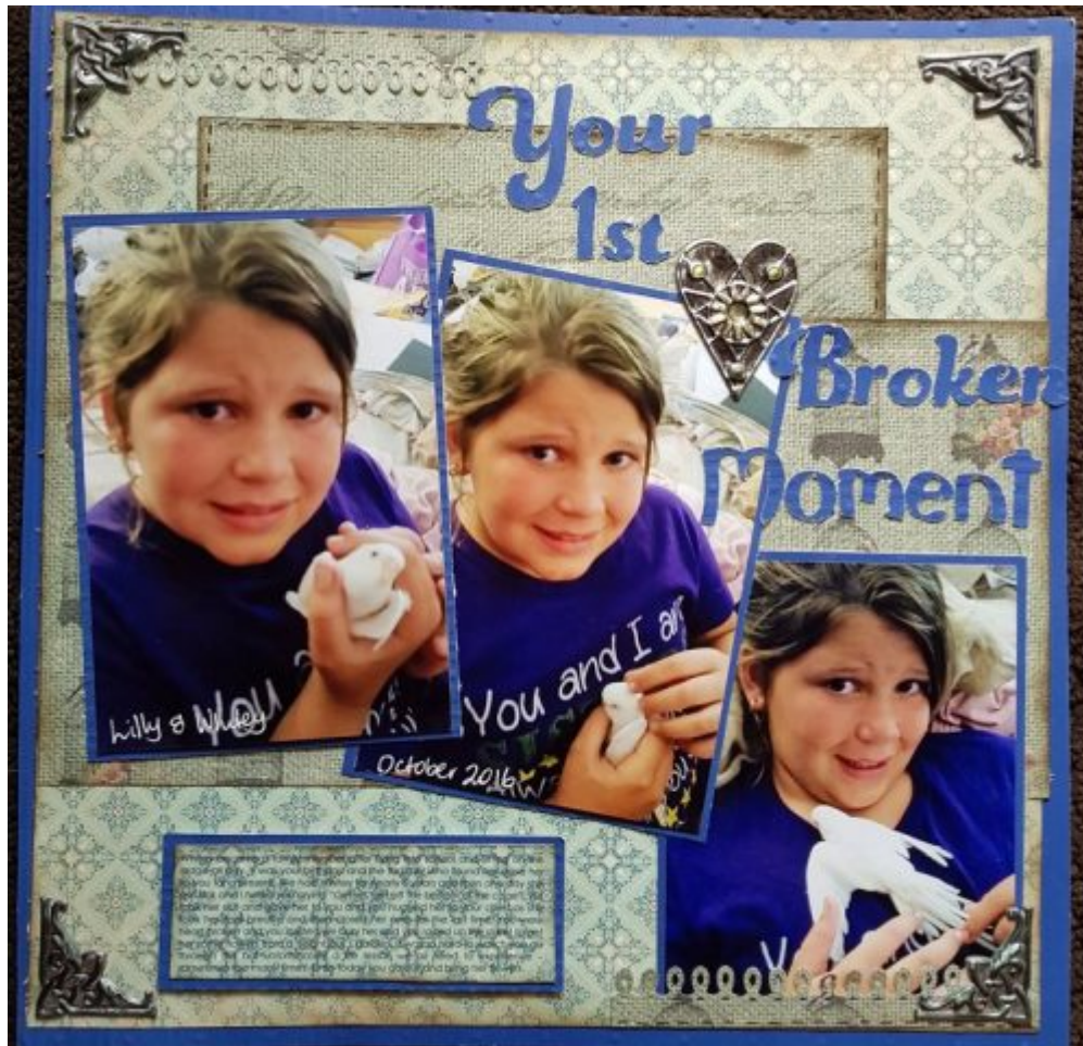
Layout by Kathy