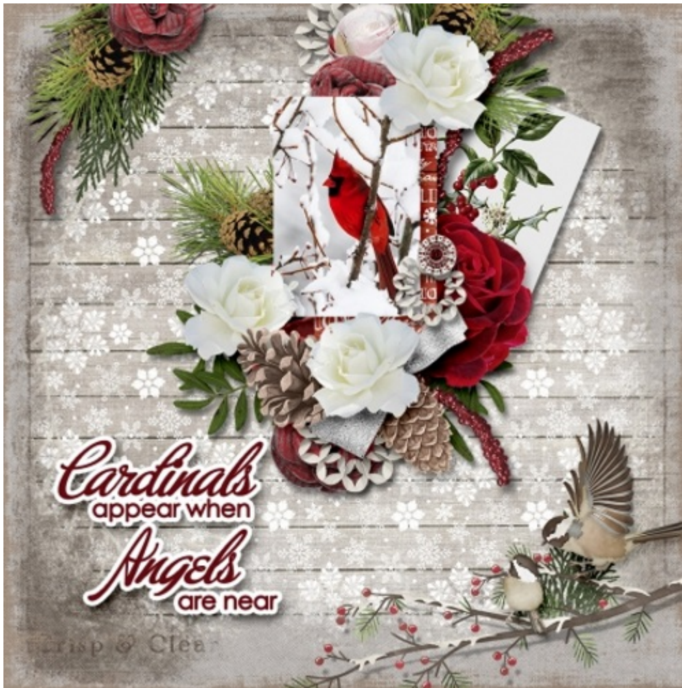
Layout by Cynthia