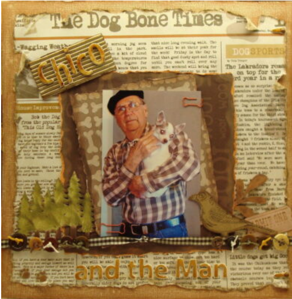
Page by Dnurse