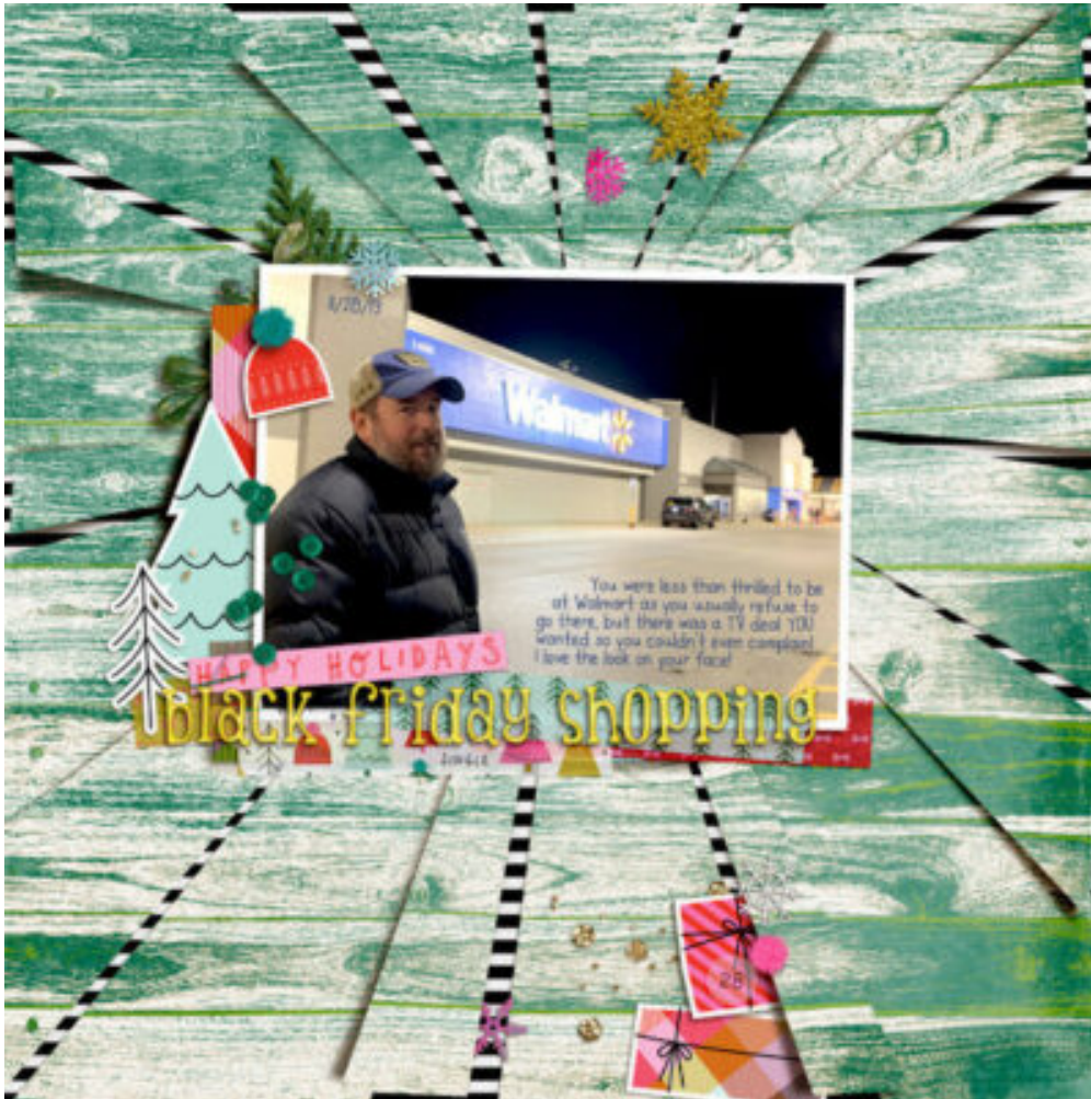
Layout by Karen