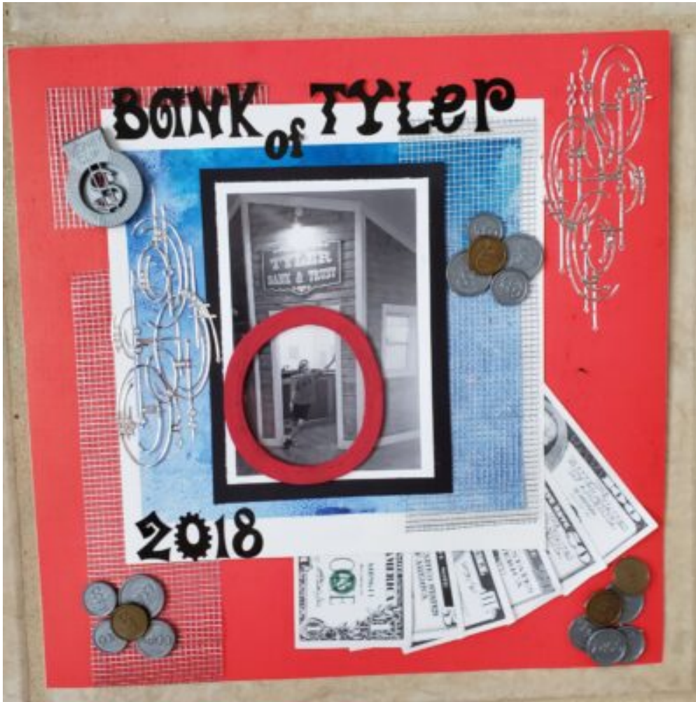
Layout by Lovette