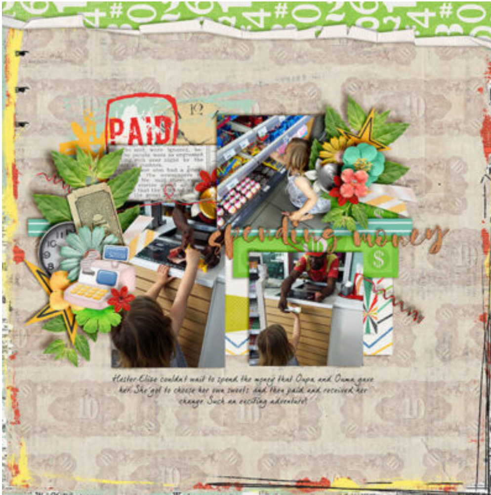
Layout by Christelle