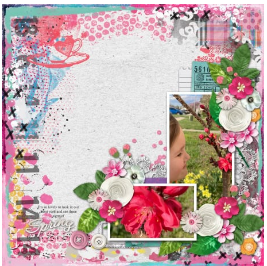
Layout by Becky Wooler

Here is an example of using only a small section of the "empty" area for journaling, yet, the corner is balanced with some mixed media elements on the opposing corner.