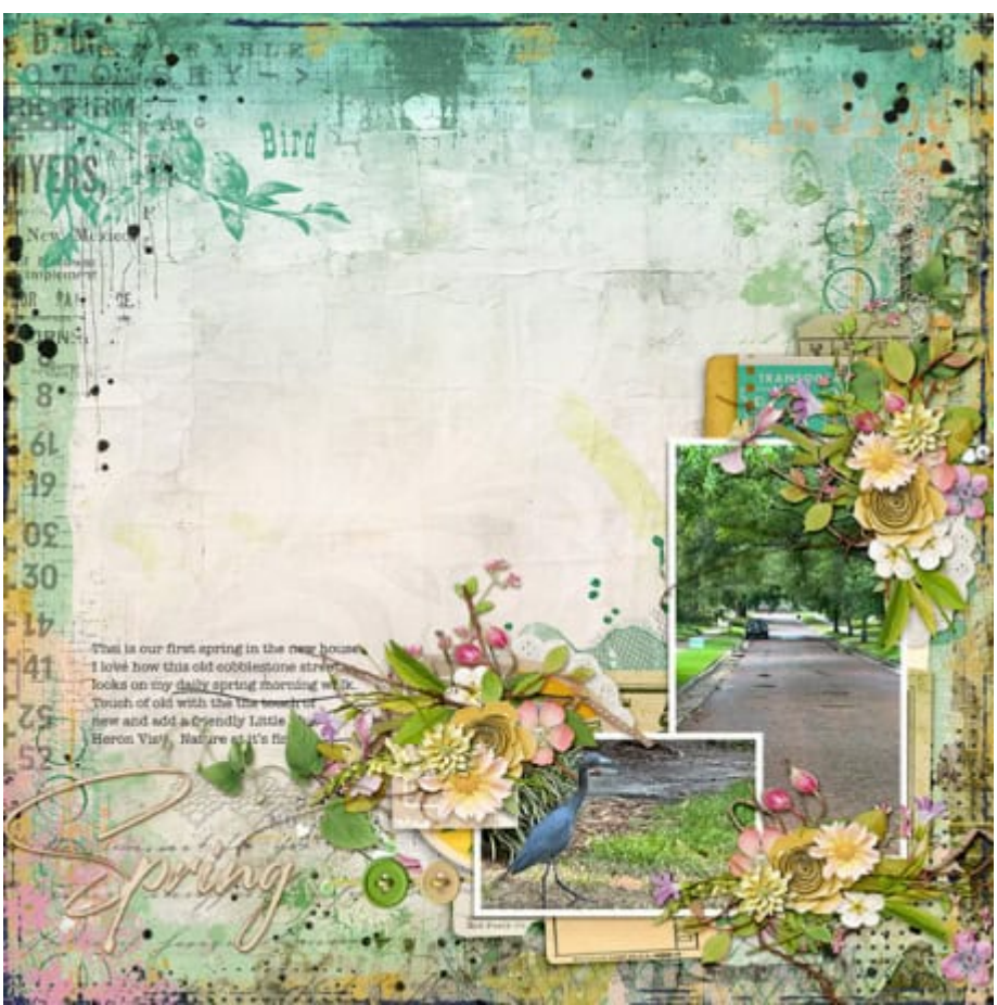
Layout by Esther Wisdom

How can you create your own layout with a corner arrangement? Remember that if you want some practice, you can use any of these layouts and scraplift them. <u>Read more about scraplifting</u>. And show us your pages.