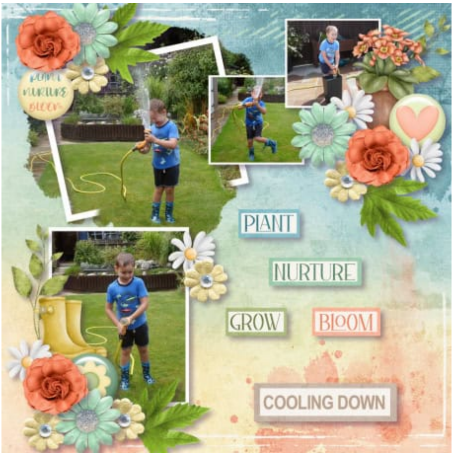
Layout by Chris Allport