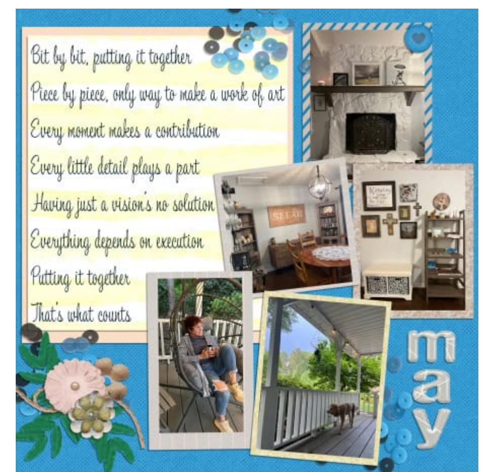
Layout by Stephanie Loomis

Even just two photos can be arranged in a corner and leave plenty of space for the journaling.