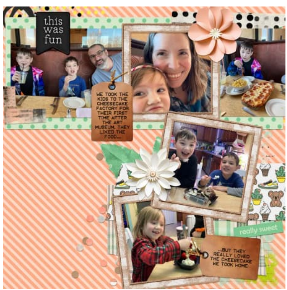
Layout by Becky Wooler

And if you feel that the layout still need a little more details, you can balance the corner of photos with decorative embellishment or mixed media elements.