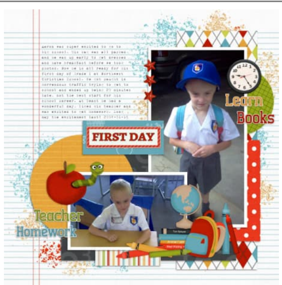
Layout by Cathy Sanders