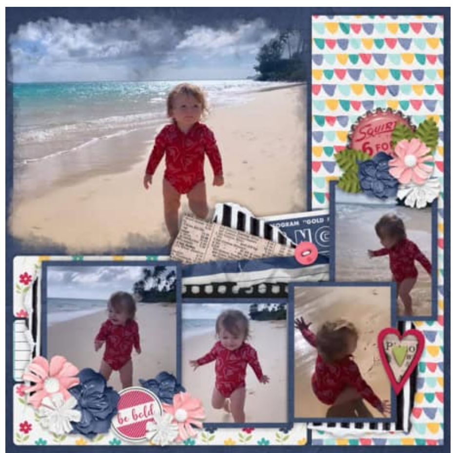
Layout by Joyce Ford