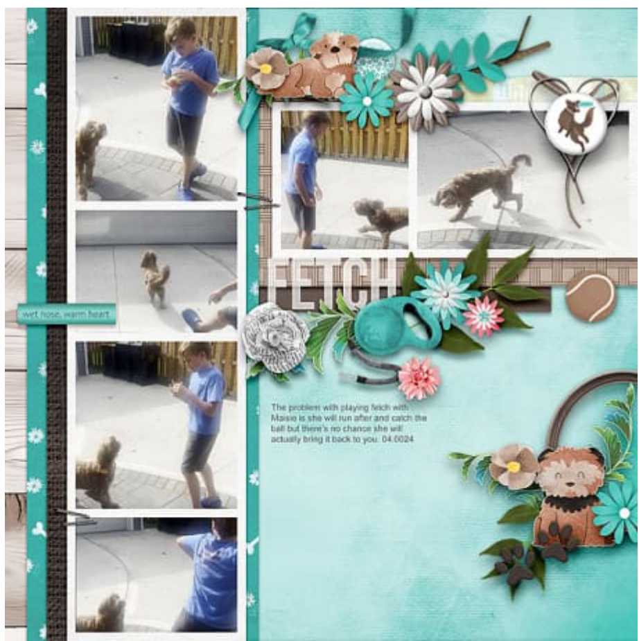
Layout by Beatrice Loren