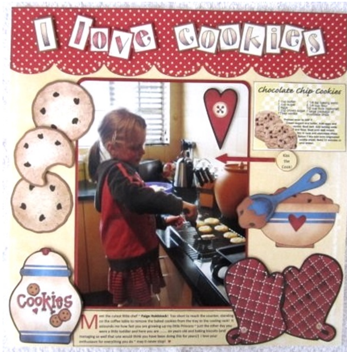
Project by Bridge