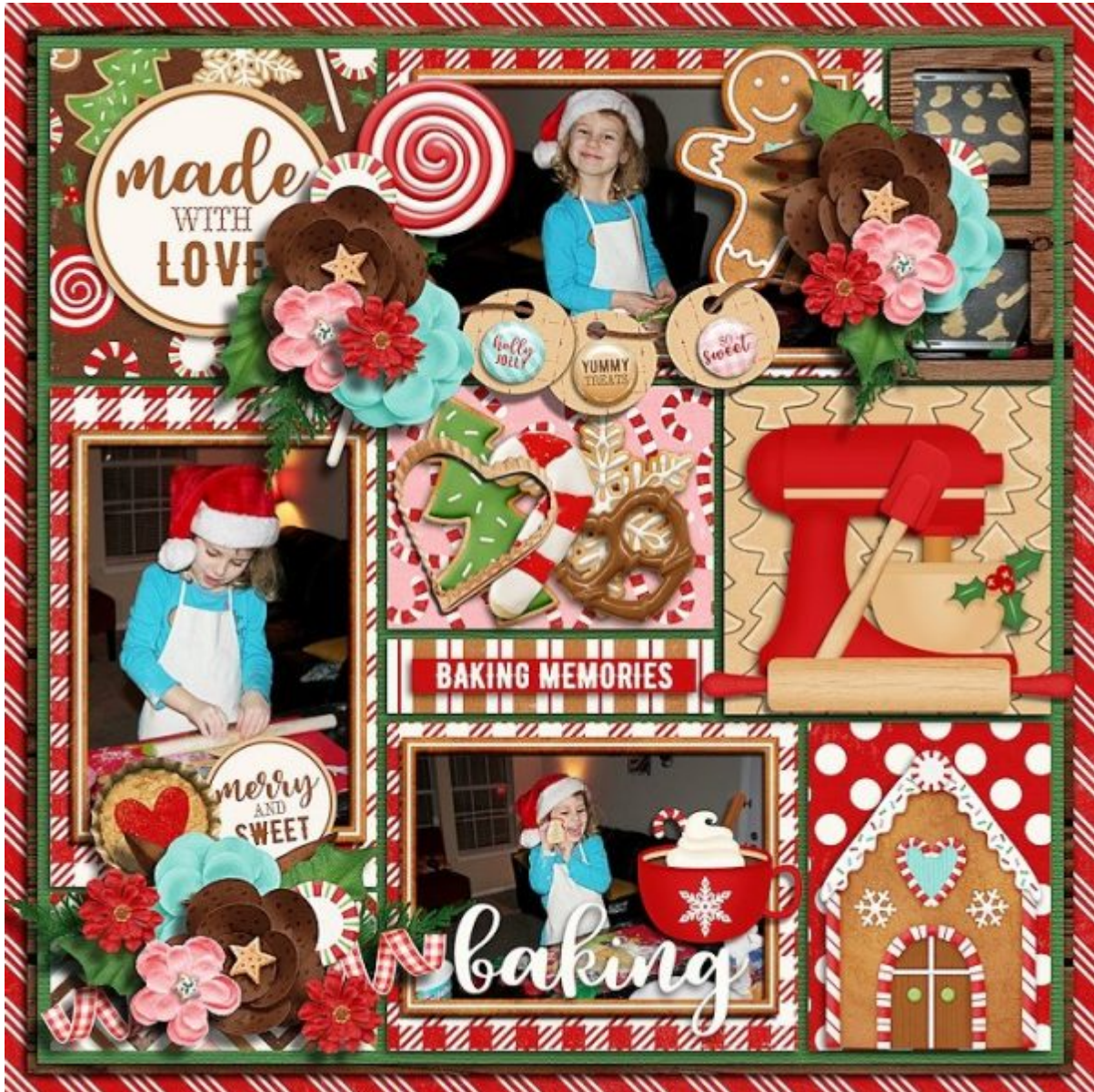
Project by Ellaspace