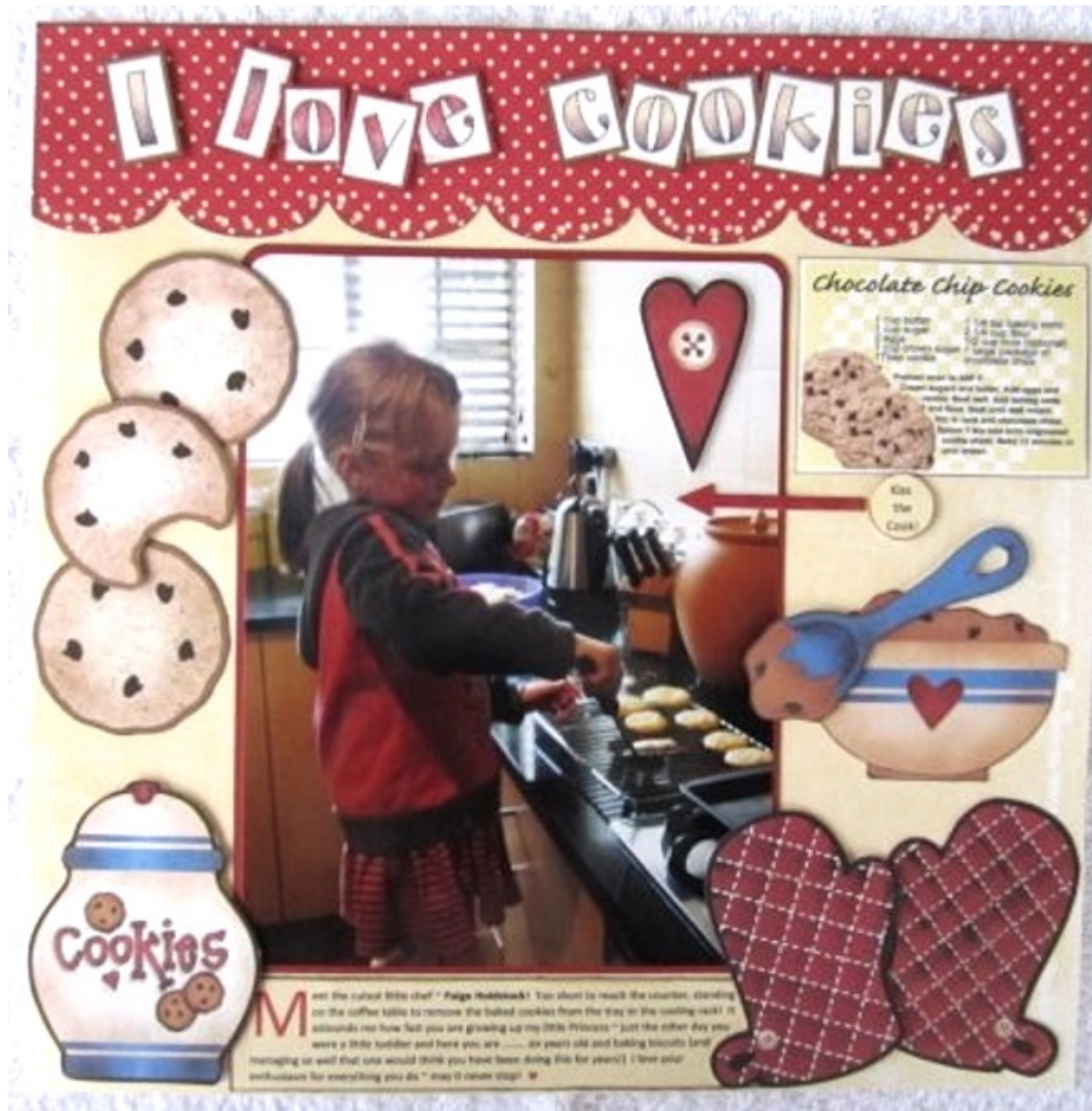
Project by Bridge