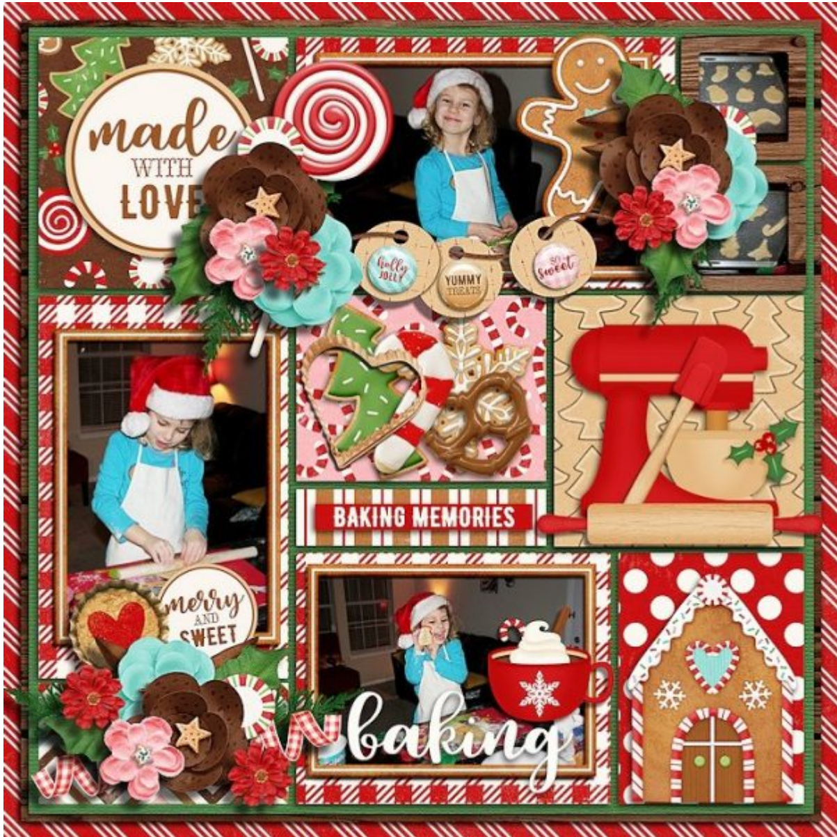
Layout by Ellaspace