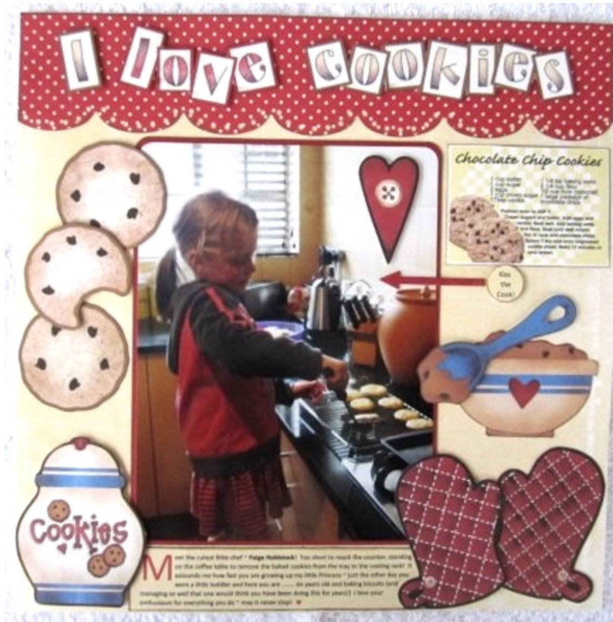
Layout by Bridge