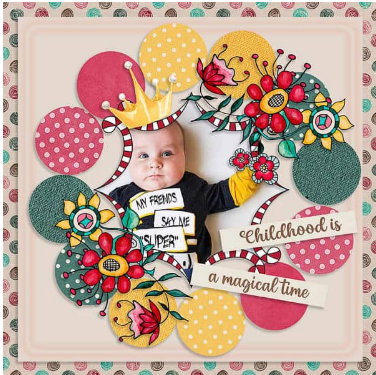
Layout by Valentina Zotova