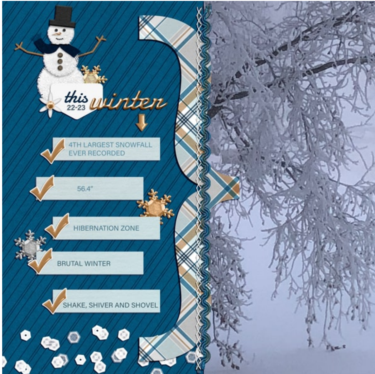
Layout by Sara Paschal