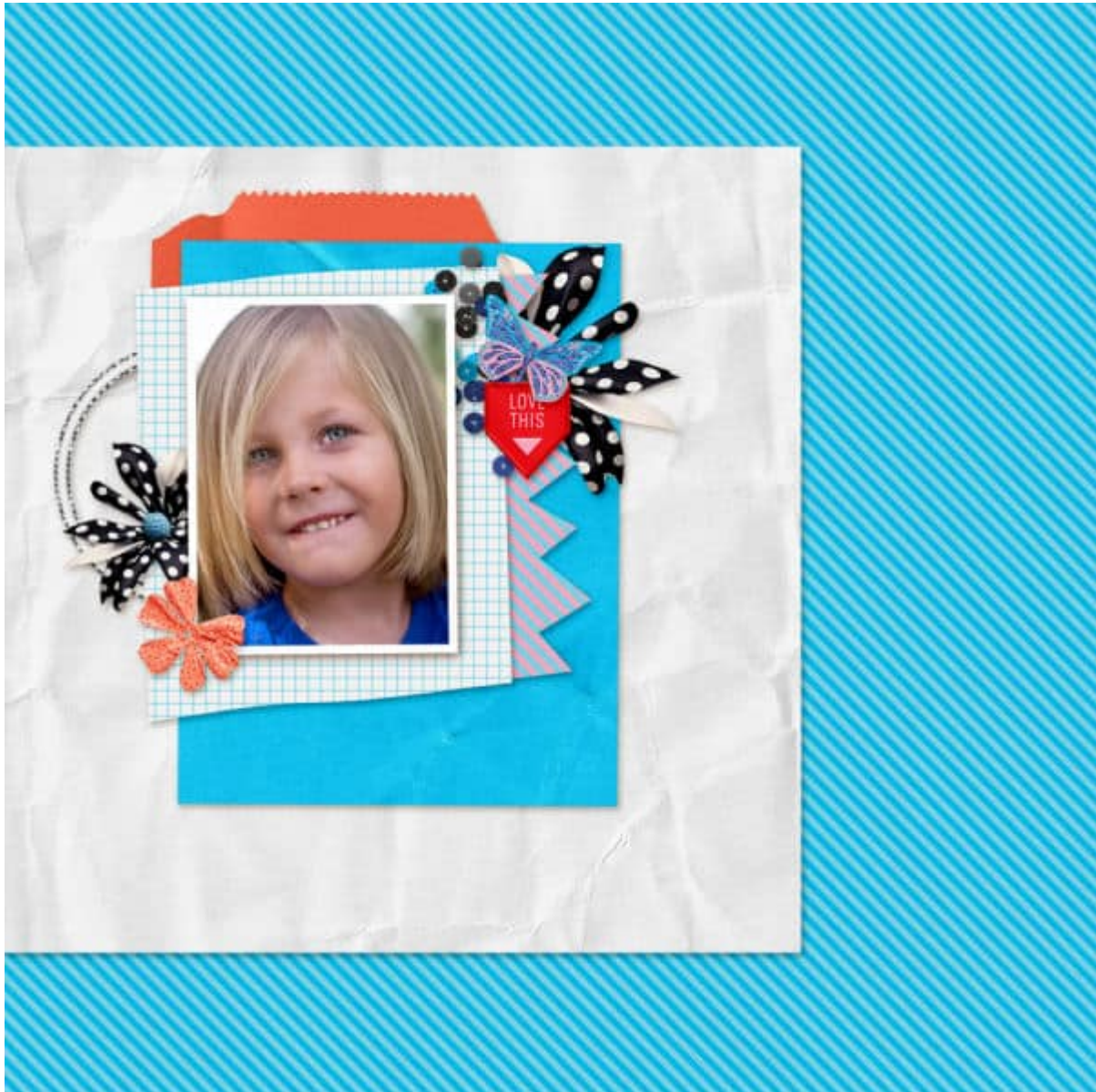
Layout from Lady22

Another way would be to invert colors in two different sections of your page.Â