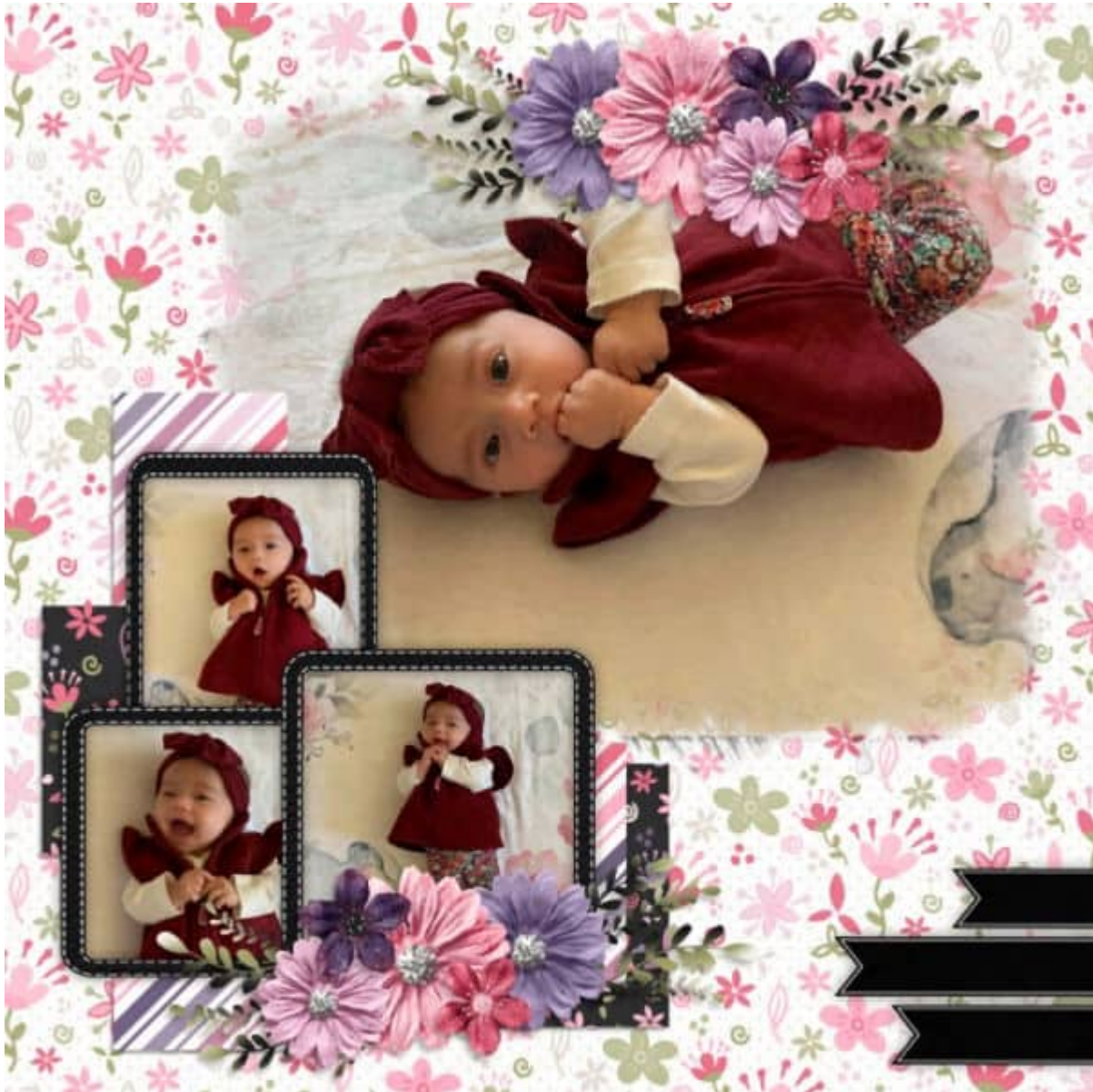
Layout by Joyce Ford

Each type of alignment creates a unique look and can be used in a variety of ways to create a cohesive design on the page. With a little practice and experimentation, you can create beautiful scrapbook pages using alignment. You might have a favorite type of alignment. On the other hand, maybe you are using alignment without even thinking about it. Have a look at your favorite scrapbook layouts and see if you are using one of these types of alignments.