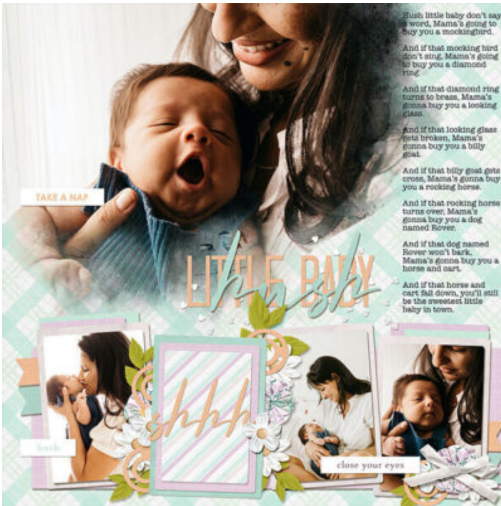
Layout by FL-Karen