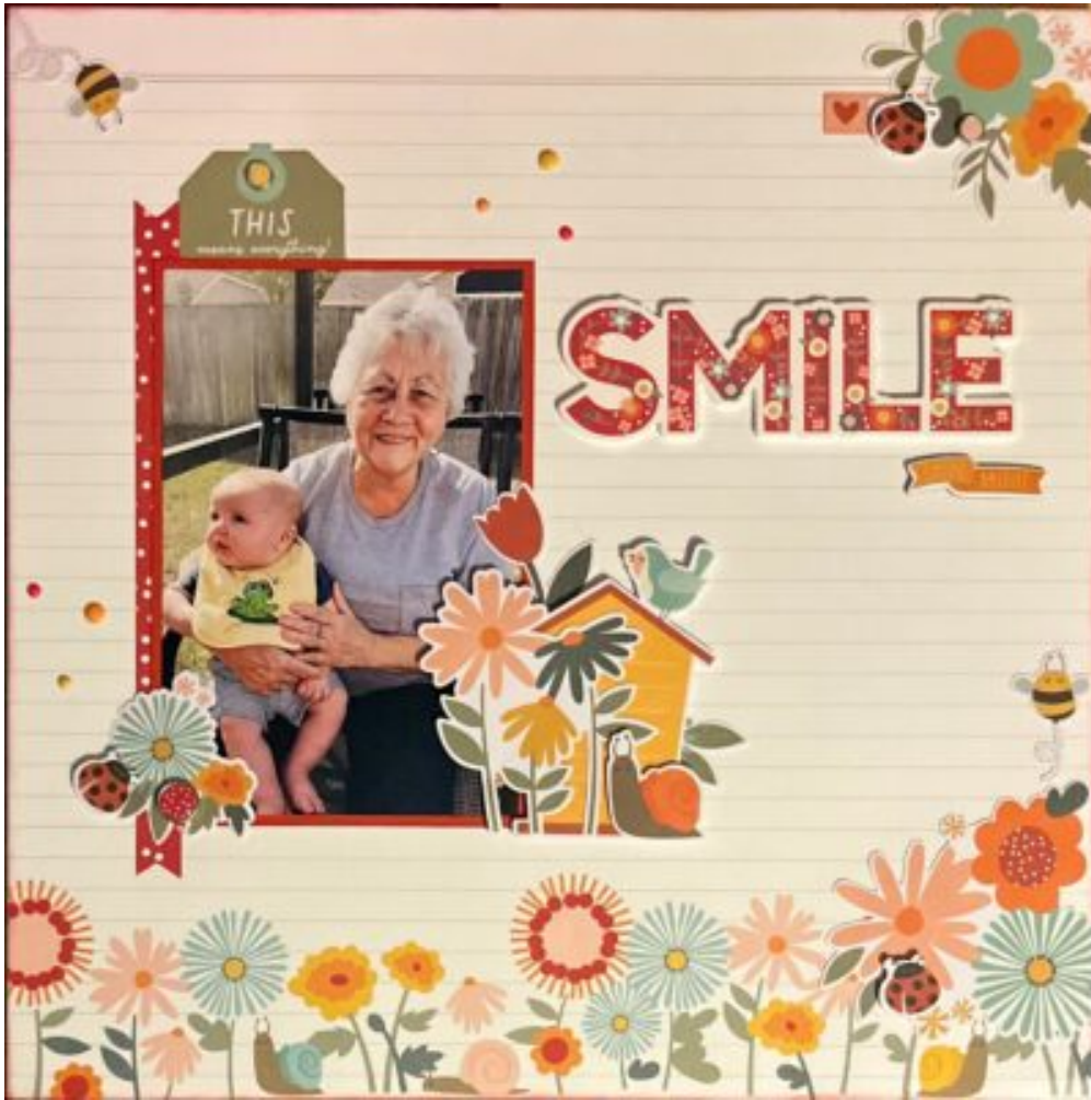
Layout by Ozelle