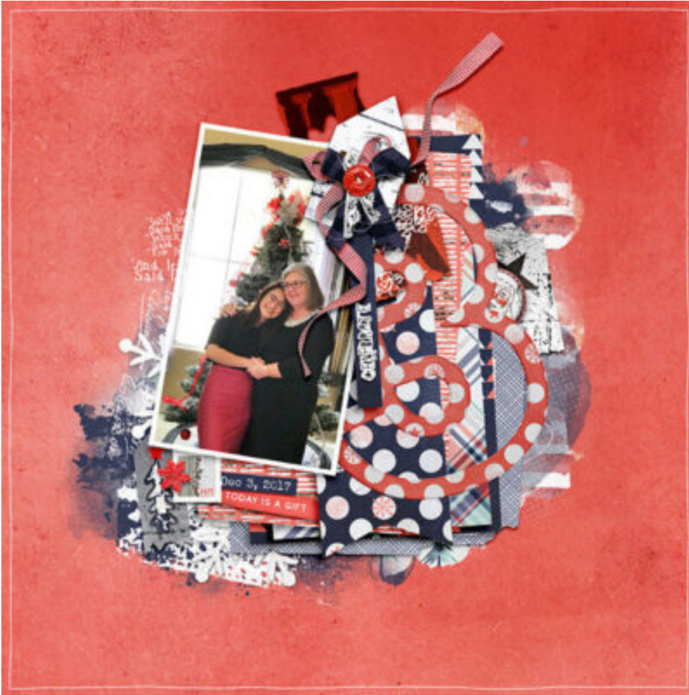
Page by Kimgoon