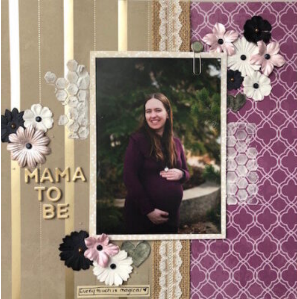
Layout by Scrapanda