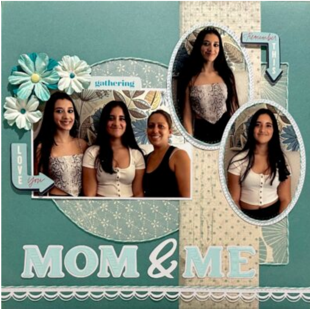
Layout by Trish