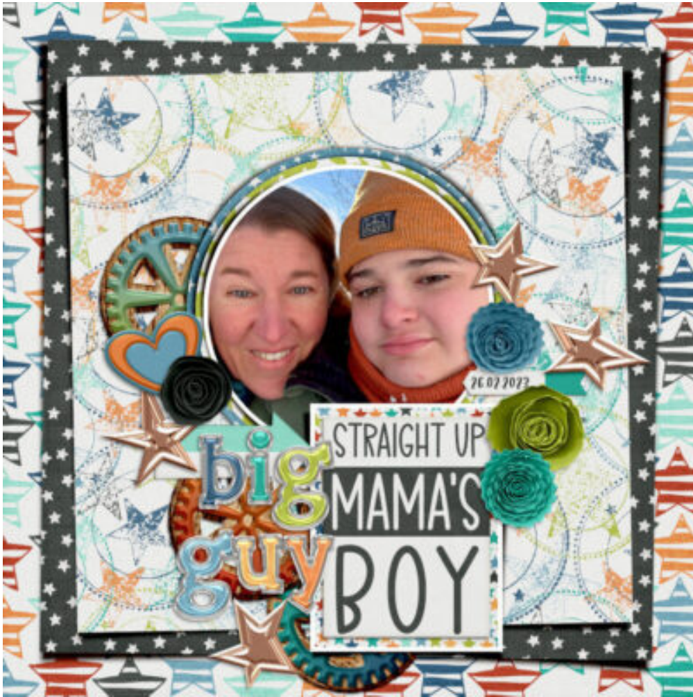
Layout by Mara