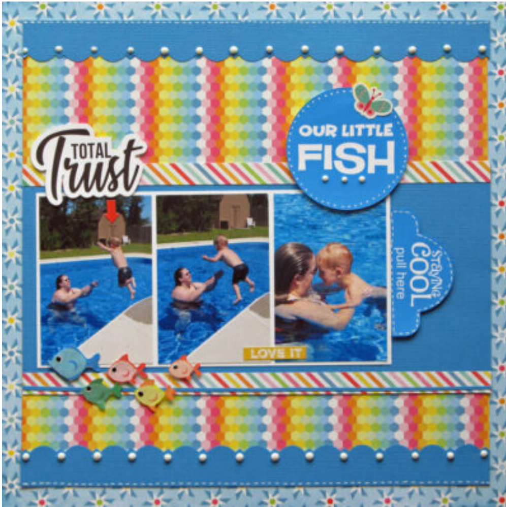
Layout by Sgoetter