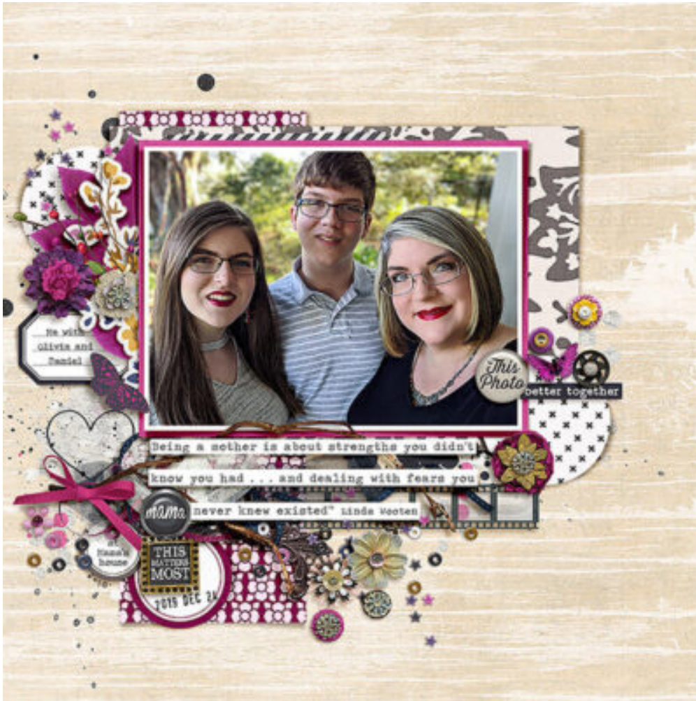
Page by Cheryl