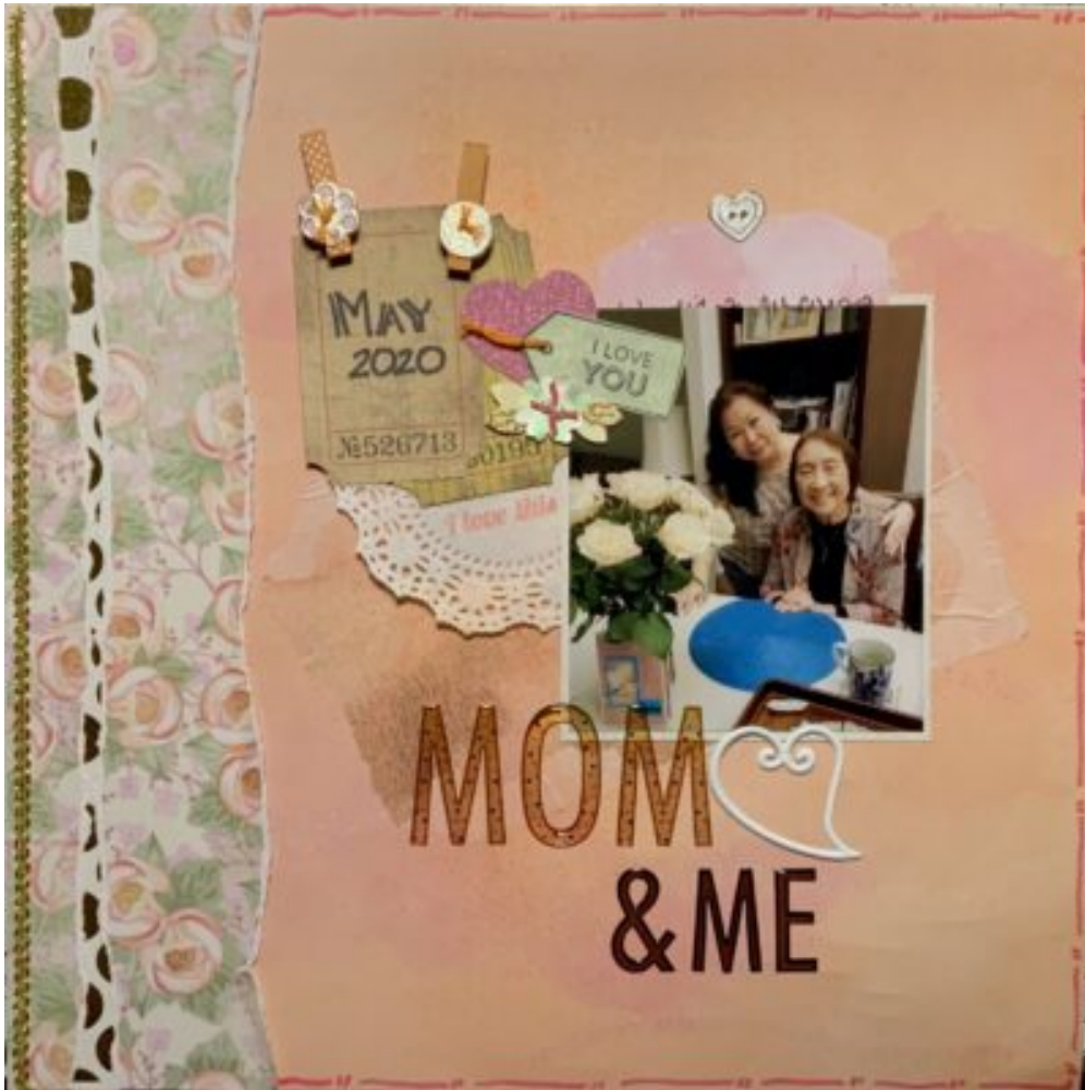
Layout by Elissa