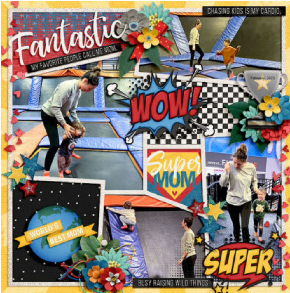
Layout by Tammy