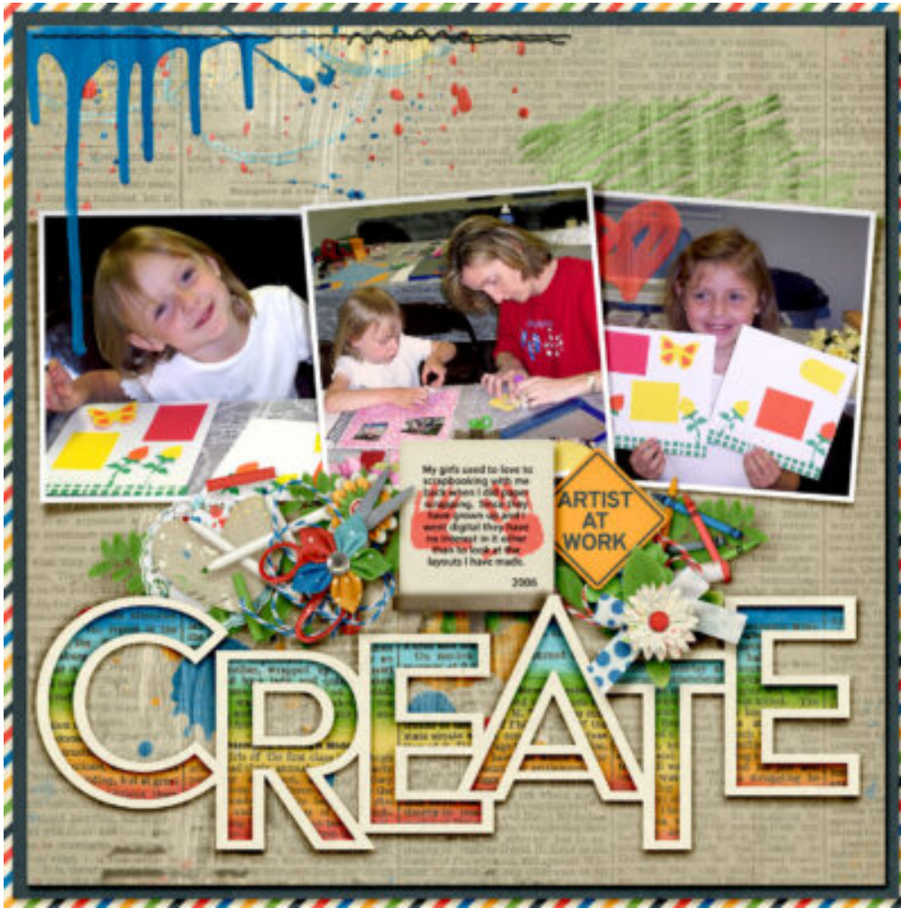
Layout by MugShotMomma