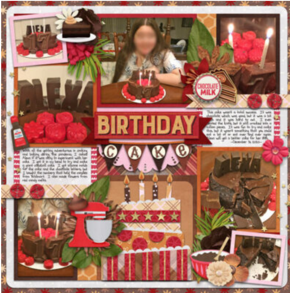
Layout by LynnZant