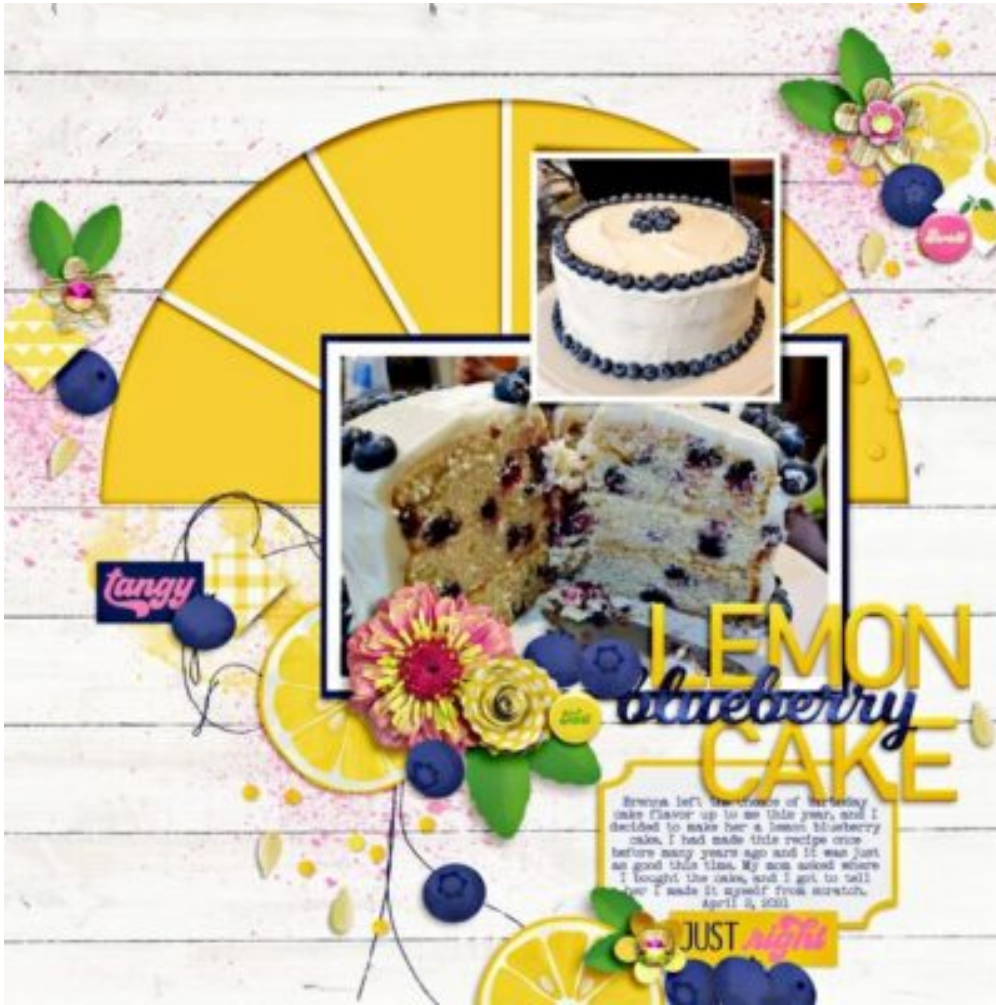
Layout by Melinda