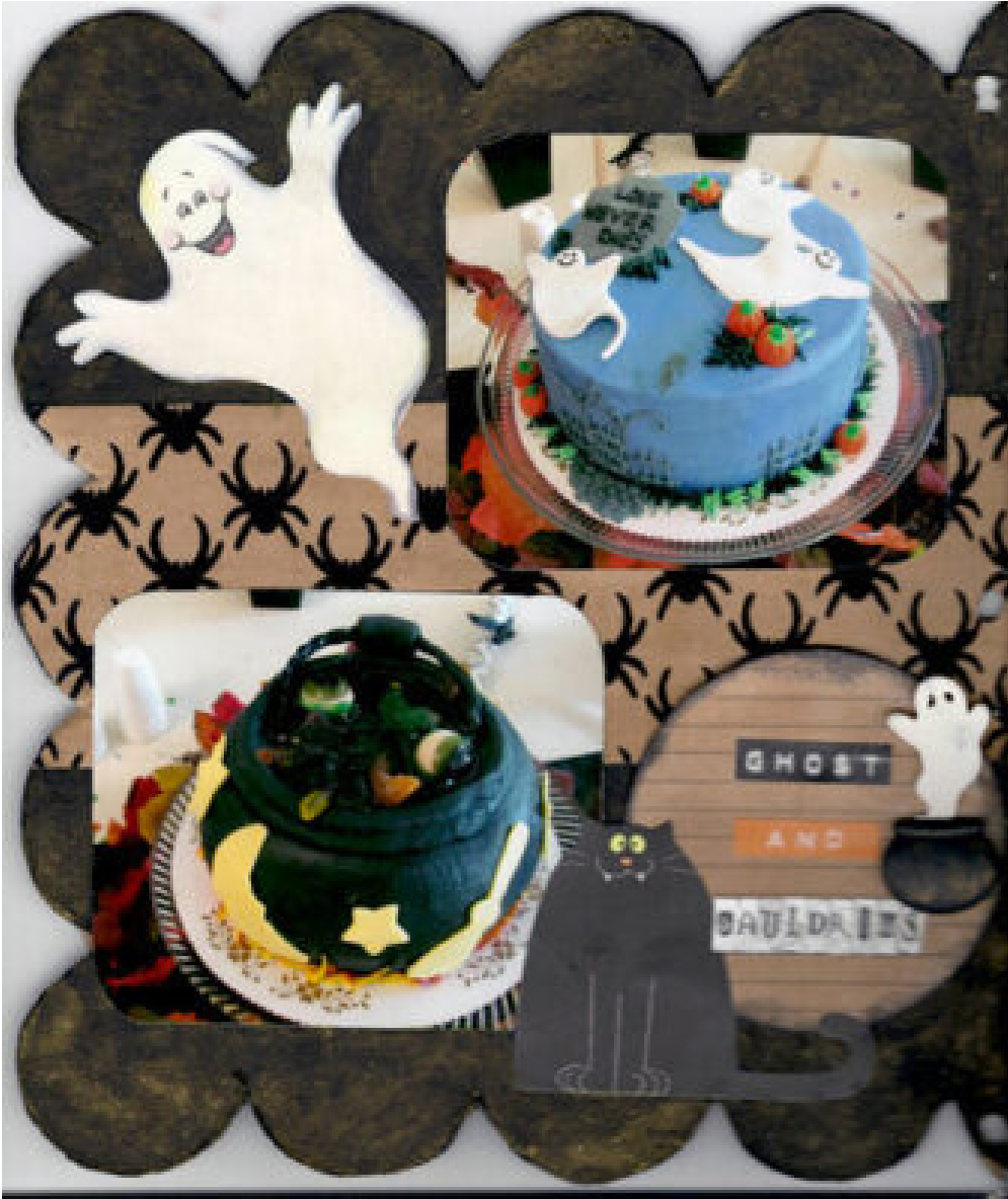
Layout by Donna