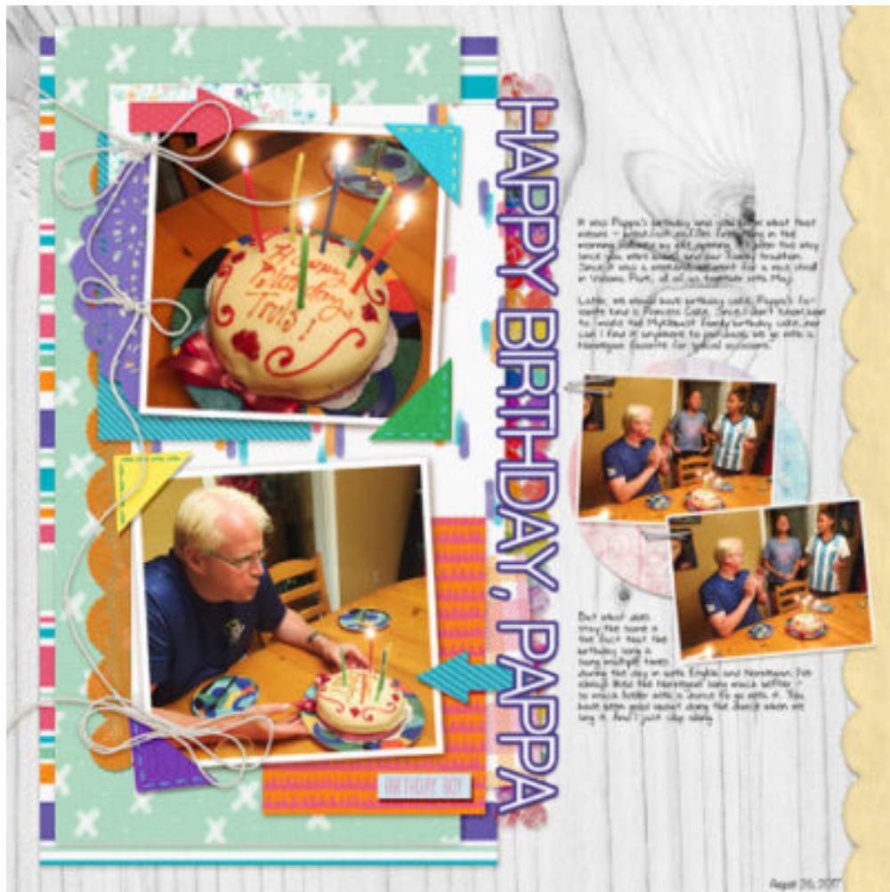
Layout by Linda