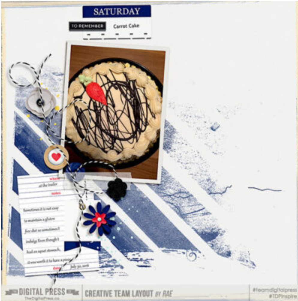
Layout by Rae