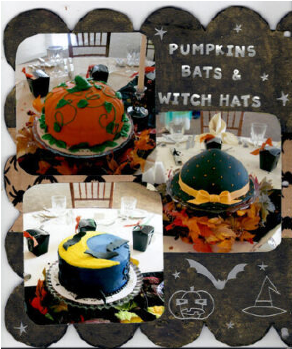
Layout by Donna