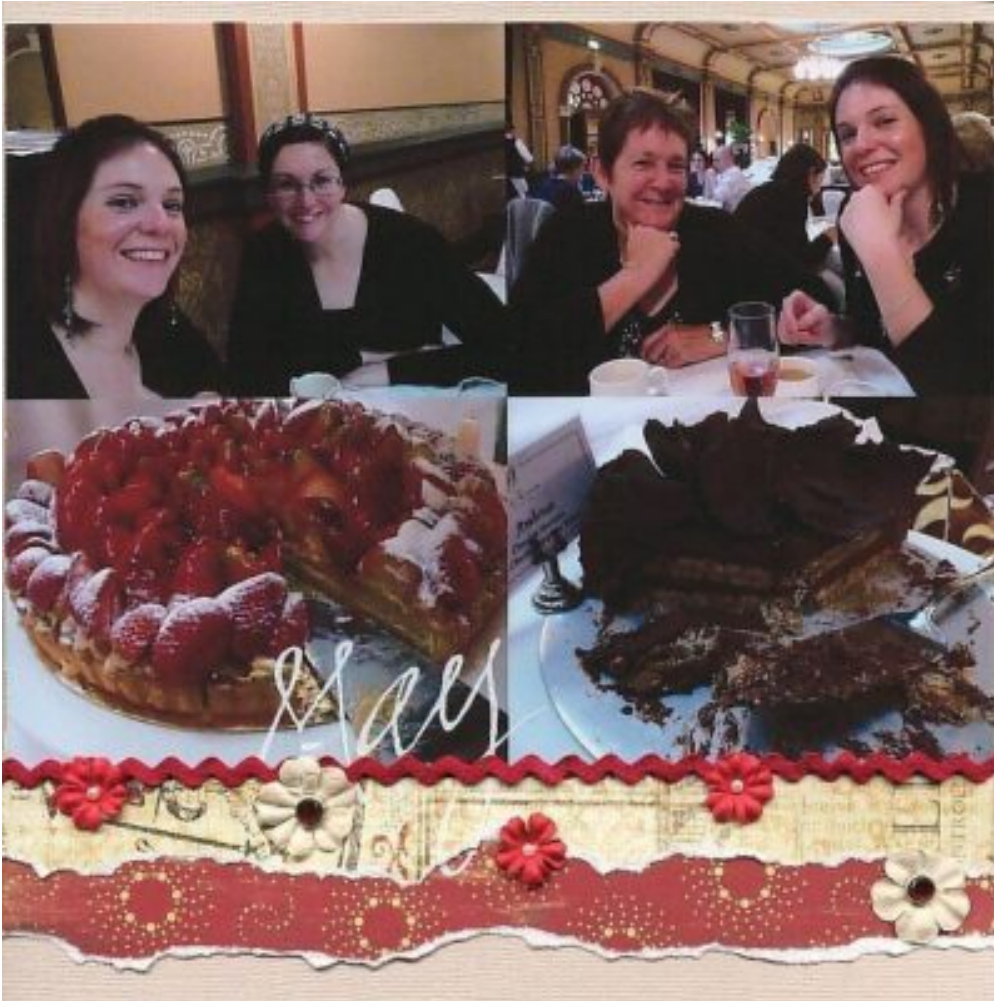
Layout by Karen