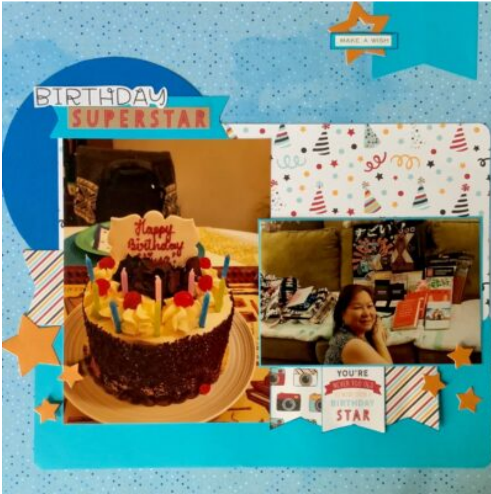
Layout by LIS