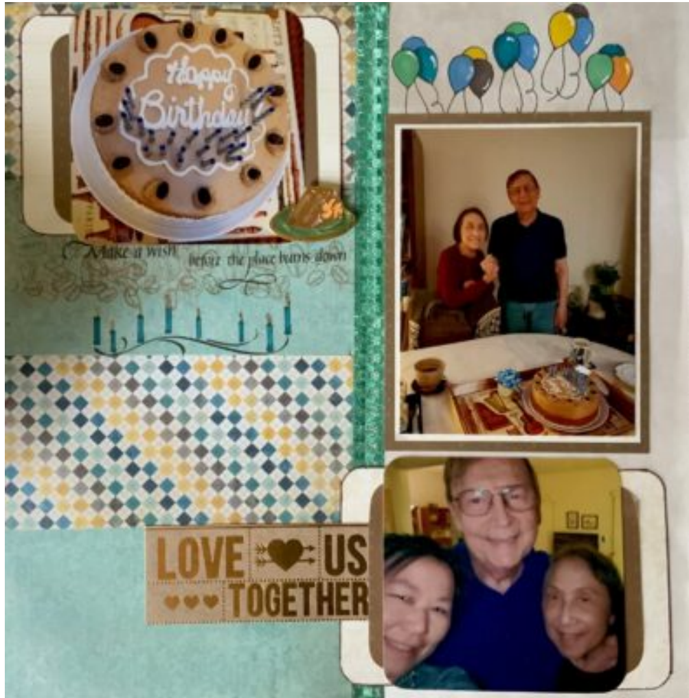
Layout by LIS