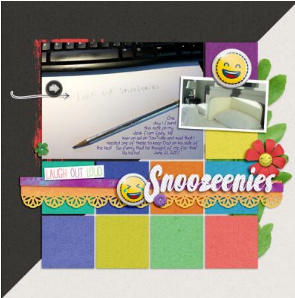
Layout by Karen