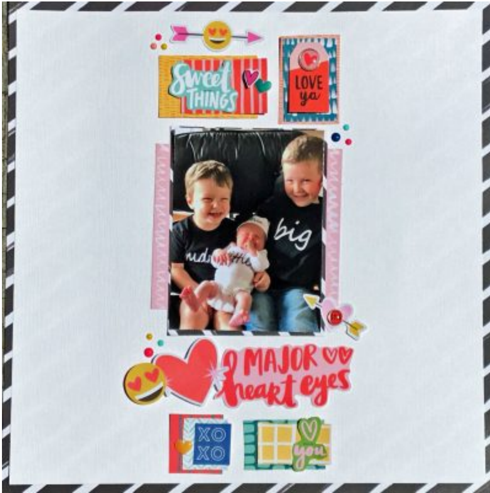
Page by Dottie