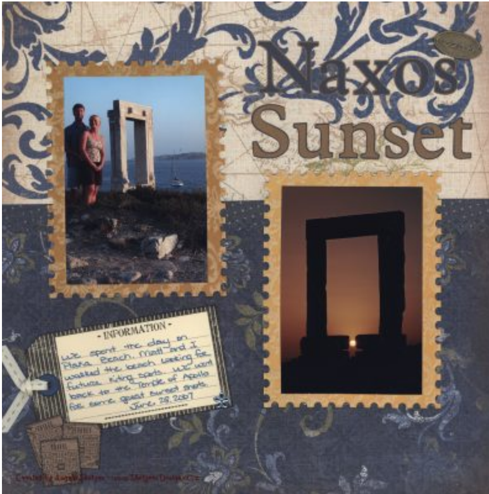
Page by Angela