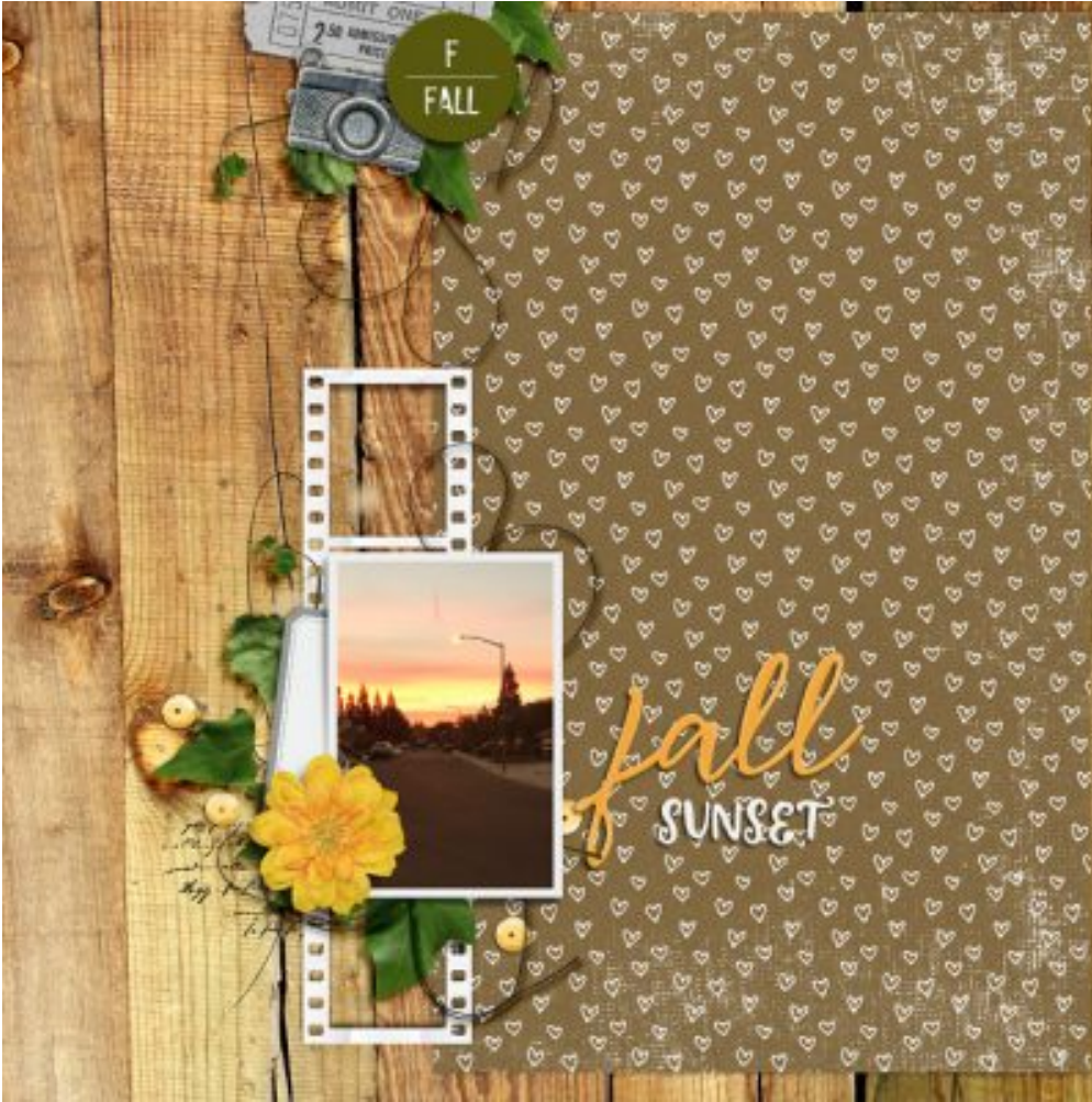
Page by Carrie1977