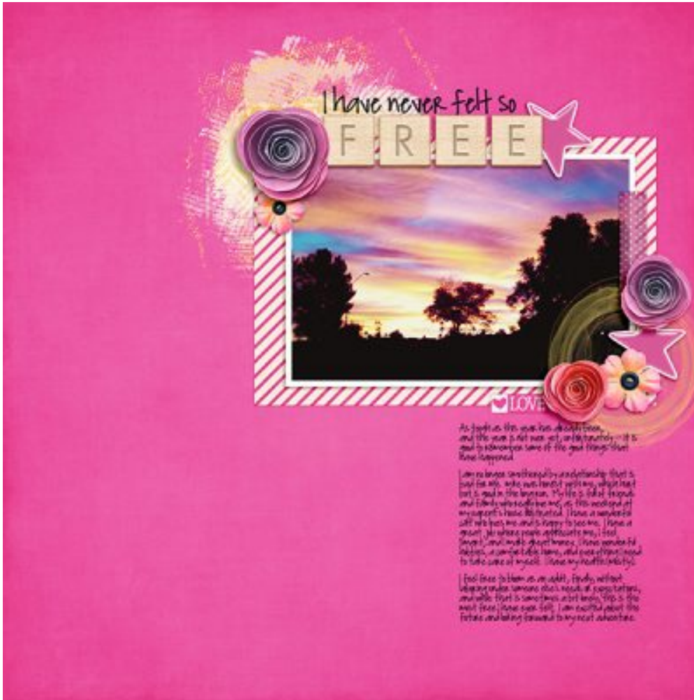
Layout by Kcvance