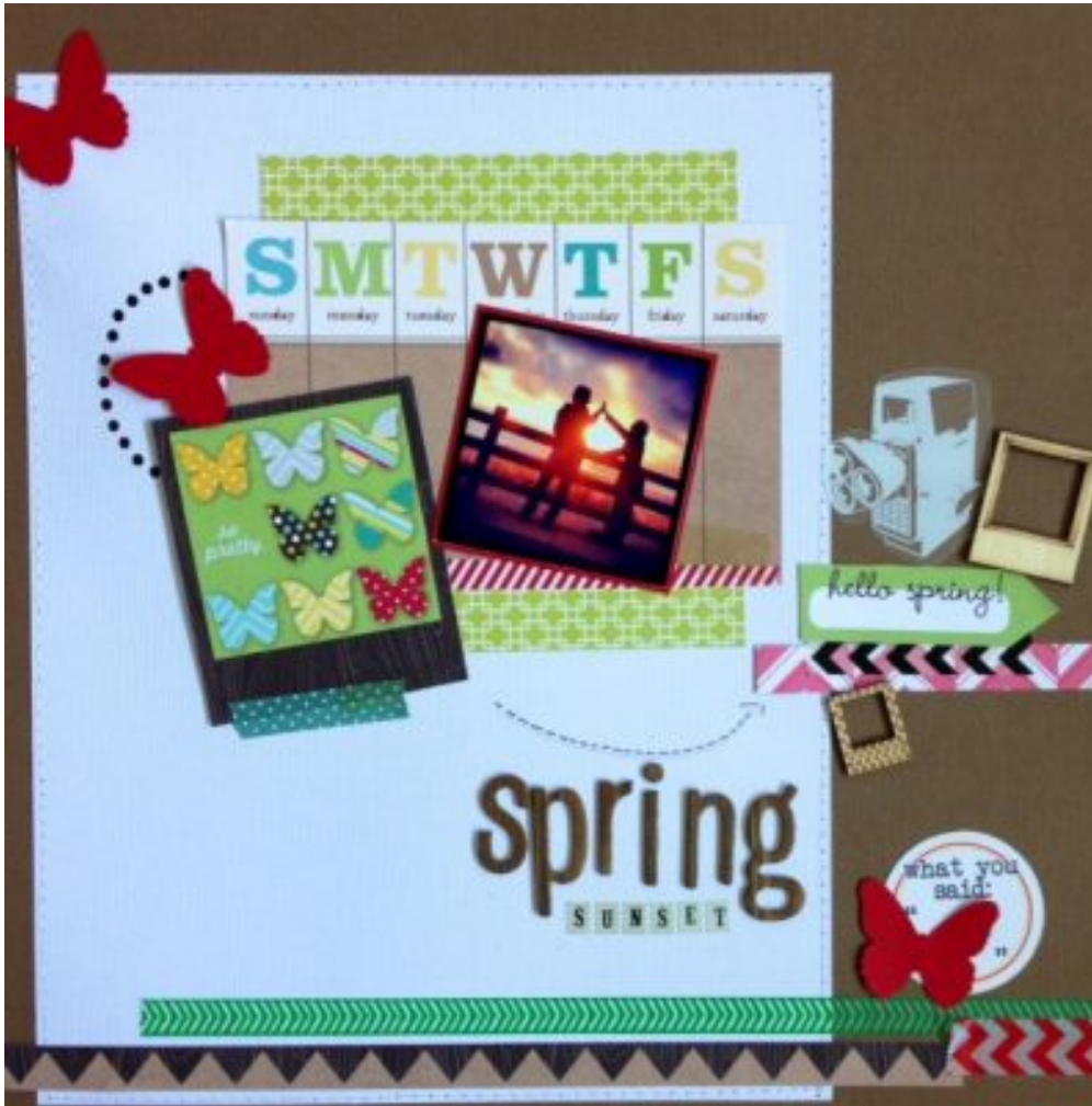
Layout by Carmen C-Henriquez