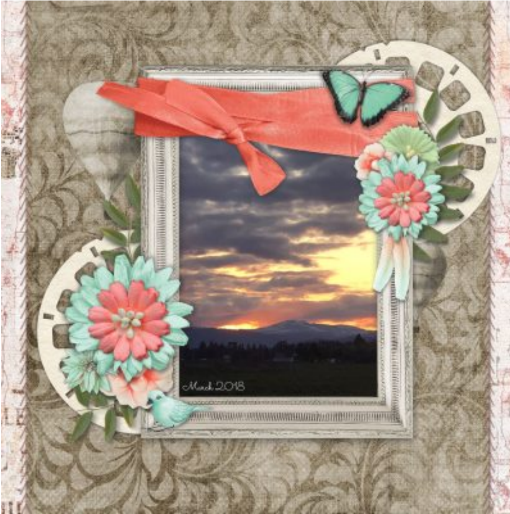
Layout by Crazsquaw