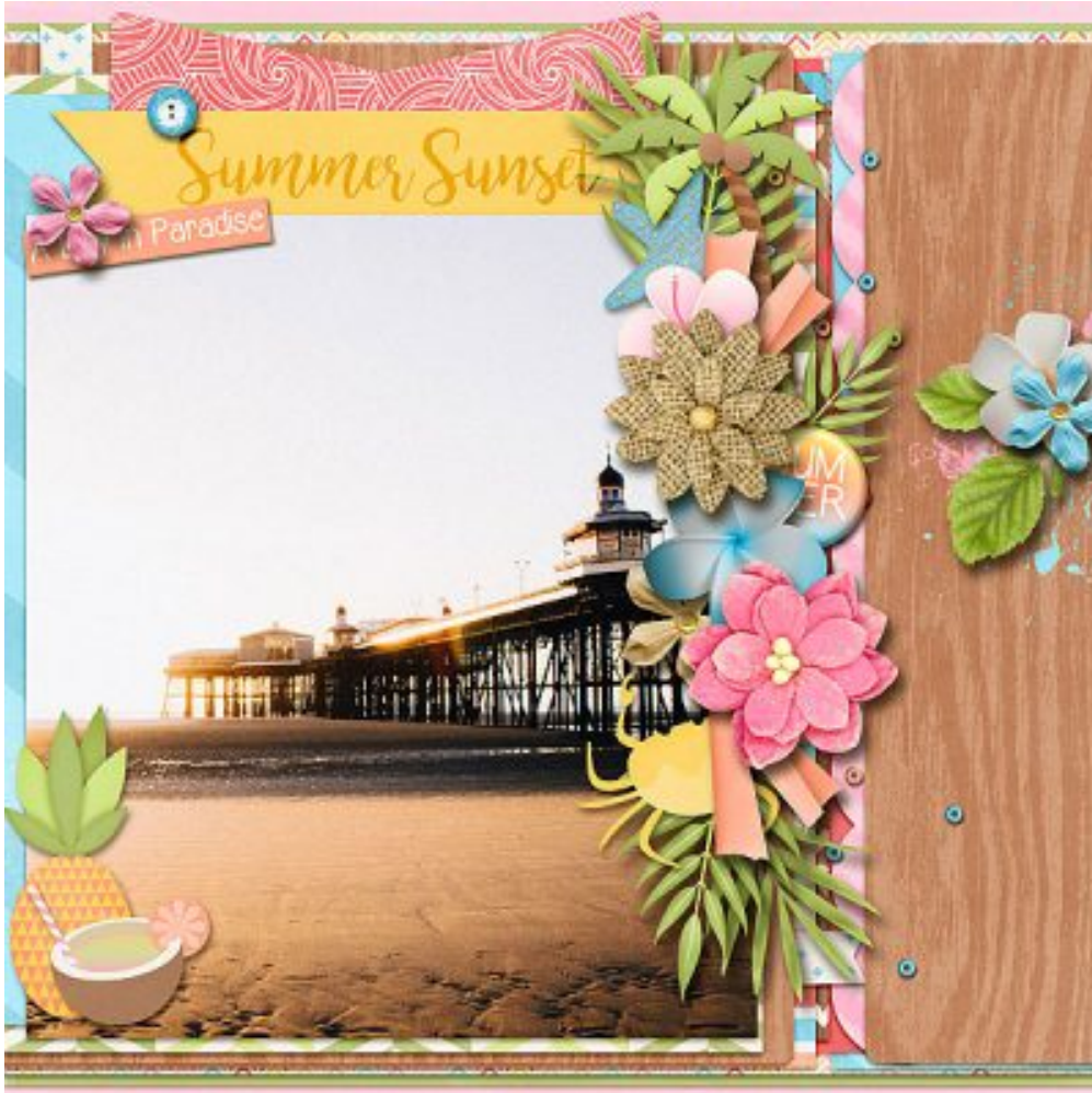
Layout by Robin