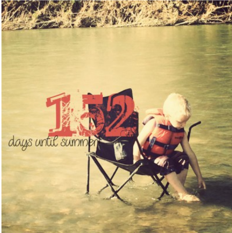
Layout from justjen8

There might be other ways or reasons you can use a large photo. Maybe you just like to use big photos. And that is quite ok too. But remember that with digital scrapbooking, you have a great advantage over traditional paper scrappers, in that you can use photos as large as your whole layout, and if you have the photo for it, why not take advantage of it. Minimal decorations will just let the photo speak, and if a photo is worth a thousand words, you might have a great story on your page!