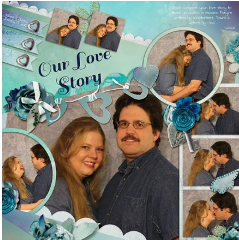
Layout by Alquafea

There is much more to say about a love story that lasts years than just what happens on one single day.