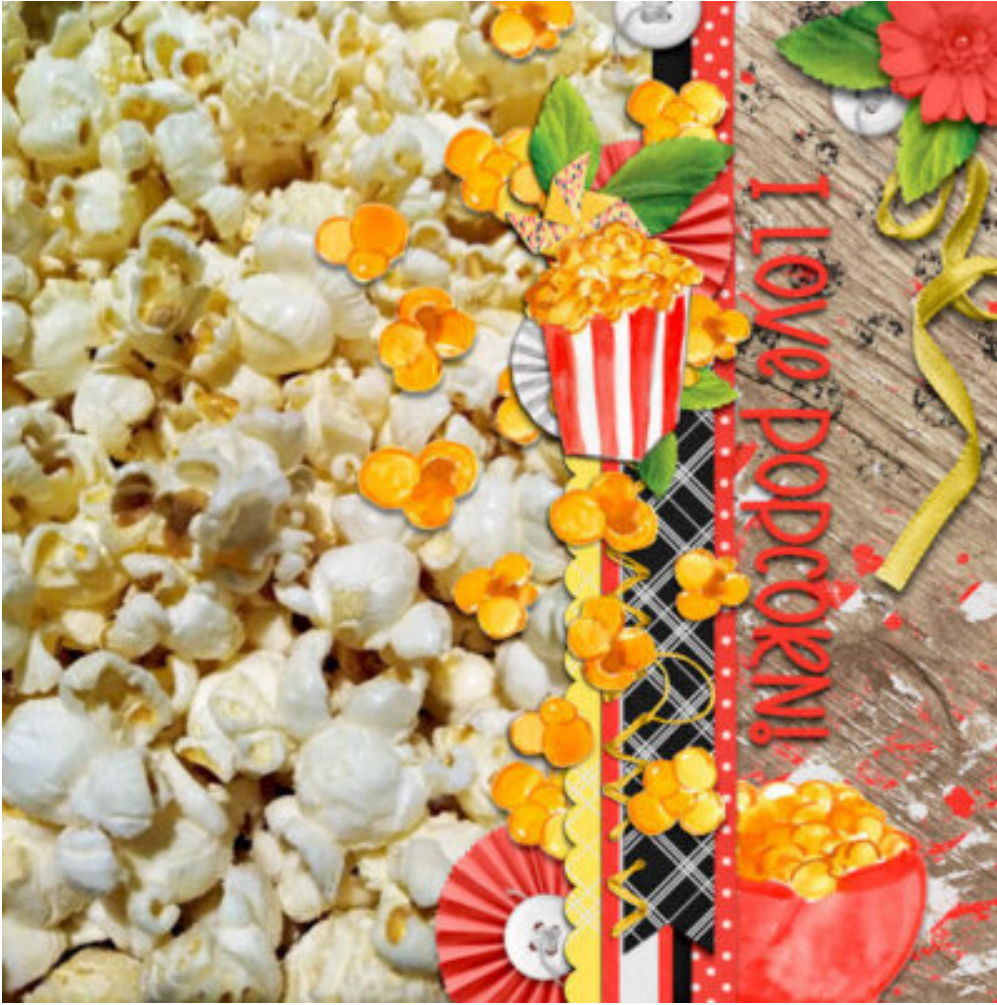
Layout by Eva