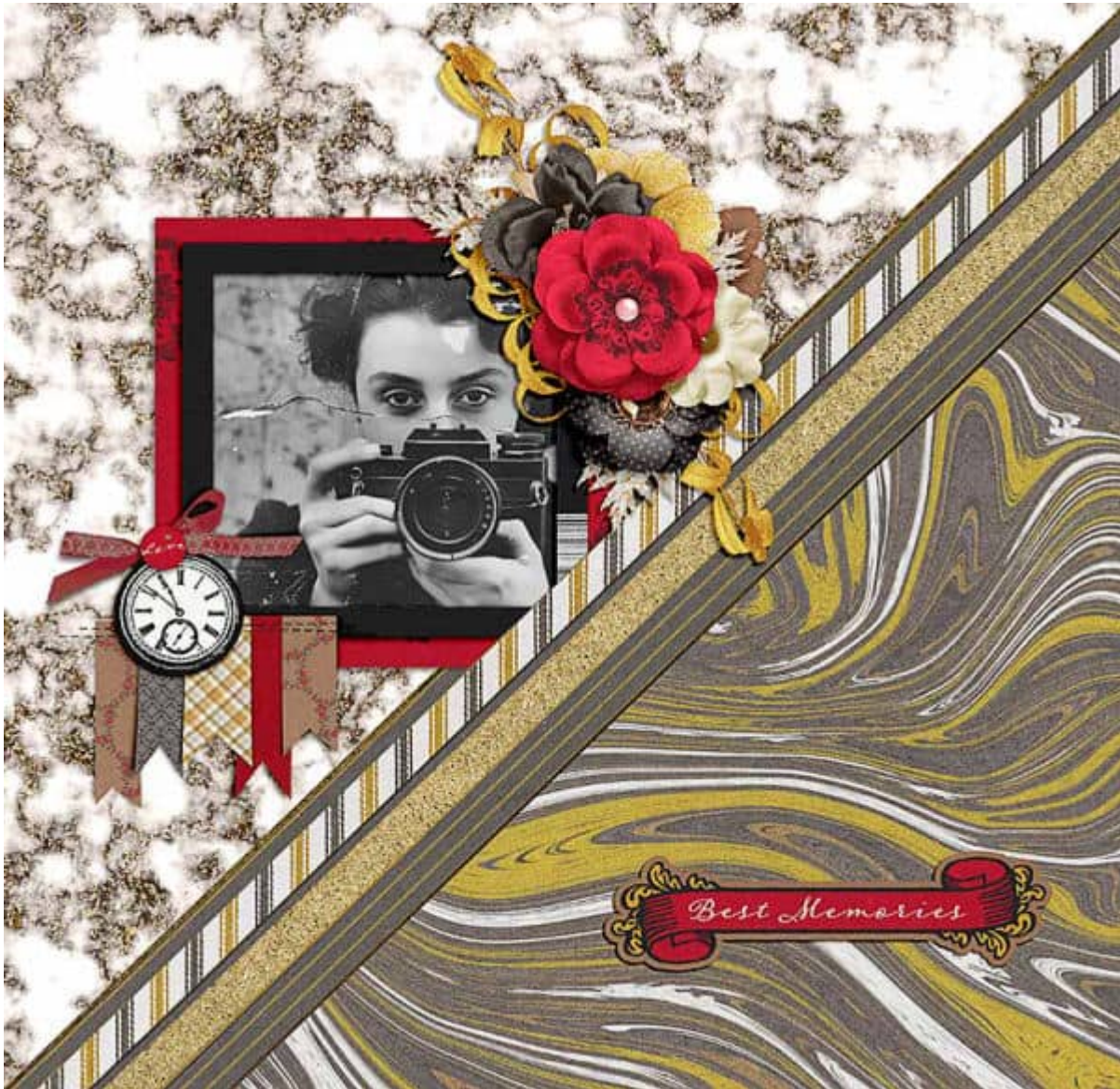
Layout by Valentina Zotova