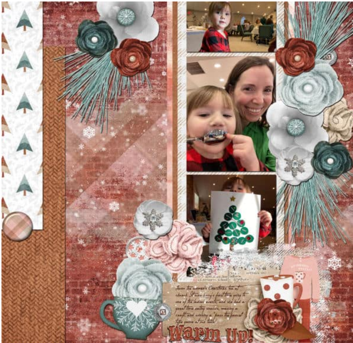
Layout by Becky Wooler

Although papers can be cut in strips, you can also layer them in a way that will create a visual line.