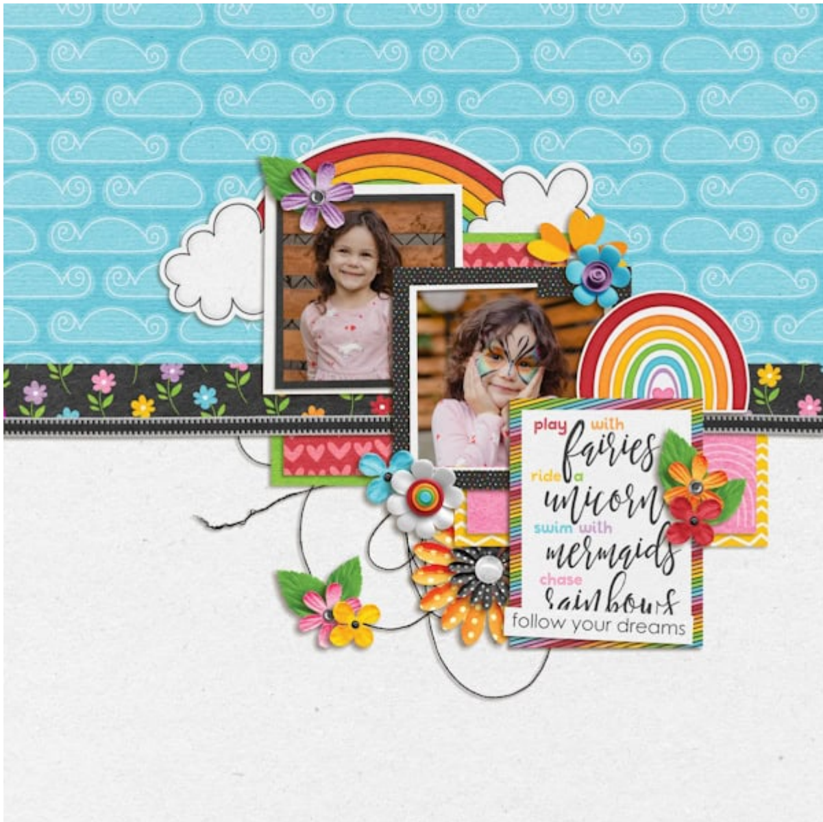
Layout from Lou Smith