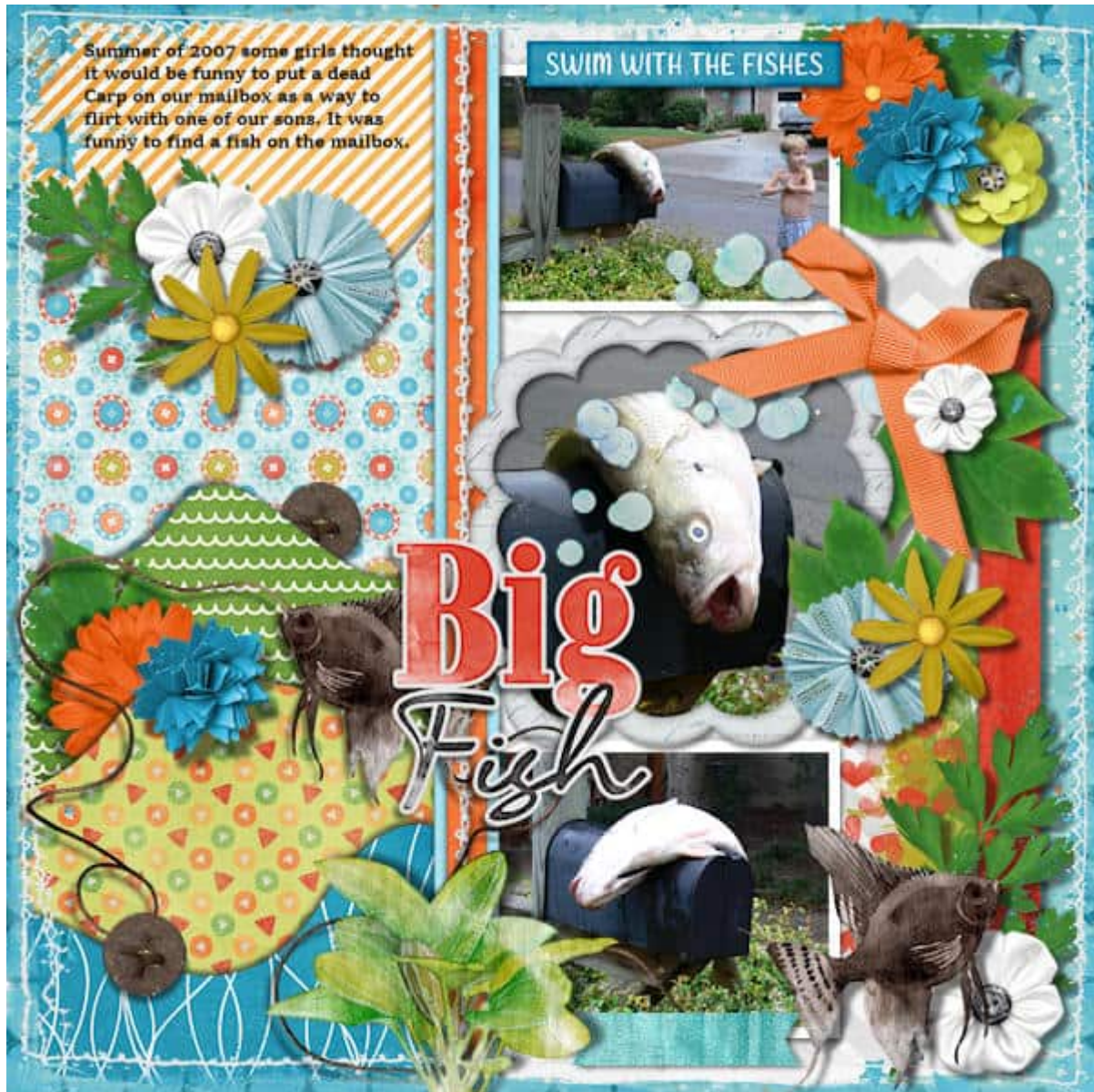
Layout by Deanna Patterson

This time, two ribbons serve as a single divider. You can combine as many as you want for unique effect. Here, instead of mirroring the content on both halves, the divide becomes the central point where all the elements gather. Everything touches that divider.