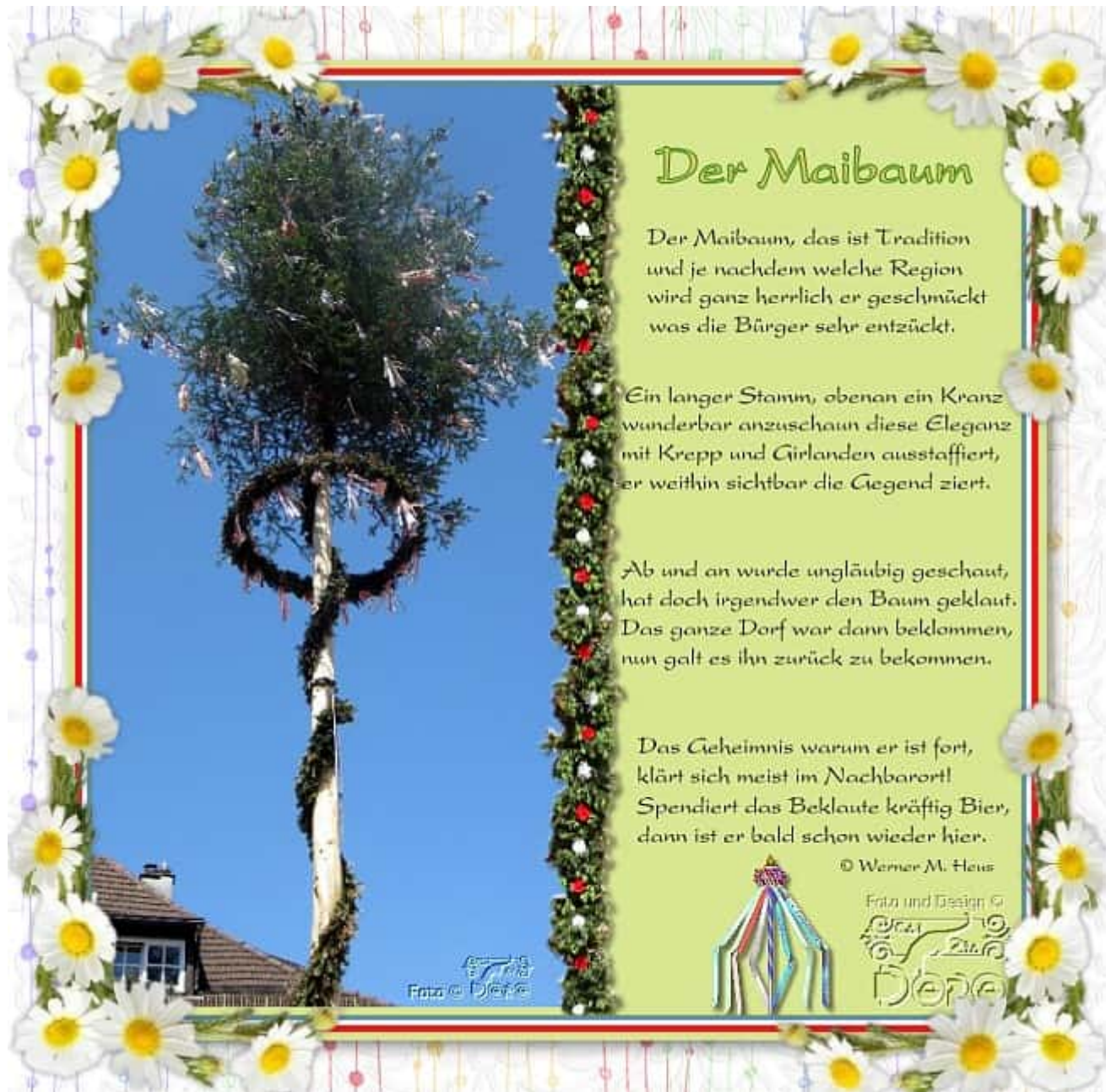
Layout by Doska

If you are using PaintShop Pro, you can use many of the picture tubes available to create your own divider.