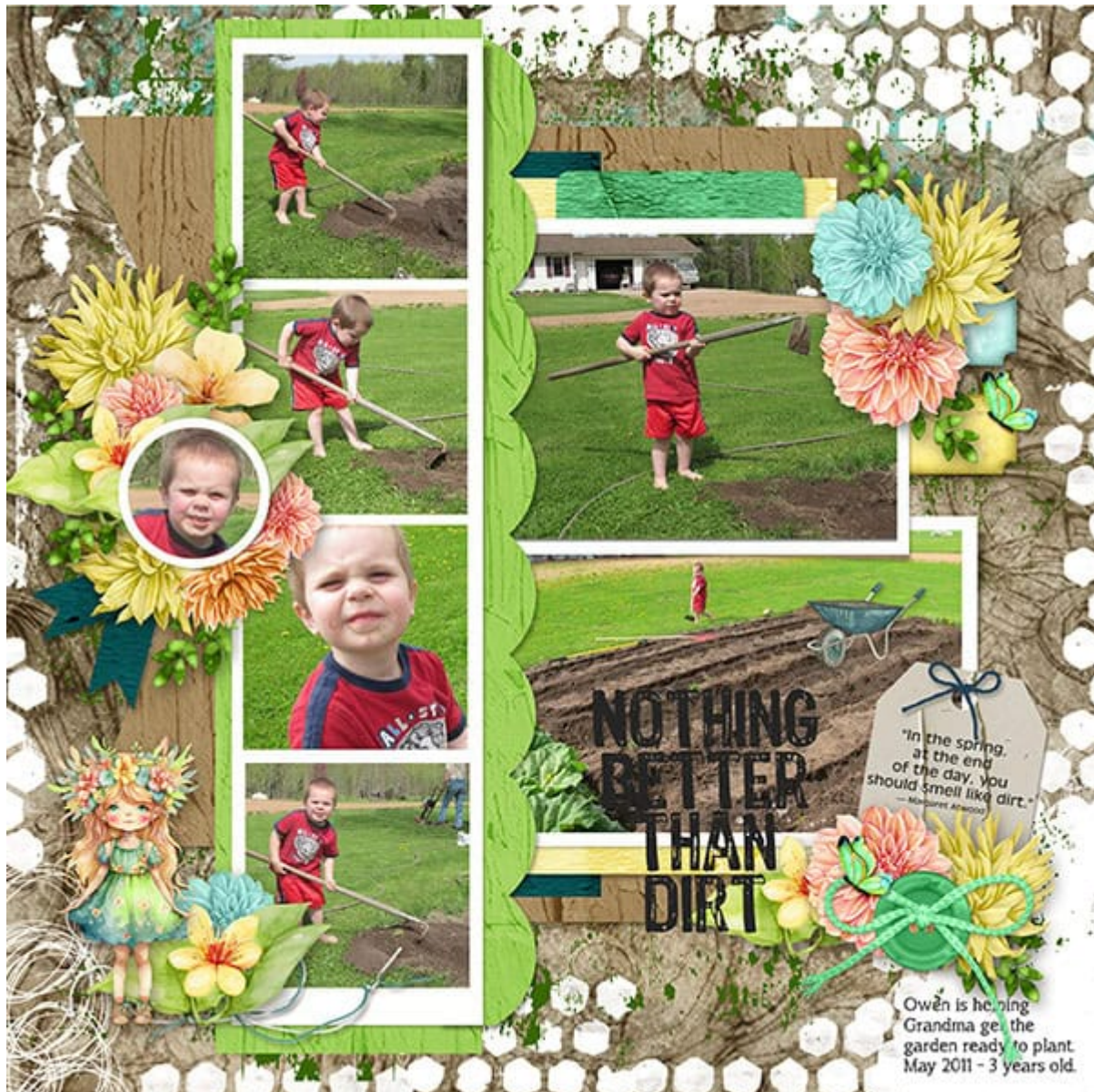
Layout by Joyce Korenuk