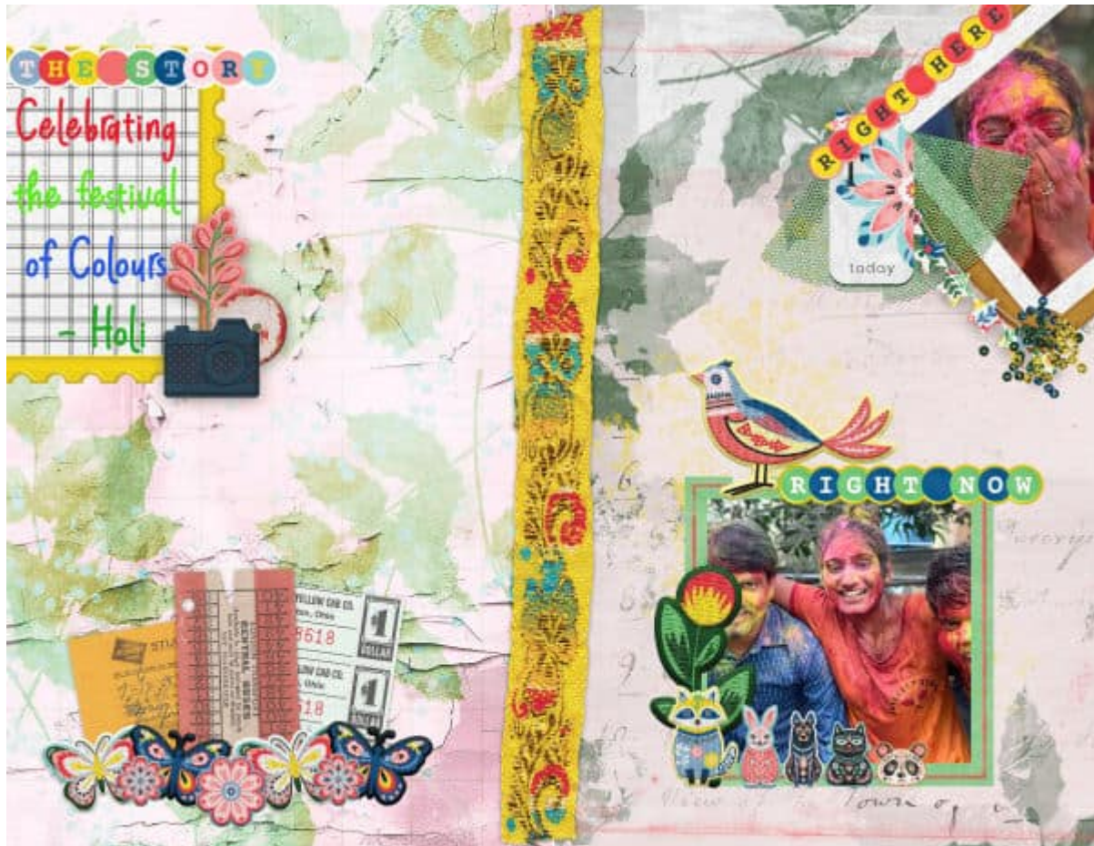
Layout from Chitra David

Even when the page is split in half, it does not mean that the central area is off limit. In fact, you can even use it as a way to bridge both sides. In this layout, one half is filled with one large photo, while the other side showcases some decorative elements. The small photo then bridges those sides by overlapping that dividing ribbon.