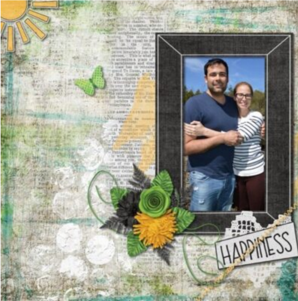
Layout by Maureen