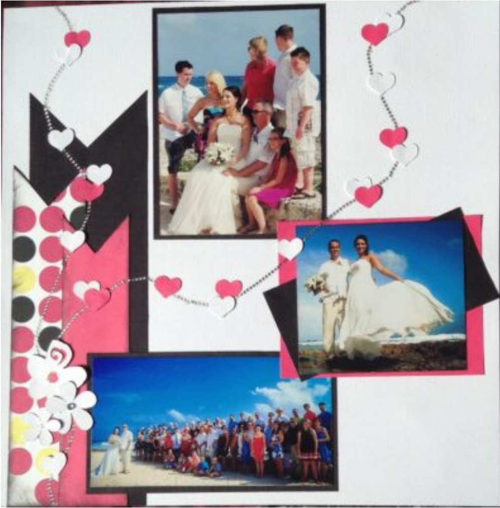
Project by BLB400