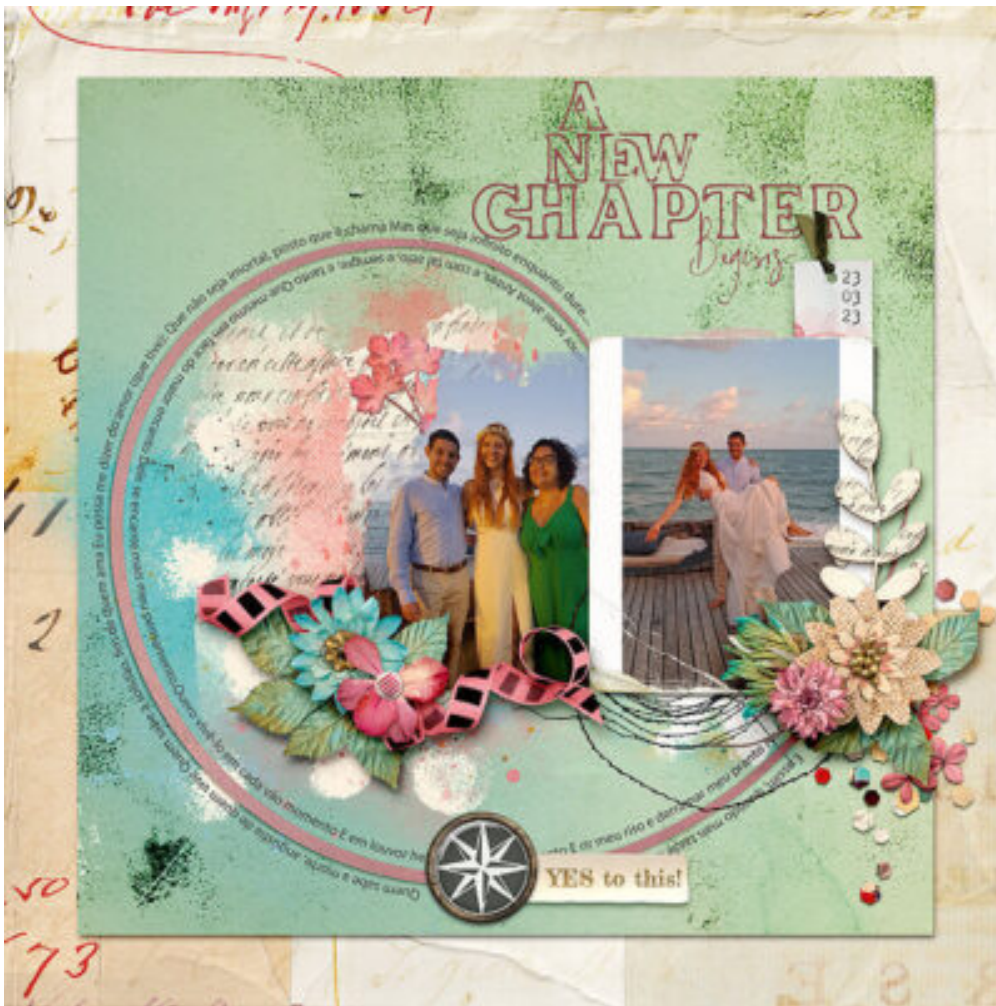
Layout by Ferdy