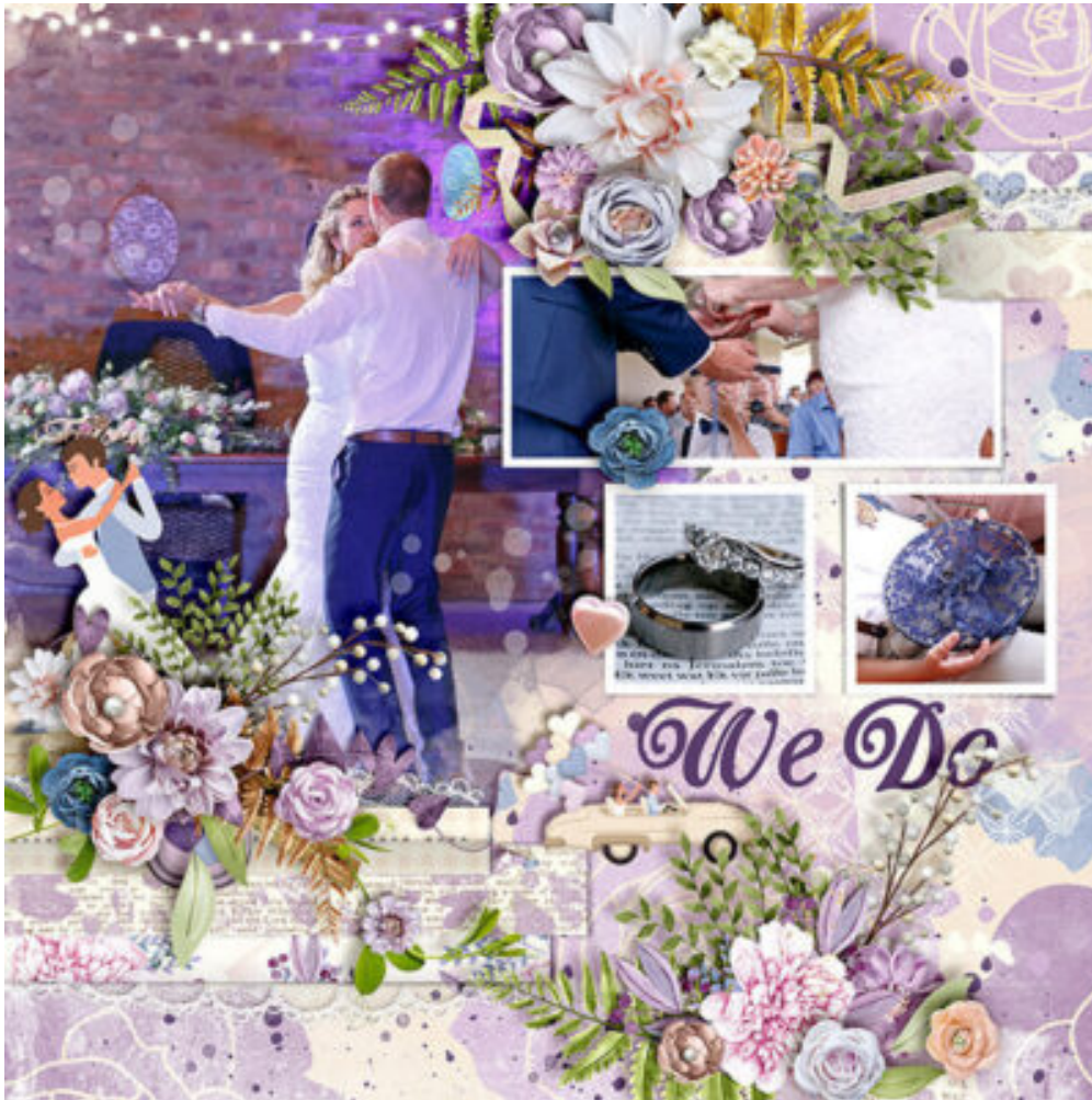
Layout by Christelle