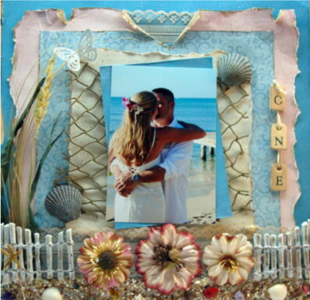
Layout by Donna