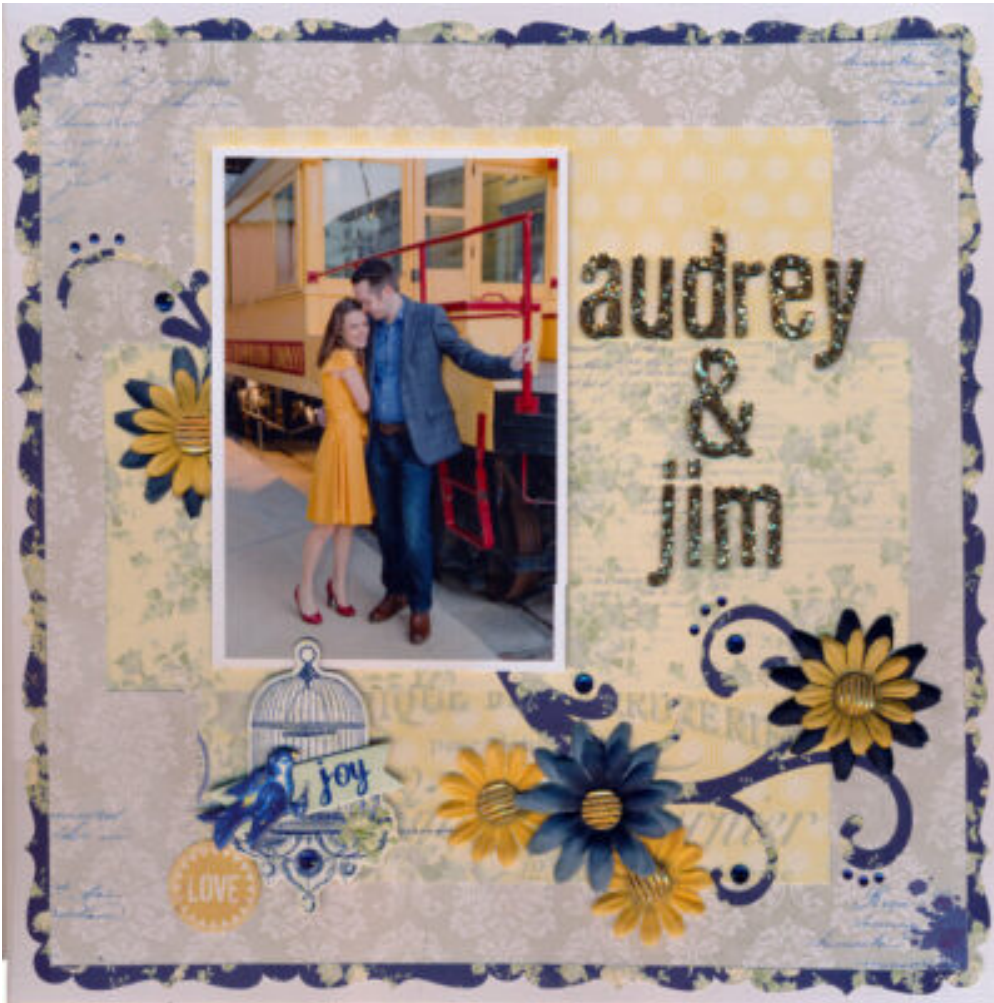
Layout by Susan