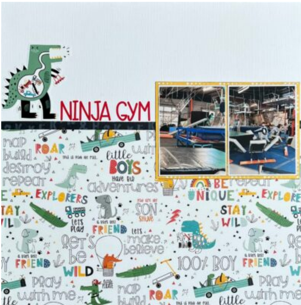
Layout by Kariyava